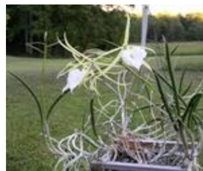
B. nodosa 'Brecko-Nova'

Armacost, 1952, great pink and superb stud plant used to make some of the best pinks and lavenders that exist. One of the parents of Sylvia Fry and Ranger Six. Established plant in 6" pot with 6 growths.