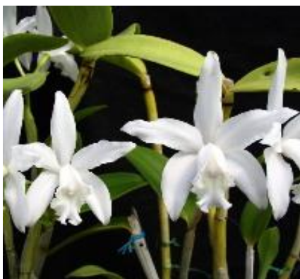
C. intermedia alba 'Breckinridge Snow' (Breckinridge Snow on left)

Lenette stud plant, one of the most beautiful, intense orange with red lip orchids I have ever seen, only one division has ever been released. Awardable. Bare root 4 bulb division.