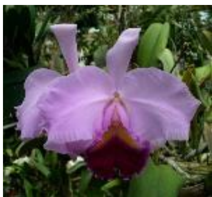
Lc. Paradisio 'Colossal' HCC/AOS

Stewart's breeding, 1968, large pink similar to Pamela Hetherington but a bit more pink, large 6 bulb, bare root division