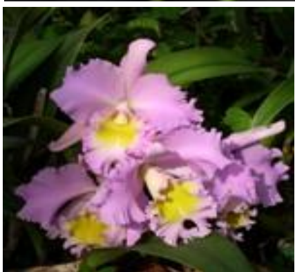
Bc Mount Anderson 'Louvre' AM/AOS

Armacost, 1984, Trick or Treat hybrid, orange flares on segments with silver/pink, large heads of blooms on tall spikes. I honestly think this clone is better than the 88 point AM clone called 'Maria Irma'. If you put in Spring shows, this will knock your socks off! 4 bulb bare root division.