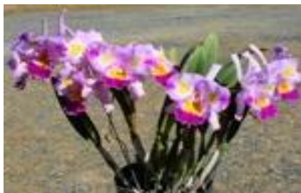
Lc. Platinum Sun 'O-1' AM/AOS

Bred by Lenette (C. bicolor x L. crispata), a darling novelty cross that looks like a miniature lemon-lime bicolor, too cute! The color just glows. Clusters of elegant blooms on tall stems way above the foliage. I have one tray of mericlones of a selected clone that I have been waiting for one to bloom before offering them., and now one is, see the photo. Dug-ups from tray, near blooming size.