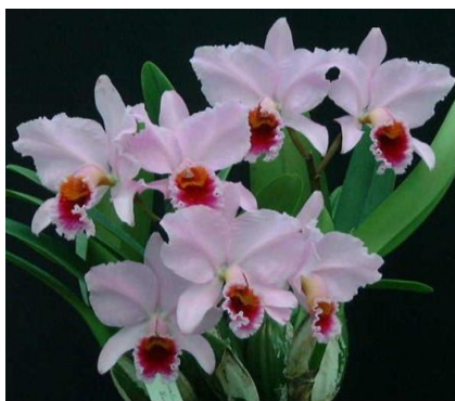
C. percivaliana 'Summit' FCC/AOS

Lenette's stud plant, awardable, gorgeous art-shade orange, first division of this to be released, 4 bulb division