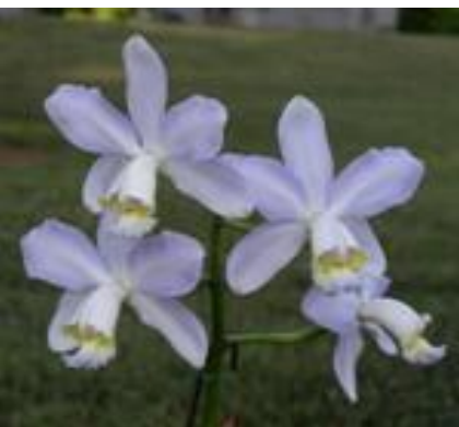
C. Ioddigesii 'Dixie Land Blues' AM/AOS

Similar to 'Carina' but plant is shorter, 5" pot.