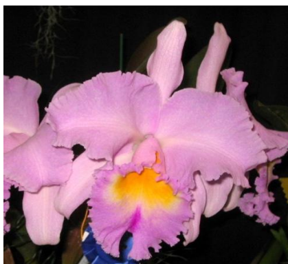
Blc. Pamela Hetherington 'Coronation' FCC/AOS

$50 in 6" pot Stewarts, in 6" or 7" pot $60 in 7" pot