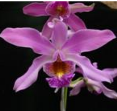
Schomburgkia sawyeri (first picture shows flower, second picture shows plant)

Field's breeding, 1951, awarded in 1957. A true classic semi-alba that stands up to the test of time. Great stems carry up to 4 blooms without staking. Vigorous grower making several leads per year once it gets going. Blooms February to March. Rarely seen in collections. One 4 bulb and one 5 bulb division with 2 leads.