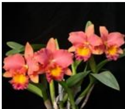
Pot. Goldernell 'Southern Cross' AM/AOS