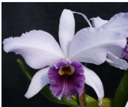
Lc. Egerland 'Blushape' AM/AOS