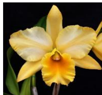
Blc. Kure Beach 'Lenette #2' FCC/AOS

Jones & Scully, 4 bulb bare root division.