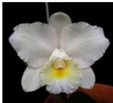
C. Dubiosa 'Perfection' AM/AOS