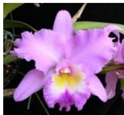
Bc. Deecasso 'Pink Perfection'

Very recent FCC award in Tennessee. Just checked clean for virus. Sometimes blooms with the flares as in my photo, but can be concolor yellow as well. Excellent stud parent and blooms more than one time per year, 4 bulb bare root division.