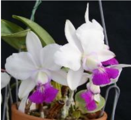
C. walkeriana semi-alba 'Tokyo #1' AM/AOS

From the selfing of the 4N plant of 'Mendenhall-Summit', has better shape than either parent, 5" pot with 10 growths or 5" pot with 7 growths