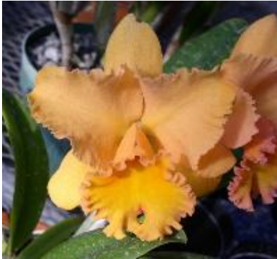
Pot. William Farrell 'Apricot Orange'

Stewarts, this is one parent of Pot. William Farrell and Coastal Sunrise, 5 bulb, bare root division