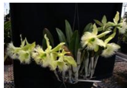
B. digbyana 'B-52'

Stewarts, beautiful, fragrant pink, 4 bulb bare root division.