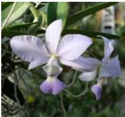
C. walkeriana coerulea 'Monte Azul' AM/AOS, JC/AOS

From Suwada in Japan, 5.5" pot, 6 bulbs with leaves, 2 leafless that bloomed