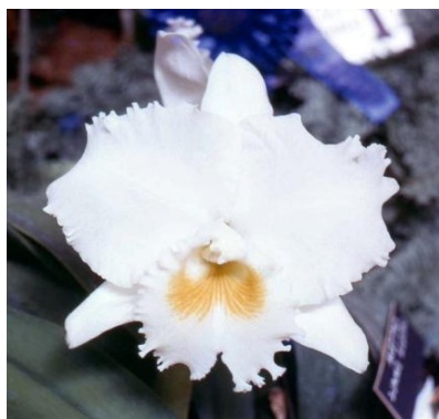
C. Lucille Small 'Marshall' FCC/AOS

Jones & Scully, compact walkeriana type hybrid, very fragrant, in 5" or 6" pot