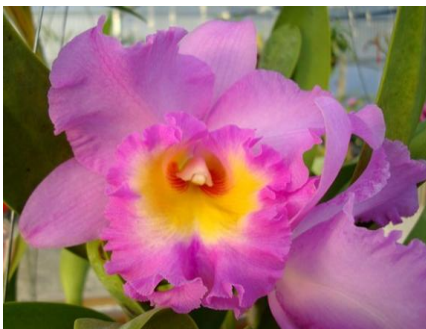
Blc. Mahina Yahiro 'Uii' AM/AOS

From Taylor Orchids, division of original awarded plant from Ron Ciesinski, owner. One of the finest examples of the dark variety of the species. MUCH more vigorous than the 'Rainforest' clone. 4" pot, established, new growth with sheath.