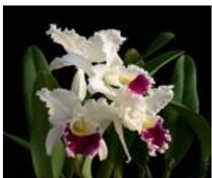
Blc. Distant Shores 'New Worlds'

This clone is out of Australia, but was awarded in the US. Gorgeous art-shade well displayed on strong stems. 6" pot established.