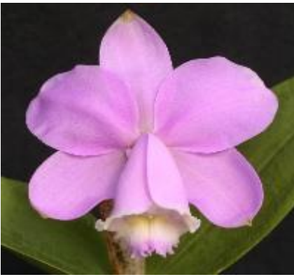
C. Ioddigesii 'Tony Bos'