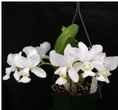
C. Angelwalker 'Easter' AM/AOS