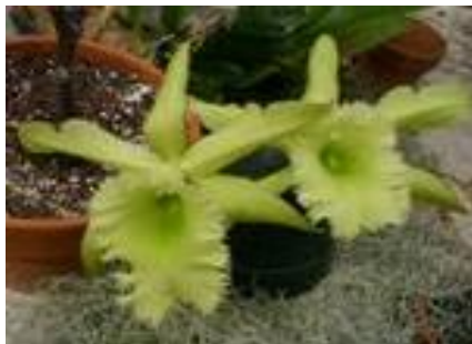
Blc. Rio's Green Magic

Stewarts, nice example of the two species combined (B. glauca X B. digbyana). 4 bulb or better divisions.