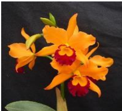
Pot. Carolina Golden Nugget '#1'

This came to me from Gold Country as a small unbloomed seedling. It was one of only a few plants that survived my greenhouse burn up in 2002 and was the first survivor that bloomed for me afterwards. Blooms were so good that it seemed to welcome me back (thus the name) to orchids again after nearly giving up. I feel it can be awarded on a good blooming, best color of any walkeriana I own, even better than 'The Chairman'. 7 bulb bare root division with two leads, great roots.