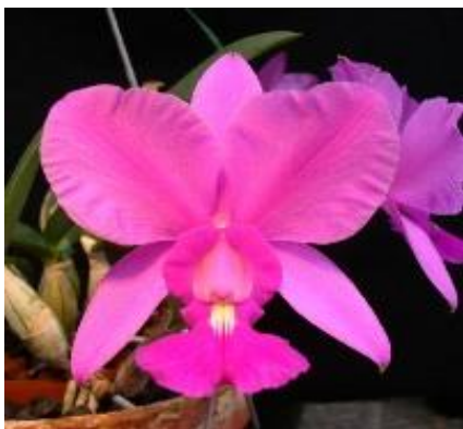
C. walkeriana 'Welcome Back'