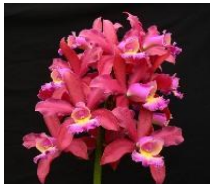
C. Hybrida 'Hackneau' AM/AOS

(C. Mini Purple x C. intermedia), coerulea forms were used here. Light blue segments and darker blue lip, heavy substance. 4 bulb front lead division, bare root.