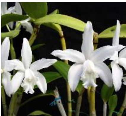
C. intermedia alba 'Virgin Snow' (Virgin Snow on right)