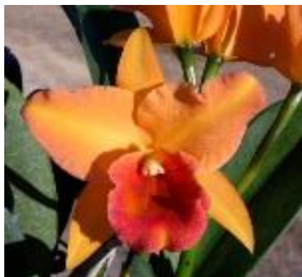
Blc. Carolina Golden D'Or 'Spring Time'