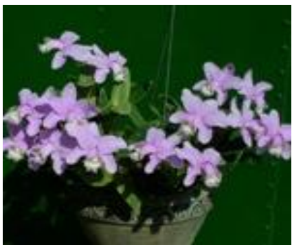
C. loddigesii 'Shorty'

4N mutation of 'Breckinridge Snow' mericlone, see photo for comparison of 2N 'Breckinridge Snow' on left and 4N 'Virgin Snow' on right, exactly like 'Breckinridge Snow' but significantly larger in every dimension. 4 bulb bare root division, first time ever offered.