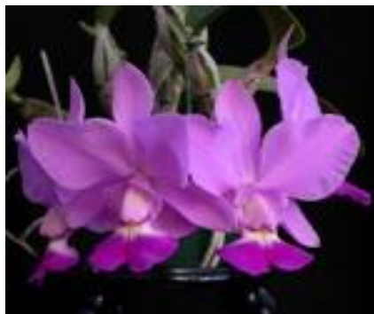
C. walkeriana 'The Chairman' AM/AOS

Gold Country, from original awarded plant. I waited for many years to get a division of this. This clone requires very good light to bloom well. 5" pot with 5 bulbs with leaves plus new growth.