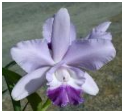
Lc. Cariad's Mini-Quinee 'Blue Reflections'

Hawaiian breeding, large impressive pink with very ruffled lip. Established in 6" pot.