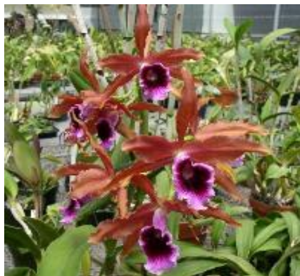
L. tenebrosa 'Taylor Bronze' AM/AOS, CCM/AOS