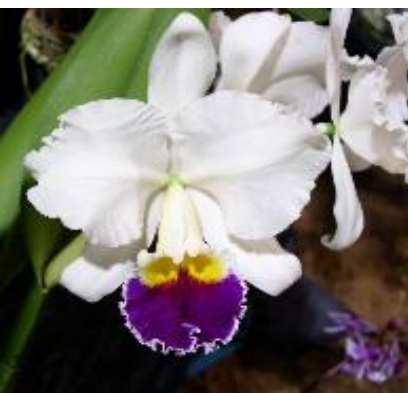
Lc. Lew Sykora 'Ceylon Ivory' AM/AOS