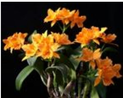
Blc. Carolina Golden D'Or 'Lenette #2' AM/AOS, CCE/AOS