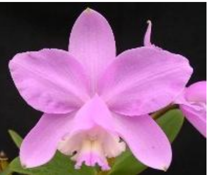
C. Ioddigesii 'April's Pride'

Jones & Scully, 4 or 5 bulb bare root divisions