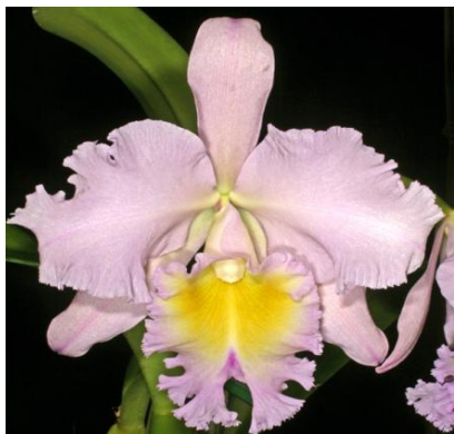
Blc. Nacouchee 'Mission Valley' AM/AOS