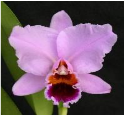
C. percivaliana 'Gene Crocker'