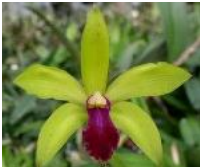
Lc. Lemon-Lime 'Lenette'