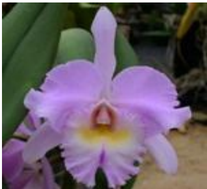
Blc. Nosegay 'Jo-Jo'

$50 in 6" pot Stewarts, in 6" or 7" pot $60 in 7" pot