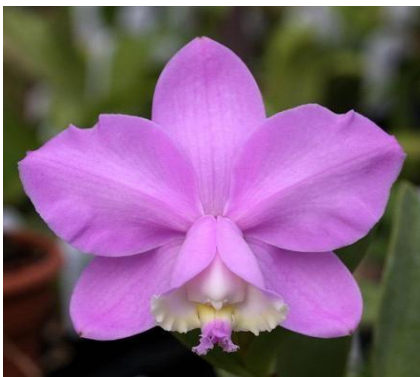
C. Ioddigesii 'Aranda' AM/AOS

This was April's (my daughter) favorite that we bloomed from a seedling batch of 'Shorty' X 'Sweetheart'. It is very flat and blooms are large for the species. Somebody will get this awarded. Two established plants in 5" pots.