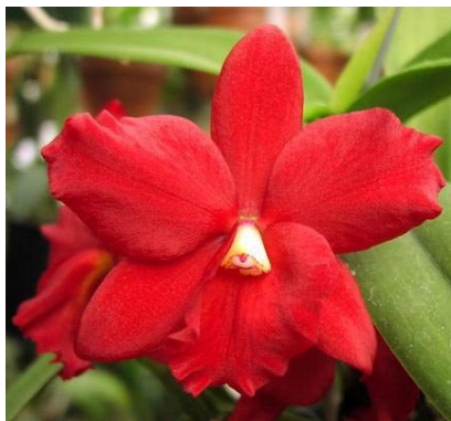
Slc. Dixie Jewels 'Suzuki' FCC/AOS