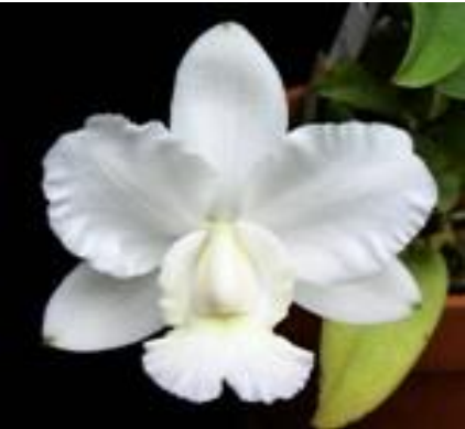
C. walkeriana alba 'Sierra Storm' AM/AOS

Awarded plant from Ervin Granier, 4 or 5 bulb bare root divisions from my large plant