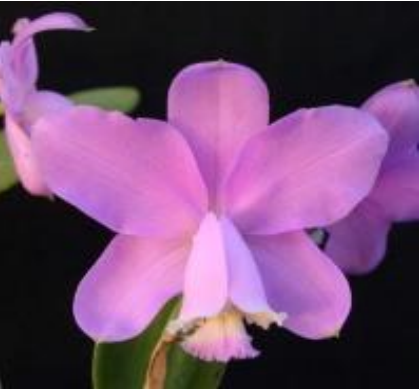
C. Ioddigesii 'Carina' AM/AOS (89 points)

Jones & Scully, named for a long-time employee at J&S (pictured on p.3 of their 1987 catalog), similar to 'Carina', but to me is better. 5" pot.