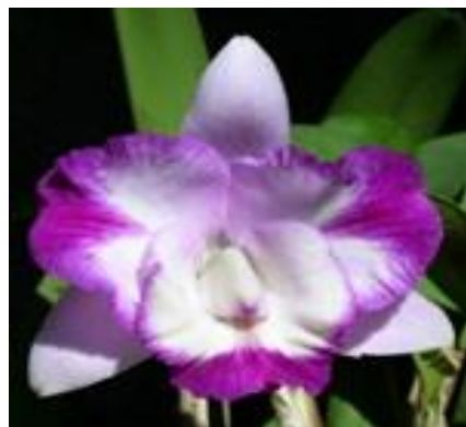
Lc. Tropic Charm 'Social Flare'