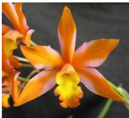
Lc. Magic Bell 'New Trick' HCC/AOS

Stewarts, nice semialba, 4 bulb bare root division.