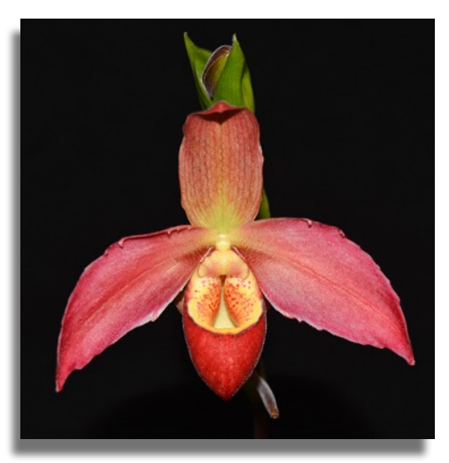
Phragmipedium Sunset Glow Grower: Bob Lucas