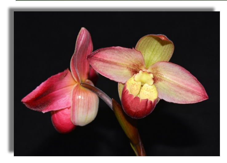
Phragmipedium Pink Fire Grower: Pat Randall