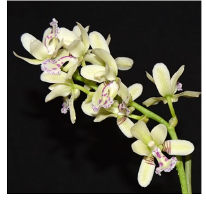
Phalaenopsis japonica (previously classified as Sedirea japonica) Grower: Lynn Campbell