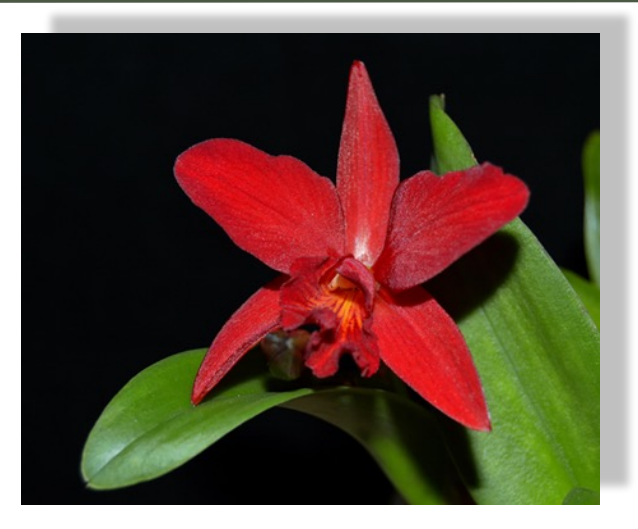
Sophrolaeliocattleya (Slc) Little Hazel 'M' Grower: Merle Ward