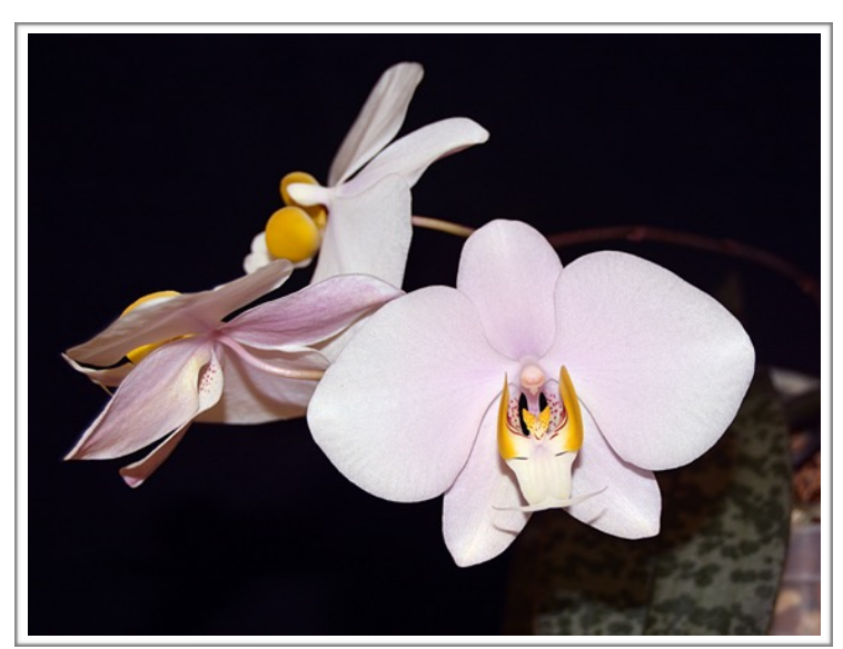
Phalaenopsis philippinensis Grower: Merle Ward