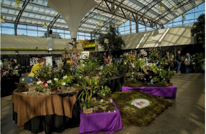
Orchid Species Preservation Foundation Display at the OSA Orchid Fair 2016

include a to the meetings during the year. The draw for Show and