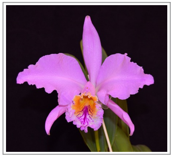
Cattleya mossiae Grower: Pat Randall