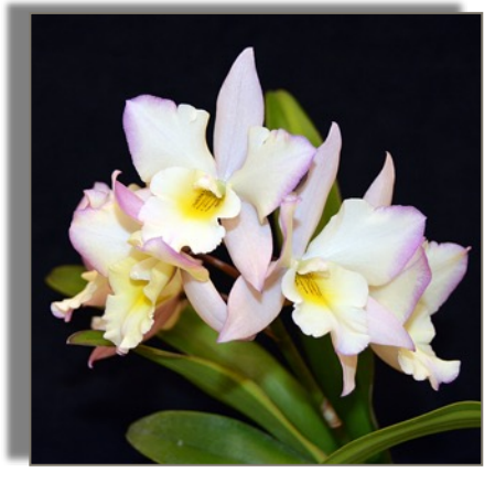
Jackfowlieara Appleblossom Grower: Pat Randall