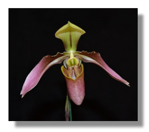
Paphiopedilum hainanense Grower: Pat Randall