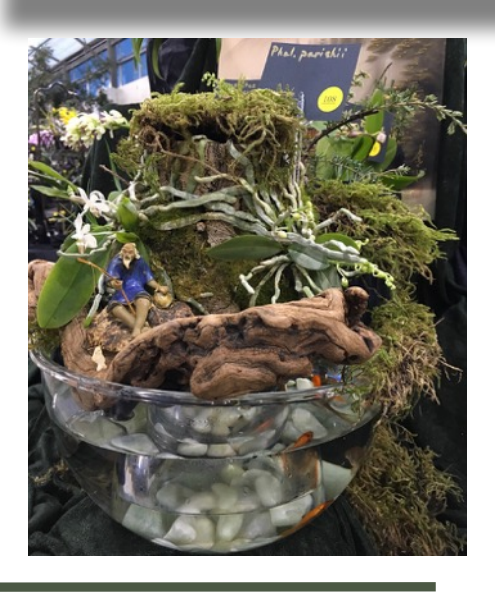
Bulbophyllum falcatum grown by OSPF Show Grand Champion Winner