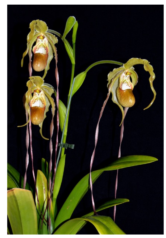
Phragmipedium Grande Grower: Bob Lucas