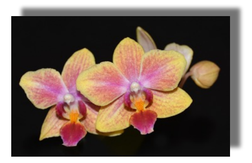
Phalaenopsis Sogo Gotris Grower: Pat Randall