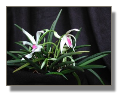
Lepototes bicolor

Draw will be made for contributors to the coffee break snacks this year. Your name will be entered for very month you brought snacks; you must be in attendance to receive the flowering