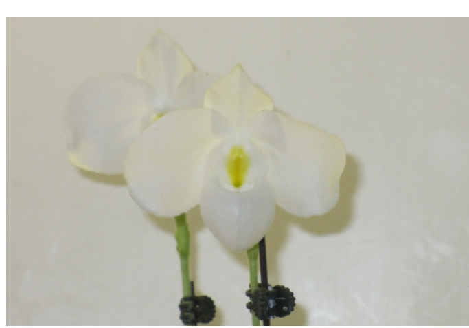
Paph. delenatii var album, Awarded AM/AOS 82 Points