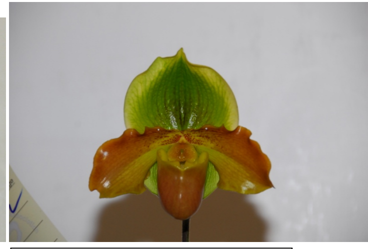
Paph. Pinolime 'Miao Hua' Awarded FCC/AOS 90 Points