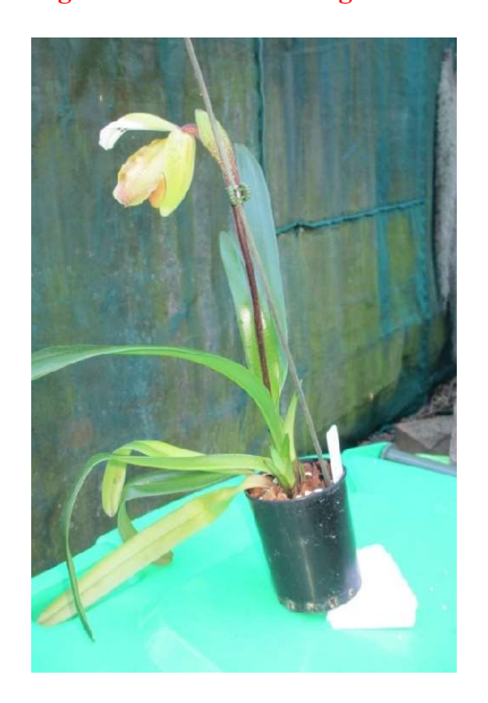
Illustration by Editor. Take good care it does not topple over, especially on gusty windy days if you are not growing in an enclosed housing!!!