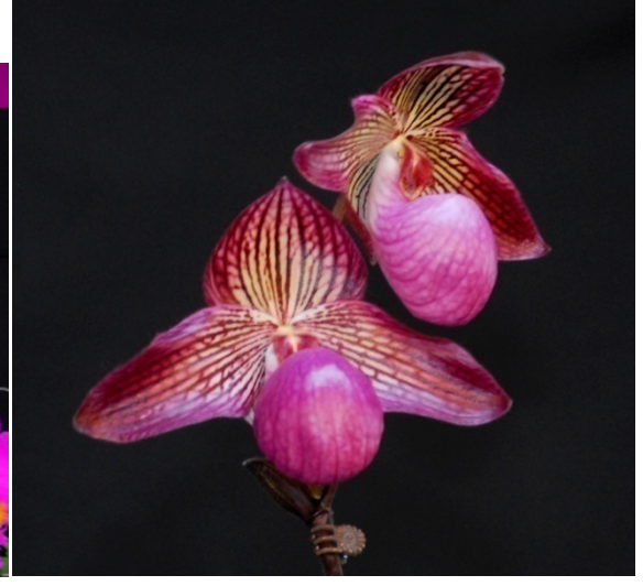
Paph. Gloria Naugle 'Tristar' Grand Champion of Show, Awarded FCC/AOS 94 Points