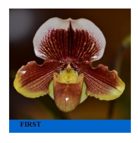
CLASS 14. Sequential Hybrids