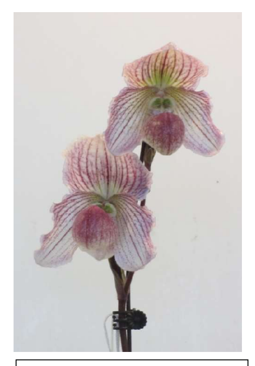
Paph Angela 'Angel' Awarded AM/AOS 82 Points