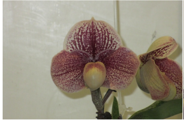
Paph Elim Attraction