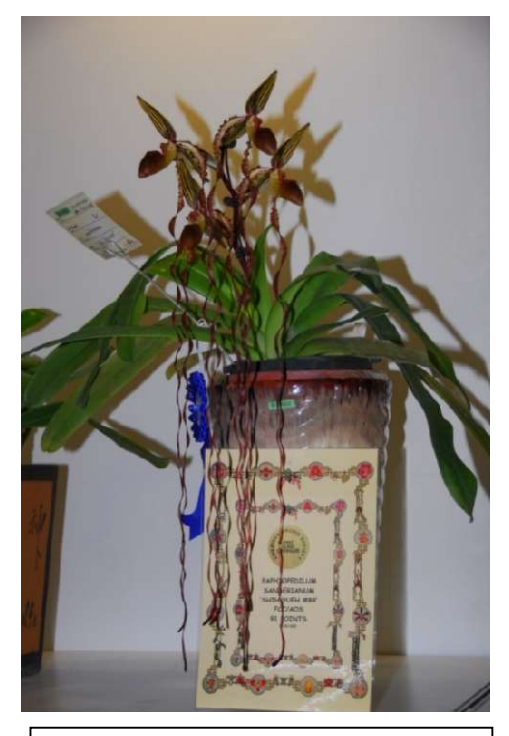
Paph. sanderianum 'Shih Yueh #88' Awarded FCC/AOC 91 Points