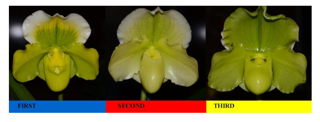
CLASS 12. Complex Hybrids Other Colour