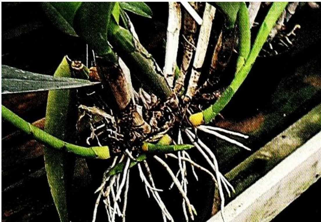
FIGURE 4. Failing to repot when necessary resulted in this tangled mess of new growths and roots.

It is too late to pot the plant in FIGURE 3! This is another spring-flowering hybrid and was photographed about a month after the flower had been cut. Note that the roots are almost fully made up and new growth is beginning to break. We like to wait for the new growth to make up at least half-way before potting as it is all too easy to break off a young growth while tamping in the mix. While breaking a new growth is certainly not fatal, it is still a set-back to be avoided where possible.