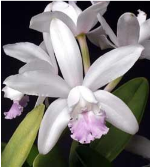
C. intermedia 'Aranbeem', AM/AOS; Grower: RF Orchids, photo: Greg Allikas

Cattleya granulosa : Brazil. Discovered in 1840 by Hartweg who sent a single plant of it to the Horticultural Society of London, its habitat was reported as Guatemala. Subsequently Mr. Skinner sent specimens reputedly from Guatemala. Nevertheless, it is extremely doubtful that such plants actually were found wild in Guatemala and it is possible that either the plants were found in cultivation or the actual source was deliberately concealed to prevent other commercial collectors from locating it (a practice not infrequently indulged in, although condemned by those who respected the search for scientific knowledge). The species was described by Lindley in the BOTANICAL REGISTER FOR 1842. The jointed, somewhat flattened stems are from twelve to twenty inches tall, bearing two leaves six inches long. The flower stem is stout, erect, with from five to eight flowers, each about three to four inches across. The sepals and petals are yellowish olive-green, with scattered spots of red, the sepals oblong and obtuse, the lateral sepals bowed inward. The petals are a little broader than the sepals, with the margin slightly waved. The lip is three-lobed, the lateral lobes erect, whitish outside and yellow inside, the middle lobe clawed with a fimbriate kidney-shaped blade, the claw yellow, the blade white, covered with numerous crimson-purple granulations. Of intermediate culture, it flowers in the late summer and autumn.