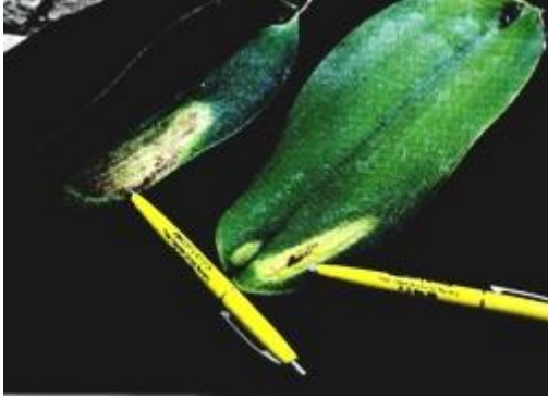
FIGURE 2. Heat build-up from too much light caused the yellow patches on these cattleya leaves.

Helpful, too, is an understanding of the preferred habitats of Cattleya species. The majority of horticulturally important species grow as epiphytes in the middle elevations of the subtropic. Epiphytism is generally thought to have evolved partially to enable the plants to obtain sufficient light in the often dimly lit forest by getting them up into the more brightly lit canopy. Most epiphytes, cattleyas included, do not grow where they will be exposed to full sun for long. Inner branches, or those under the uppermost canopy of foliage, are the preferred locations. In such areas, while the plant may be temporarily exposed to full sun, it receives bright, dappled light but remains protected from too much sun. If a plant is exposed to the full sun by loss of its foliar protection, its own foliage will burn, as would happen in your greenhouse.