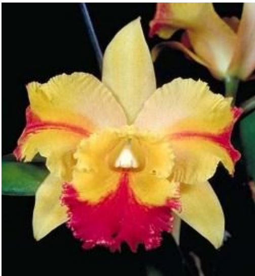
R/c. Horizon Flight 'Fancy Free', AM/AOS; Grower: Armacost & Royston