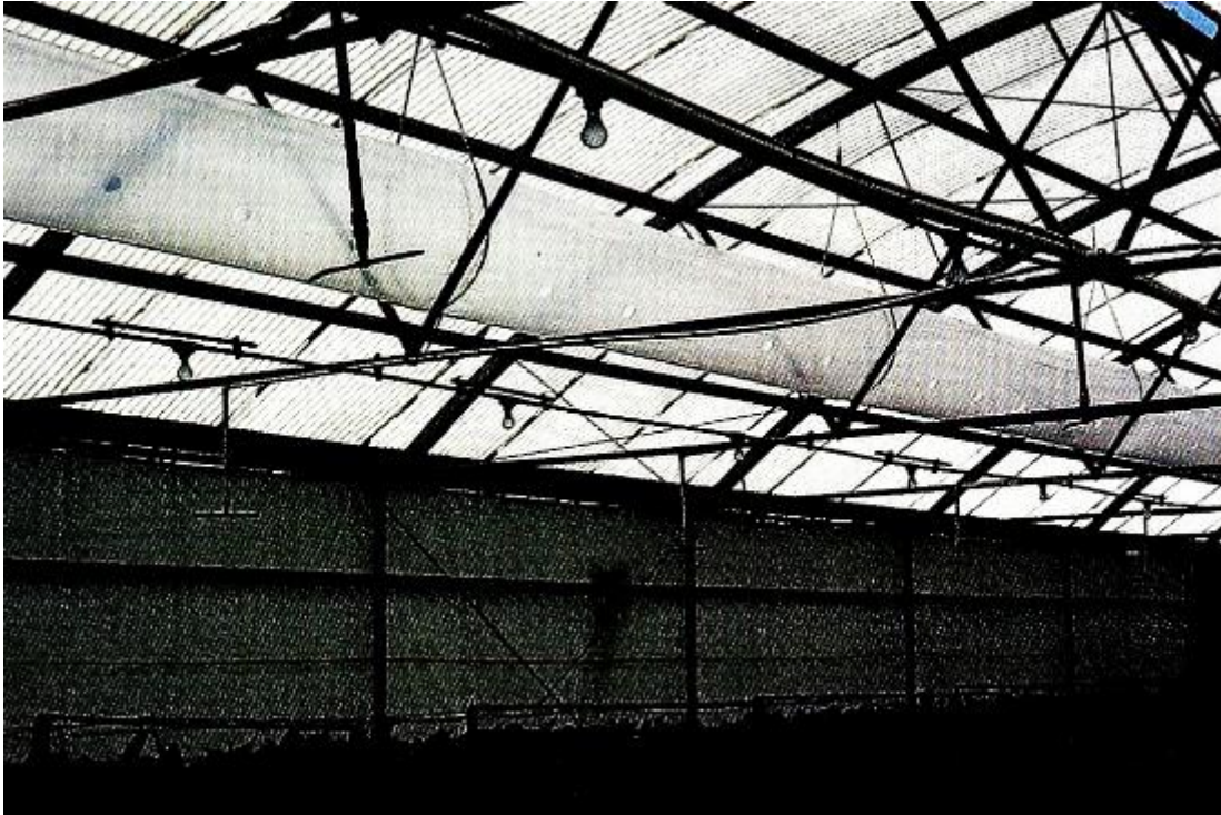
FIGURE 7. Enhanced air movement, provided here by perforated plastic tube attached to a high-speed fan, maintains even temperatures throughout the growing area while it cools the plants.

There are, of course, situations where it will be impractical, or indeed harmful, to maintain optimum temperatures. Many of the southeastern states may have periods during summer months where the night temperature doesn't drop below 70F. Because these periods are usually accompanied by very high humidity, evaporative coolers are ineffective. Air conditioning is impractical owing to energy costs. Fortunately, these periods are unusually not prolonged and most cattleyas will remain unaffected.