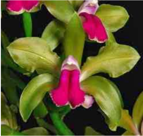
C. bicolor 'Tyrone', HCC/AOS; Grower: Charles Fouquette

Cattleya bicolor : Brazil. Introduced by Messrs. Loddiges in 1836, it was described in the BOTANICAL REGISTER by Lindley in 1836. The slender stems are from eighteen to thirty inches high, jointed and covered with whitish membranaceous sheaths, bearing two leaves about six inches long. The inflorescence is nearly erect, with two to five or more flowers. Flowers range from three to four inches across. The sepals and petals are fleshy, with a distinct midnerve, greenish brown to olive-brown spotted with purple, the petals somewhat wavy, the lateral sepals bowed inward. The lip is wedge-shaped, without side lobes, curved downward with a central longitudinal depression or line, crimson-purple, occasionally margined with white. This species is unique in lacking the lateral lobes of the lip, a character usually inherited by its hybrid progeny, limiting its value in breeding. Variable in coloring, particularly with respect to the lip, this species is suited to intermediate conditions, blooms during spring and into midsummer, occasionally blooming twice, about March and again in September.