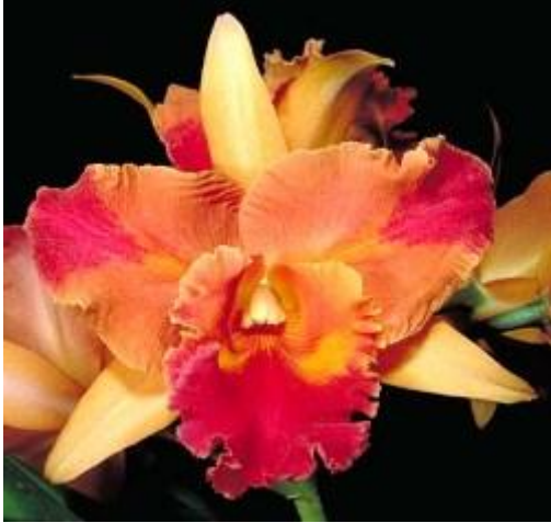
R/c. Horizon Flight 'Fiery Rainbow', HCC/AOS; Grower: Stewart Orchids

This "ideal greenhouse" is best suited for mild climates. In warmer areas, a simple shade house of saran or lath is often preferred. Glass or fiberglass may be necessary to protect the plants and flowers from the elements. In cold areas, the house can be lower and the glass need only extend to bench level. This will help to conserve heat by reducing radiating glass area. Many other measures can be taken in cold areas to reduce heat loss. These include caulking seams, double-glazing, berming, and passive heat-storage methods.