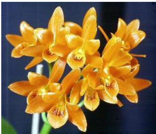
Guarianthe (Cattleya) aurantiaca 'Laura Palmieri', AM/AOS; Grower: Mario & Silvia Palmieri

distinguishes this species, for the flowers are not produced from the apex of the pseudobulb as in other Cattleyas but arise on separate short, slender shoots which spring directly from the rhizome at the base of the leaf-bearing growth (see footnote). This character is found only in this species and in Cattleya nobilior . The spindle-shaped pseudobulbs are up to five inches long, bearing two (occasionally one) leaves from three to five inches long. Inflorescence arises from a separate slender shoot springing from the rhizome at the base of the foliar shoot, one- to two-flowered. Flowers are large for the plant, to four and one-half inches across, ranging in color from bright rose-purple to pale pink-lilac. Sepals are pointed, petals more oval, twice as broad as the sepals. Lip is bly trilobed; the side lobes more or less erect on both sides of the column, their front edges turned outward; the middle lobe spreading, kidney-shaped with waved margin, a broad band of amethyst-purple surrounding the white or pale yellow disk which is streaked with purple This beautiful and distinctive species is slowly regaining popularity, for it has been found to be more common in Brazil than previously supposed. The flowers are long lasting and hold their shape for two or more weeks without wilting. It is widely cultivated in Minas Gerais, Brazil, where it blooms profusely. The blooming season varies, from fall to spring.