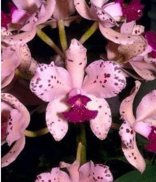
C. amethystoglossa 'Crownfox III', AM/AOS; Grower: RF Orchids

margins, a deep amethyst–purple. Found growing near sea level on small isolated trees in the arid lands near the coast of the province of Bahia, over which a sea breeze blows constantly, it is a warm growing species demanding great light. It requires little compost but should be heavily watered during its growing season. Frequently it produces new growths and flowers twice a year, in May and June, its normal season, and again in the fall. Not common in cultivation, it is a delightful dwarf species with bold flowers, but it does have a reputation as being difficult to grow.