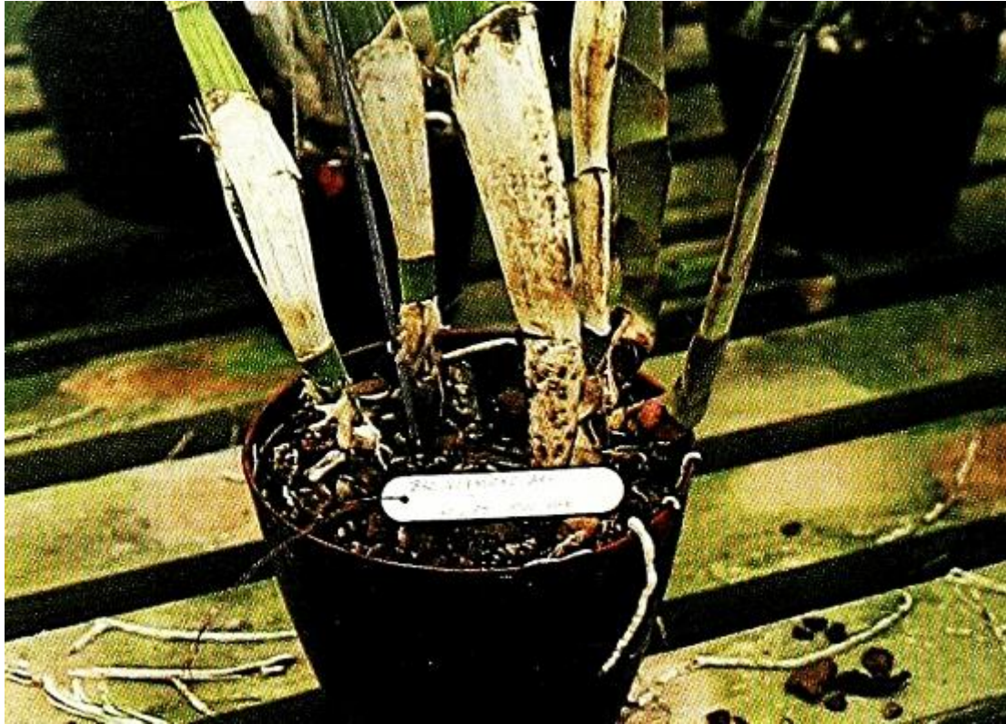
FIGURE 11. The elevated position of these new growths is a sign of an incipient "stairstep" growth habit.

There are still many clones in cultivation that have some or all of the above-mentioned drawbacks but are grown either because of their intrinsic antique value, or because they are good parents. The Rhyncholaeliocattleya ( Brassolaeliocattleya ) Norman's Bay line is a good example of this type. FIGURE 11 shows the beginnings of the worst trait of this line; the extreme, stairstep growth habit. The lead bulb (on the right) has initiated two new growths, an excellent habit, but the lower new growth is approximately 1 1/2 inches above the surface of the mix and the upper is approximately 2 1/2 inches above. Difficult to pot at best! Note here, as well as FIGURE 12, that there is one to two inches between pseudobulbs. Plants with this habit leap out of their pots very quickly!