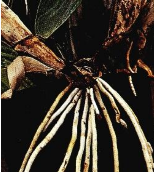
FIGURE 3. Now is not the time to repot this plant, as the roots of its newest growth are fully developed

It is too late to pot the plant in FIGURE 3! This is another spring-flowering hybrid and was photographed about a month after the flower had been cut. Note that the roots are almost fully made up and new growth is beginning to break. We like to wait for the new growth to make up at least half-way before potting as it is all too easy to break off a young growth while tamping in the mix. While breaking a new growth is certainly not fatal, it is still a set-back to be avoided where possible.