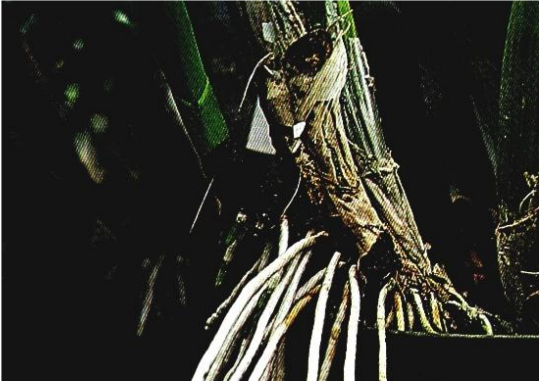
FIGURE 1. Newly emerging roots indicated that now is the time to repot this overgrown cattleya.

Knowing the species background of hybrids is important, especially in those hybrids relatively close to species (primary or secondary hybrids) or which have a great deal of certain species in their background. For instance, yellows can be more demanding than whites or lavenders as there is usually quite a bit of Cattleya dowiana represented in their breeding. For this reason, extra care must be utilized with most yellow hybrids to pot only when there is evidence of root activity, preferably in the spring or early summer. This also holds true for bifoliate-type greens as they are heavily influenced by Cattleya guttata and/or C. bicolor . It should be stressed that these are examples but are not the only two things one need look for. If you have noticed that a certain plant or plants exhibit(s) a failure to establish well after potting, close observation can often lead to a better understanding of why the plant(s) may be acting that way.