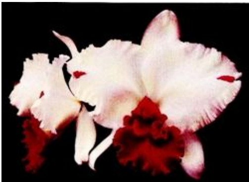
C. Starting Point 'Blaze'; Grower: Armacost & Royston, Photographer: John Royston

When we evaluate a plant's growth habit, whether dwarf or standard, we look for several things. A relatively compact and freely branching habit is essential. Pseudobulbs and rhizome should be in proportion to the general size category of the hybrid. A 2-inch pseudobulb size is no good at all if the rhizome measures 2 inches between pseudobulbs and doesn't branch. We also look for plants that are easy to grow. If we find that a particular hybrid grex or clone is "twitchy" about when it is potted, or otherwise, we are very leery about using it/them for further breeding. Of course, a fabulous flower does tend to interfere with one's better judgment. In cases such as this, we mate the difficult grower with one we know from experience is dominant for "growability". Lastly, does the plant flower easily from every pseudobulb, or is it a hit-or-miss bloomer? Productivity is obviously an important factor, as the world's best cattleya is no good if it won't flower.