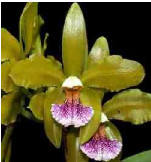
C. granulosa 'Claire', HCC/AOS; Grower: William Rogerson

Cattleya gaskelliana : Venezuela. Introduced into England in the spring of 1883, by Sanders, it was named for Mr. Holbrook Gaskell of Woolton. It is intermediate in character between C. mossiae and C. lueddemanniana . Flowers large, six to seven inches, the color varying from medium amethyst purple to pure white. The lip is fairly large, the tube the same color as the petals and sepals, the lobe deep violet with pale border, the throat streaked with yellow and yellowish white. The flowers are usually soft but some fine varieties have been named. Blooms from mid-June to early September, growth beginning in early spring and flowering following without interruption. A nice variety for the hobbyist, still grown commonly, even occasionally as a commercial cut flower.