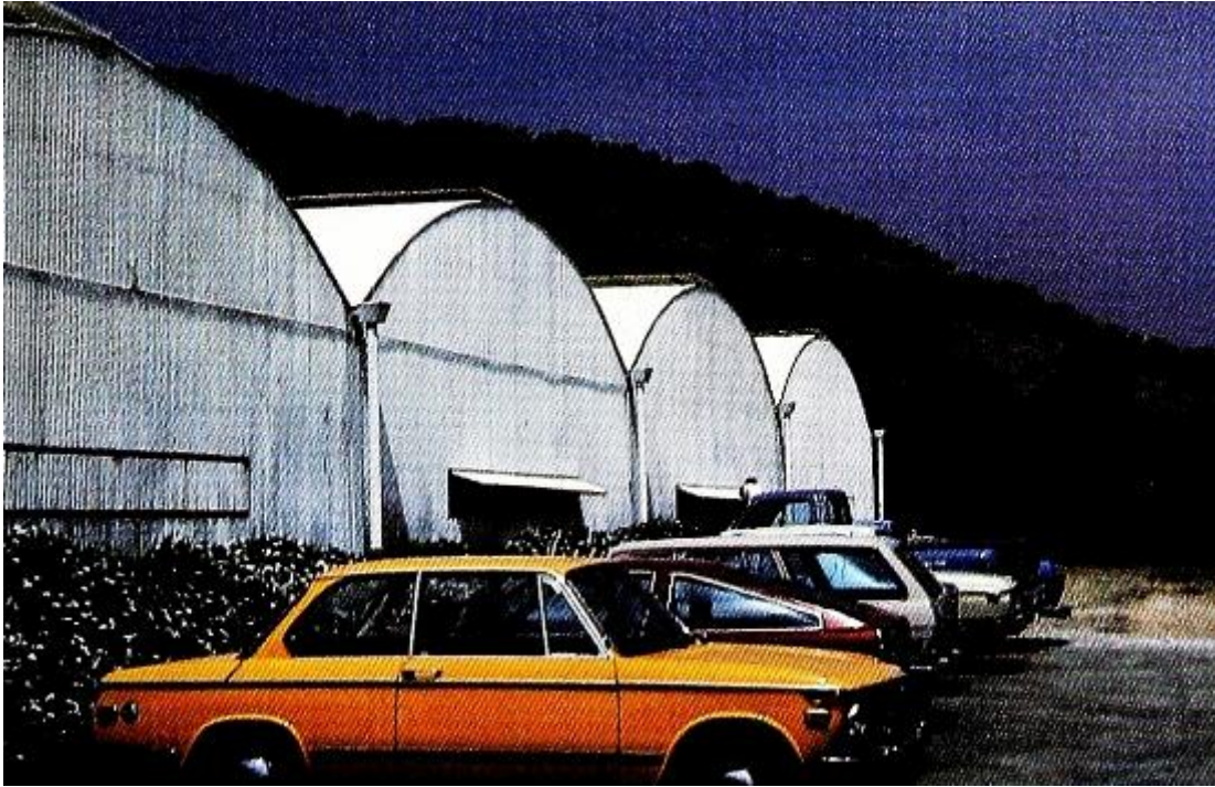
FIGURE 8. Bottom and top vents on these greenhouses create a constant air exchange with the outdoors, keeping conditions fresh and fairly cool inside.

While fresh air and good circulation are obviously vital, do not go overboard. Provide just enough movement to eliminate stagnant conditions. This helps to keep down fungal problems. When our new greenhouses were constructed, we purposely had them built with a relatively high (twenty-foot) ridge. This increased volume helps to keep temperatures moderated and we need only open our ridge vents slightly to create a very nice air exchange. We have recently added bottom vents along the south face of our range. These are an excellent way of cooling a greenhouse. The cooler air enters at bench level and rises, as it warms, to exit through the ridge vents. By using these passive cooling methods, we very seldom need to use our fanjet blowers for cooling, except under very extreme conditions (FIGURES 7 and 8).