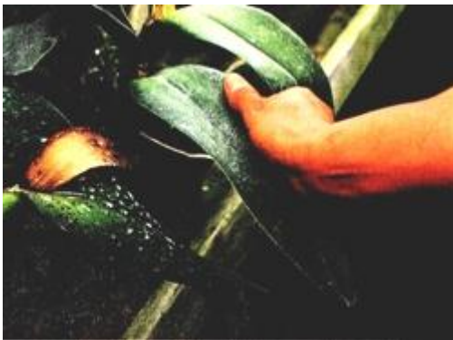
FIGURE 5. By feeling a leaf, the grower can determine whether the threat of light-damage exists under present conditions.

If you use a paint-on shading compound on your greenhouse, it is imperative that dirt and dust be washed off (by a rain or with a hose) before the compound is applied. If the paint is applied over a dirty surface, it will quickly turn dark. Not only will the light quality be poor, but the dark color will draw heat into the house. Hot, shady conditions are a serious problem for cattleyas. Many growers make the mistake of laying shade-cloth or saran directly on the roof of their greenhouse, or placing it inside directly under the glass. While the light quality will be good, the dark shade cloth will draw heat into the greenhouse. Shade cloth should be suspended 8-18" above the glass on a frame (see FIGURE 4). This traps a layer of cooler air next to the glass, helping to keep temperatures down.