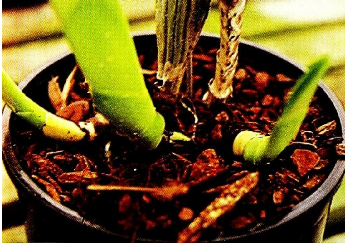
FIGURE 7. New leads whose bases are level with the mix will root firmly soon after repotting.

This division in FIGURE 7 had been potted (correctly) approximately one month before this photo was taken. The new leads emerged at the mix surface and are now beginning to orient themselves upright as they grow. Beginning root activity can be seen at the base of the new growths. Some temporary shrivelling of the older bulbs is normal but they will plump up quickly as new roots form.