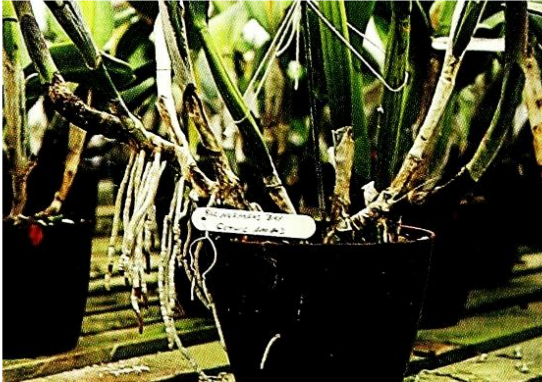
FIGURE 12. Two years after repotting, the extreme stairstep growth habit of this Cattleya hybrid has produced this unwieldy plant.

FIGURE 12 shows the stairstep effect in a more advanced stage. This plant was potted two years ago. There are already four bulbs on one rhizome which are over the pot edge. This obviously renders the plant difficult to keep upright, to bring into the home to enjoy or to keep out of its neighbors' pots! When purchasing plants, look for this behaviour and avoid it where possible. Unless, of course, you just can't resist the flower!