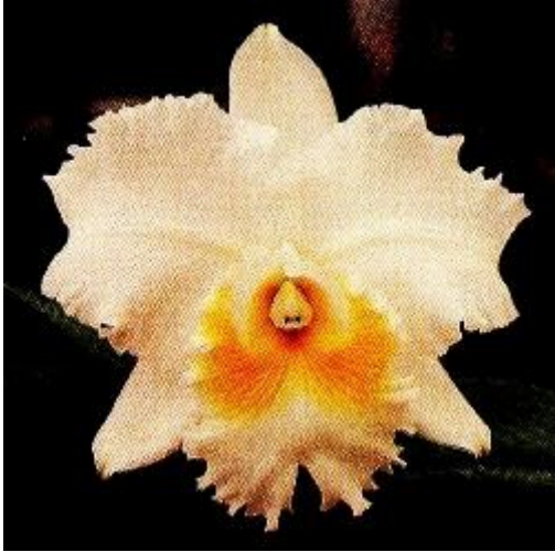
C. Peters Creek 'Superb' ; Grower: Armacost & Royston

Again, we see that proper observational habits and (un)common sense are the answers to many of the flowering "problems" that might arise. Well, how do we avoid the other type of flowering problems? The poor, weakly colored, shapeless blooms? The blooms that won't appear? The flowers that are crippled and streaked two bloomings out of three? The flowers that only appear on enormous plants not justified by the flower quality? The flowers that last only a few days before folding?