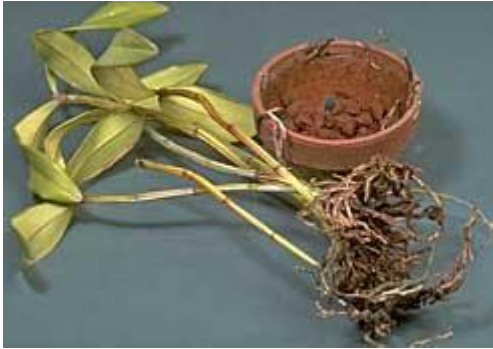
Too little water has dehydrated this plant.

Watering – Improper watering, both under- and over-, leads to the death of more orchids, including Cattleyas, than any other single cause. There are two aspects of proper watering to consider: when and how. Simply summarized, cattleyas should be watered only after the potting medium has become “dry.” Frequency of watering will vary. Once a week is a good base to begin, remembering that some factors will speed up drying of the potting medium, others will slow it down. A lot of sunshine, heat, good air movement, active growth, a large plant in a small pot, low humidity, the type of potting medium (such as bark, gravel, tree fern chunks, etc.), windy weather and the like all contribute to faster drying and, consequently, increased frequency of water. Conversely, high humidity, dark, cold, cloudy or rainy weather, large pots, inactive plants (that is, not in active growth), tightly packed potting medium, little air movement and similar circumstances will slow the process of drying and hence decrease the frequency of watering. Note that some of these factors affect the entire collection of plants, other affect only certain individual plants. Watch each plant carefully, consider each by itself. Each beginner must learn for themselves, but remember that plants will recover much more rapidly from under-watering and it is best to err on the dry side, following the rule, when in doubt, don't water.