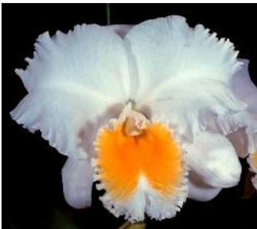
C. Ruth Gee 'Goldkist' , AM/AOS; Grower: Armacost & Royston

At the outset, it needs to be understood that a bad orchid requires just as much time, effort and money to grow as a good one. This has two important ramifications. First, with energy at such a premium today, you simply cannot afford to grow plants that do not perform satisfactorily. Second, your time is worth something. Why waste it growing an inferior clone when you can grow a superior one just as easily? After all, you have spent time reading this series to learn how to grow your plants better. It only makes sense to study hybrid lines and growth habits so that your purchases may be more intelligently and, hopefully, successfully planned.