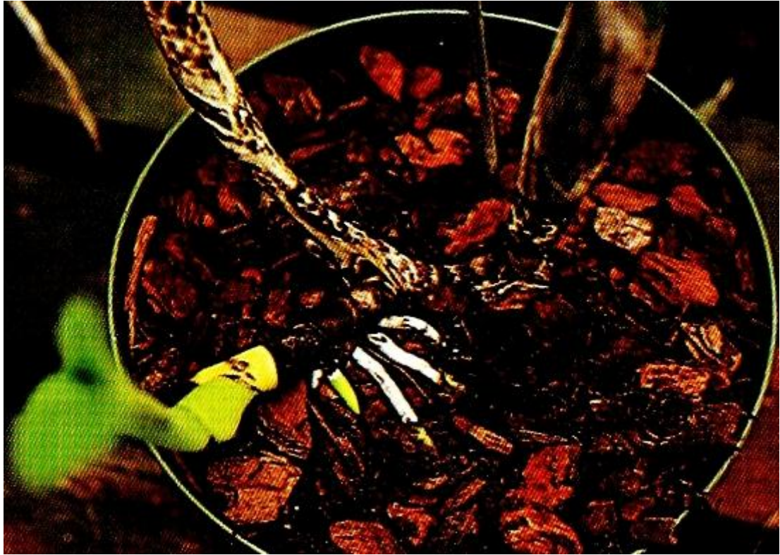
FIGURE 8. Little more than a month after repotting, the roots of this new growth have penetrated the potting mix.