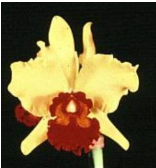
C. Amber Glow 'Magnificent', AM/AOS; Grower: Kensington Orchids

Before discussing the aspects of what to look for in a cattleya flower and the plant that produces it, some hints on how best to flower cattleyas are in order. First and foremost, one needs to grow the plant to its maximum potential. Obviously, a less-than-well-grown plant cannot produce flowers that demonstrate full potential. The first four articles of this series should help you to grow better plants.