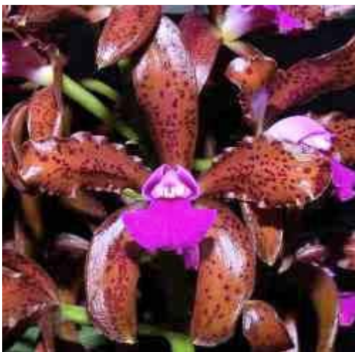
C. tigrina 'SanBar Giant', FCC/AOS; Grower: SBOE