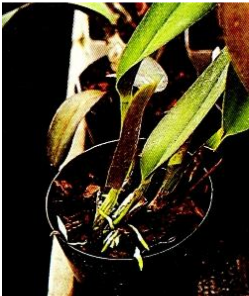
FIGURE 9. Recently repotted, this Cattleya seedling is beginning to take root.

Above, the potting medium has been cleared away from around the base of this four-to-six-week-old division in FIGURE 8 to illustrate how the new roots quickly penetrate the medium. Although most cattleyas root when their pseudobulbs are at least half-mature (and often also immediately after flowering), root loss through potting can encourage rooting, as is the case here.