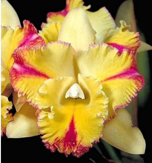
R/c. Horizon Flight 'Happy Landing', JC/AOS; Grower: Fordyce Orchids

Benching is heavy-wire mesh or wood slatting and is designed to allow easy access to all corners. (If you can't reach it, you won't take care of it!) Gravel or crushed rock covers the floors, helping to conserve both humidity and heat as well as keeping shoes from getting muddy. Ventilation is best provided by a ridge vent, and by bottom vents in addition, if at all possible.