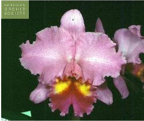
C. Susan Holguin 'Bewitched', HCC/AOS; Grower: Armacost & Royston, Photographer: Richard Clark

parts enhances the round form. Traditionally, large size was thought to also add to a round, full conformation. Judges have had to learn to modify this view with the exhibition of such clones as Cattleya ( Soprocattleya ) Beaufort 'Claire', AM/AOS ( coccinea x luteola ) and Cattleya ( Sophrolaeliocattleya ) Yellow Doll 'Mini Sun', HCC/AOS ( luteola x Psyche ). Both of these show excellent background for further breeding, although C. (Sc.) Beaufort 'Claire' is somewhat reluctant to produce seed.