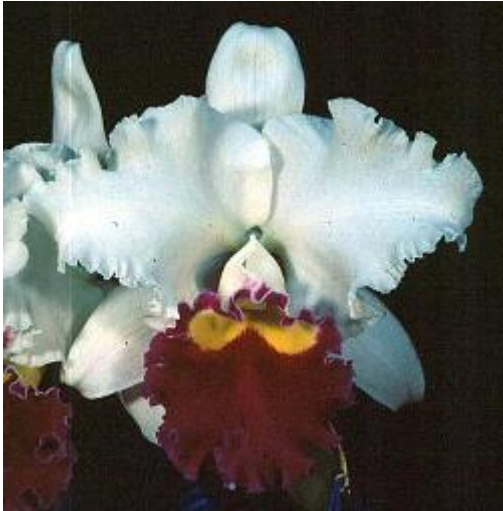
C. Starting Point 'Unique', AM/AOS; Grower: Armacost & Royston

hybrids are generally quite brightly colored, there are clouds to go with the silver lining. Many of the species being utilized to "miniature" hybrids are not orchids that fit into the "easy-to-grow" category. The ruficolous laelias [now considered to be members of a greatly expanded genus Cattleya ] can be especially intractable. Fortunately, the other parent, if properly chosen, in combination with the miniature species can help to mitigate the poor growing habit.