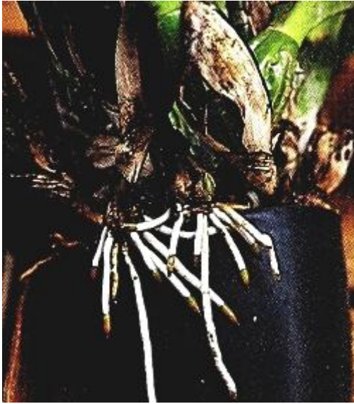
FIGURE 2. Though the new roots of this cattleya are well on their way, it is not too late to repot.

This picture also shows what we call the "stairstep" habit of many unifoliate species and hybrid cattleyas. The plant appears to be climbing out of its pot. While we will be discussing this habit at greater length later in the article, this habit greatly affects how a cattleya must be potted. The division must be leaned forward so that the rhizome is level with the surface of the mix. A plant potted in this way will tend to grow along the surface of the mix, rooting as it goes. If the rear portion of a division is sunk into the mix so as to keep the bulbs straight up and the new growth at surface level, the plant will tend to climb right out of its pot. Not only is this unattractive, the fresh root tips will not penetrate the potting medium quickly, if at all, leaving them exposed to insect or physical damage. So, no matter how unnatural it may seem at first to have the bulbs leaning forward, potting in this way really will help your plants to grow better in the long term.