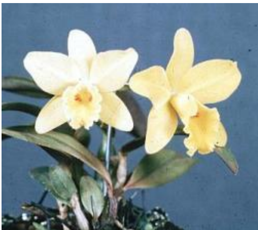
C. Beaufort 'Claire', AM/AOS; Grower: South River

Of course, not everyone can afford the money or space for a greenhouse. With the modern trend toward smaller-growing hybrids, it is becoming increasingly easy for the windowsill and under-lights growers to enjoy cattleyas. A bright east or west exposure, or a lightly shaded south exposure work best for cattleyas. Plants grown in the home will really enjoy being summered out-of-doors if conditions permit.