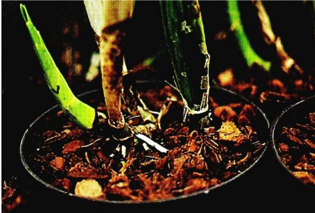
FIGURE 6. Because this division was incorrectly oriented, one month after repotting its new growth is entirely above the medium.

An improperly potted division as in FIGURE 6 will show symptoms early on. Although the mature lead bulb rooted into the mix, the developing growth is well above the surface of the mix. This photo was taken approximately one month after potting. The combination of incorrect orientation and the stairstep effect will result in the leads growing farther above the mix so that in two or three years, when the plant again requires potting, the newest lead may be four inches or more above the surface of the potting medium. Note also that the back bulbs are partially buried. This is a potential problem area for rots as the base of the bulbs may never entirely dry.