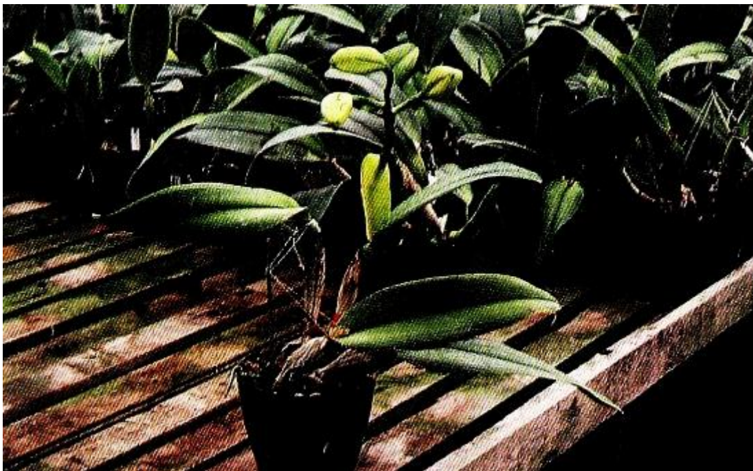
FIGURE 1. With sufficient light, a Cattleya should produce sturdy, upright new growths which require no staking.

CONSIDER these two very common situations: 1) An inexperienced hobbyist, perhaps with no more than two or three orchid plants, visits a commercial nursery and selects a plant for purchase. The plant, in bud and giving promise of a lovely display, is not one our friend has ever read or heard about. Upon inquiring about its cultural needs, he is informed that it needs "Cattleya conditions but with a bit more light" ... or water ... or shade ... or whatever! Or, 2) A hobbyist of long experience decides that this weekend he simply has to repot some (or all) of his Cattleya collection. Perhaps he has procrastinated; perhaps he is over-anxious. In any case, most of his plants do well after potting, rooting and growing with vigor. One plant (usually his favorite), however, does not respond at all well. The plant manifests all the symptoms of dehydration, doesn't make any new growths or roots, and ultimately succumbs.