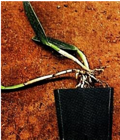
FIGURE 14. To combat this tendency to climb, an almost horizontal orientation of the seedling is necessary in repotting.

After all these "do's" and "don't's", the beginning grower might understandably approach potting his cattleyas with some trepidation. This is not the intention of this article. While cattleyas are certainly not the easiest orchids to pot properly, they are in general not all that difficult.