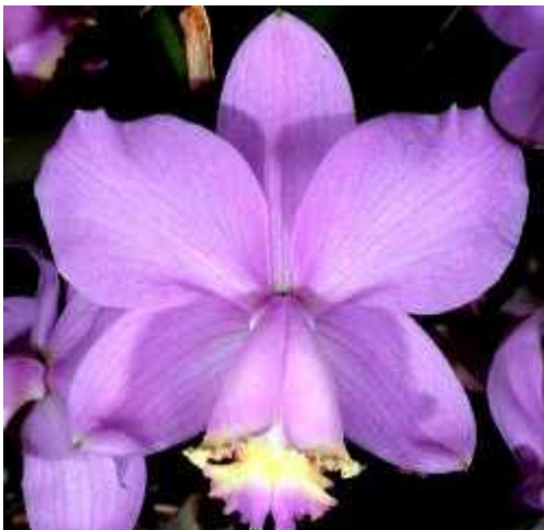
C. loddigesii 'Mai Short Sweetheart', FCC/ AOS; Grower: B. Andrus

Cattleya labiata : Brazil. The true C. labiata is a free-flowering species, bearing from two to five flowers, each from five to six inches across. The petals and lip are well balanced, the latter being more open than in C. eldorado but not as flat as in C. dowiana . Although quite variable in color, the basic pattern consists of rose-colored wavy petals, sepals the same color, the ruffled lip rich crimson-purple bordered with lilac. The origin of this species is told in the introductory sections of this article. The species is among the most important horticulturally and for commercial flower production. While replaced in the cut-flower trade by its outstanding hybrid progeny, it is notable for the ease with which its blooming season can be controlled by the use of light. Starting its growth in late March or April, it grows rapidly in the bright warm summer months, flowering immediately in the fall from October through November. Since it initiates buds on a shortening day, it is possible to retard flowering by maintaining a long day with the use of artificial light. When the light is discontinued (according to a timetable best established by each grower) the normal process begins and the plants flower at a date much later than normal, being directed toward the Christmas holidays and later. An excellent plant for the hobbyist, as are many of its hybrids. Produces a double sheath, a character occasionally passed on to its hybrids.