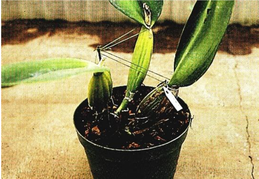
FIGURE 5. Properly positioned and staked, this Cattleya division should re-establish quickly.

"The bulbs are at the edge of the pot, but the mix is still good and it's growing so well! Maybe I'll just wait till next year to pot this one." Here, in FIGURE 4, is what happened. Saving a little work this year can lead to a major task next potting season. Pictures like this make even experienced potters shudder. When this type of tangling goes too far, entire leads must sometimes be sacrificed so that the division may be properly potted. We have even had new leads grow straight down over the pot's edge and through the slatted wood bench to flower underneath! The important lesson here is never to put off until tomorrow what is best done today!