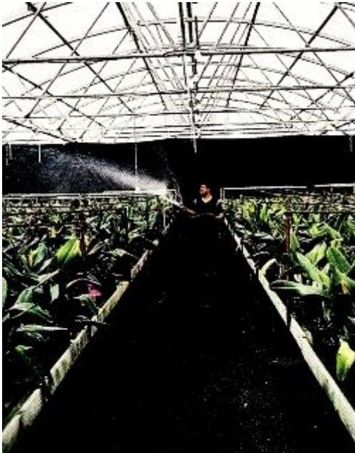
FIGURE 6. Spraying cattleyas with water is one way of lowering leaf temperature and reducing the risk of injury.

In nature, Cattleya species may be subjected to temperatures ranging from the low 40's to nearly 100F. However, conditions are generally more moderate, in the mid-50's to the upper-80's. Modern hybrid cattleyas are much modified by exceptions to the rule. Some knowledge of these exceptions and their part in any given hybrid is necessary.