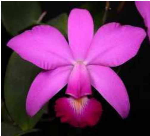
C. violacea 'Lois', AM/AOS; Grower: Jack Wible

forests below 300 feet in areas with significant day/night temperature differential. The climate is seasonal with high humidity and rainfall followed by an extended dry period. Flowering usually occurs from mid- to late-summer.