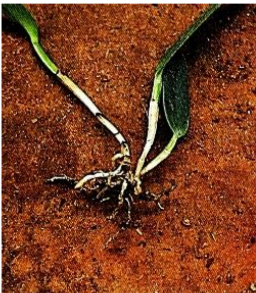
FIGURE 13. A stairstep growth habit manifests itself early in this seedling's development.

FIGURE 12 shows the stairstep effect in a more advanced stage. This plant was potted two years ago. There are already four bulbs on one rhizome which are over the pot edge. This obviously renders the plant difficult to keep upright, to bring into the home to enjoy or to keep out of its neighbors' pots! When purchasing plants, look for this behaviour and avoid it where possible. Unless, of course, you just can't resist the flower!