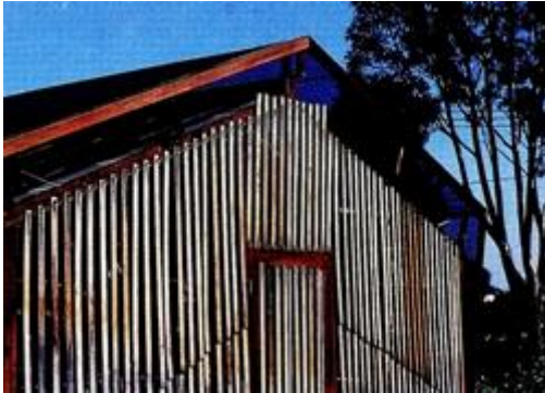
FIGURE 4. This greenhouse is properly shaded by lath on the side and a layer of shade cloth suspended on a frame above the roof. With shading, leaf-burn is unlikely.

Plants grown in too much shade will burn even more rapidly than those grown with proper light. Remember your first day at the beach after a long winter? The fact that the dark green foliage will draw heat even more rapidly only exacerbates the problem.