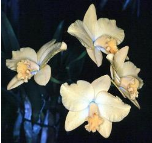
Ctt. Orglade's Early Harvest 'Lenette #2', AM/AOS; Grower: Lenette Greenhouse

their larger cousins. Another advantage is that the smaller types as a whole tend to be more prolific in the production of new growths. There are few sweeter things in the "Orchid World" than a 4-inch pot filled with a brightly flowered, dwarf Cattleya hybrid!