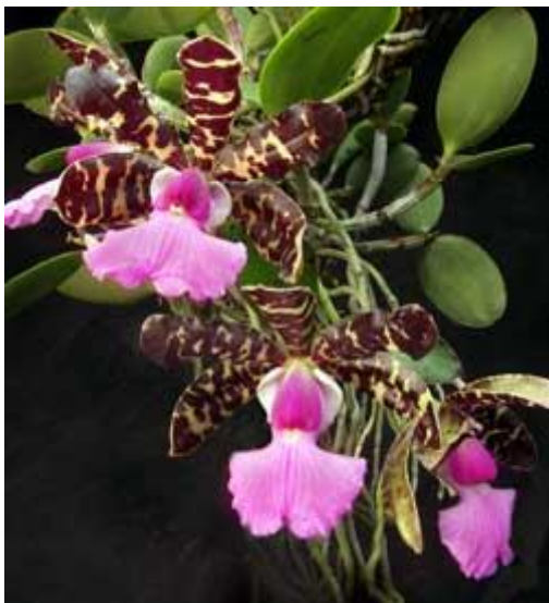
C. aclandiae 'KG's Spotted Tiger' HCC/AOS; Grower: Kathy Figiel

Horticulturally, there are about a score of more-or-less distinct species in the labiate section and about twice that number in the bifoliate group. At various times in the past, many of these have been considered to be only varieties of one or another of the species, but those listed below appear to be pretty well-supported genetically. Many Cattleya species are extremely variable in color, form, size, growth habit and blooming characteristics and because of this, the following information on a few of the more commonly grown species is quite generalized and approximate, serving only as an introductory guide.