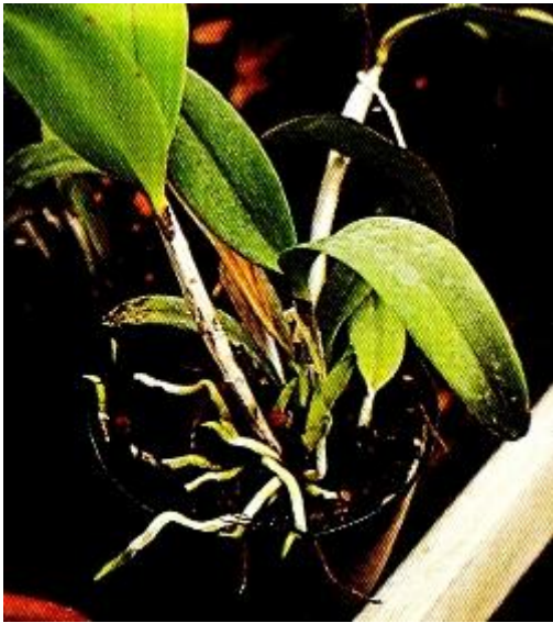
FIGURE 10. Vigorous rooting three months after repotting indicates this Cattleya seedling is becoming well-established.

FIGURES 9 and 10 show the rooting behaviour of young seedlings. FIGURE 9 shows a recently potted seedling just beginning to root. The slight dehydration in evidence is remedied as the plant establishes.