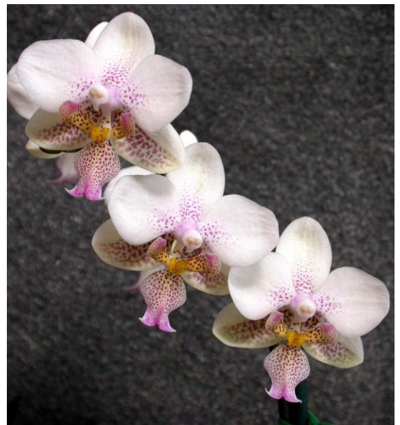
Phalaenopsis Via Malibu 'Stones River'