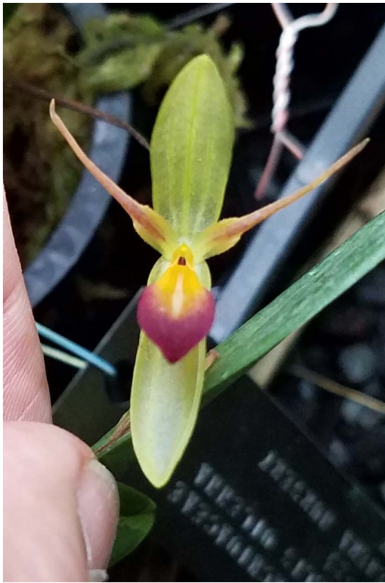
Pleurothallis medinae blooming at the Atlanta Botanical Garden in October.