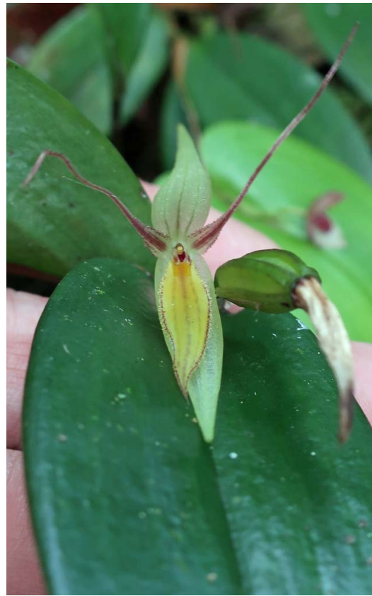
A Pleurothallis species blooming at the Waqanki Orchid Sanctuary in Moyobamba, Peru (April 2017).