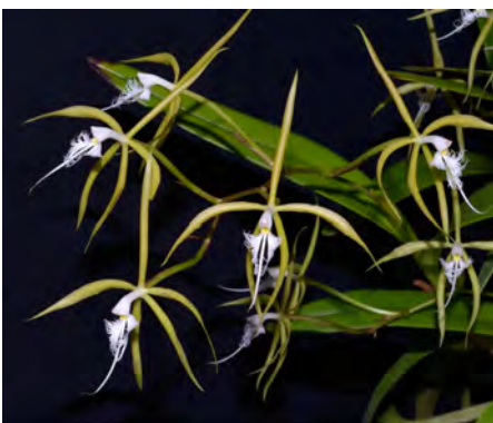
Epidendrum ciliare 'Ham's Bluff' – Darrell Demeritt

The tag on this plant had been corrupted over time, but seeing the photo it is definitely Epidendrum ciliare . The clonal name is a location on St. John, U.S.V.I., and it is quite likely that is where this plant originated. I have seen it on hikes through the national park there covering large boulders and rock ledges with masses of plant. This species is one of the most widespread orchids in the Western Hemisphere occurring in the