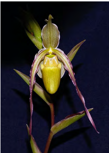
Phragmipedium longifolium var. gracile 'Bronze Elf', AM/AOS – Carson Barnes

This unusual form of a Central and South American species is smaller in all of its parts when