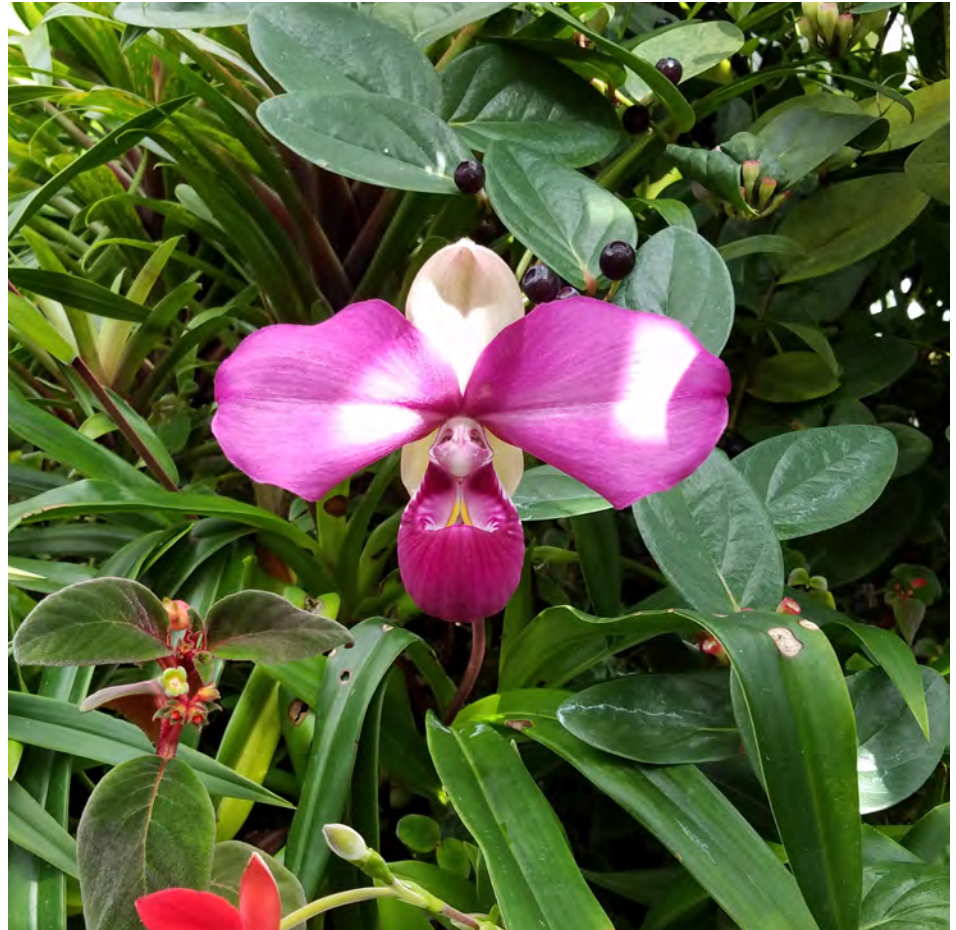
A splendid Phrag. kovachii that recently bloomed in the Atlanta Botanical Garden