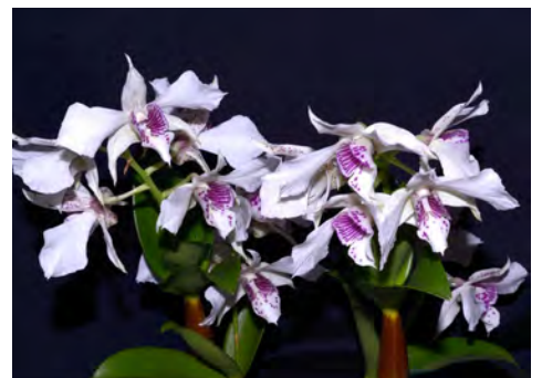
Dendrobium Royal Wings – Geni Smith

Dendrobium Royal Wings is a hybrid in the Latouria section of the genus, combining three species that all grow on the island of New Guinea. It is notable for having strong upright spikes holding several wide spreading flowers that are very long lasting and can occur more than once per year on mature plants. The color is mainly white, with purple markings in the lip. Generally the plants top out in the 12 to 15 inch range, with upright club like pseudobulbs that flush a reddish