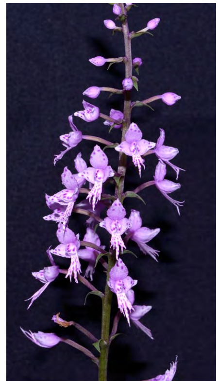
Stenoglottis longifolia – Roy Harrow

“Stenoglottis longifolia is easy to grow as long as you observe its need for summer dormancy. As spring becomes summer and the temperature rises, the leaves will begin to die back. This is the plant’s signal that it wants to go dormant so watering should be gradually decreased or stopped. If the air is humid, the pot can be placed in a no water area and ignored until a growth point appears. At this time, watering can begin again. If the air remains dry during its dormant period, an occasional watering might be necessary to keep the tubers from shriveling. It’s easy to just partially remove the top layer of soil to check the tuber and then recover the tuber. Plants will probably do well in any soil-based terrestrial mix. David Mellard grows his Stenoglottis in a mix of small kanuma, small perlite, and soilless mix in roughly equal parts. Kanuma is a pelleted volcanic soil used in bonsai culture. The mix