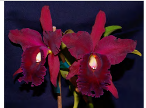
Cattleya Maria Ozella 'Black Watch,' AM/AOS

When introduced in 1934, C. Nigrella was a breakthrough hybrid in large flowered cattleya breeding. By recombining the genes of the pale yellow C. dowiana and the lavender C. labiata , with just a dash of C. loddigesii , over several generations, Sanders of St. Albans England achieved the first example of a deeply saturated purple flower. It became an important parent, not only producing C. Maria Ozella , but lending its genes to over 2,400 registered hybrids over the next six decades.