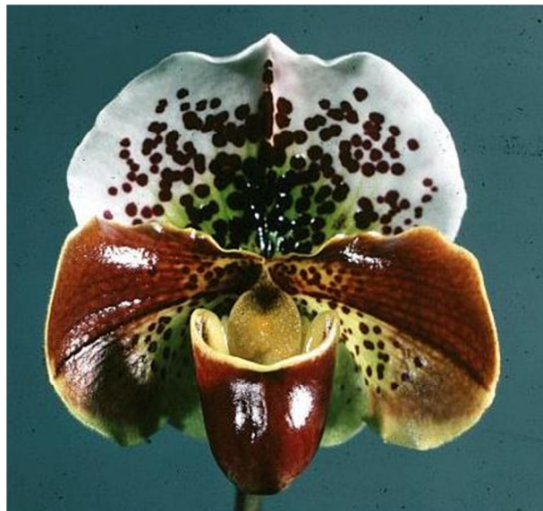
Figure 19 Paphiopedilum Spotglen 'Doodlebug', HCC/AOS (75pts.) (Sharnden x Geraldine) Exhibited by the Rod McLellan Company in January of 1981. It carried a 9.8cm (3.75 inch) flower

Summer temperatures for the hobbyist are generally the decisive factor in Paphiopedilum culture. Few climates, even those more moderate, are entirely spared periods when day temperatures are in the 90's F (32-37°C). During these times especially, temperatures indoors may vary little daily from the warm or steaming, much of the solar heat of the day being retained indoors into the night hours. Likewise, while air-conditioning can bring temperatures