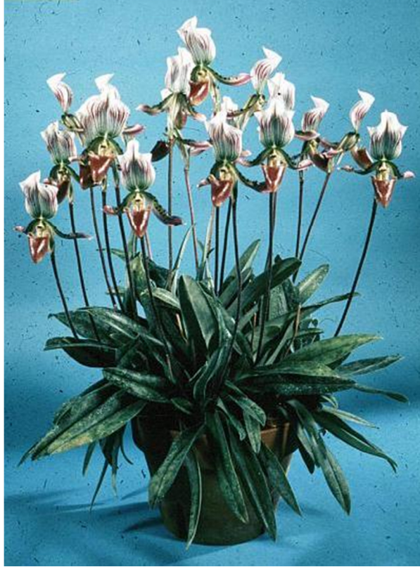
Paphiopedilum callosum 'Mary', CCM/AOS (85pts) Awarded in June of 1976 with 18 flowers 9.7cm (3.75 inches) across on 18 inflorescences.

1977, page 147) The multifloral Paphiopedilum species and primary hybrids are also a good example of this phenomenon. If the under lights grower is having difficulty flowering Paphiopedilum philippinense or Paph. lowii , he or she need not despair; Paphiopedilum Berenice ( lowii X philippinense ) (FIGURE 6) both grows and flowers readily under lights – as do many other primary hybrids of the more recalcitrant species.