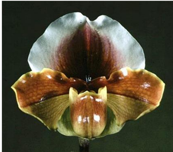
Figure 17 Paphiopedilum Peachie 'Madeira', AM/AOS (85pts.) (Hellas x Betty Bracey) Exhibited by Val & Jack Tonkin and awarded in March of 1979 with a flower 10.9cm (4.25 inches) across.

day temperature, good growth and bloom will ensue." (Hewlett, 1972, pages 622, 623, 626) Based on her experiences in growing paphiopedilums under greenhouse conditions in South Carolina, Mrs. Hewlett classifies the following as warm growing, recommended for culture in the southern United States: Paphiopedilum appletonianum , Paph. argus , Paph. bellatulum , Paph. charlesworthii , Paph. ciliolare , Paph. concolor , Paph. godefroyae , Paph. haynaldianum , Paph. lowii , Paph. niveum , Paph. parishii , Paph. philippinense , Paph.