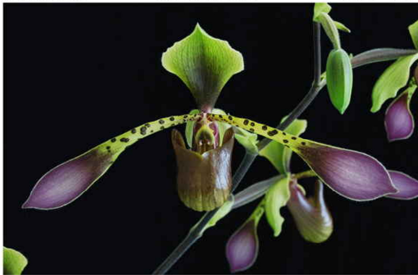
Paph. lowii 'Waunakee Warrior' AM/AOS 88 points

Paphiopedilum species, many highly desirable, primary hybrids have resulted (Peterson, 1979b). Paphiopedilum Julius ( rothschildianum X lowii , registered in 1913), whose flowers are similar to those of Paphiopedilum Berenice, has toils credit nearly a dozen A.O.S. awards (appearing in this year's issues of the AWARDS QUARTERLY alone). Not all successful primary hybrids of multifloral Paphiopedilum species are remakes of old crosses, however. Paphiopedilum Bengal Lancers, a cross of Paphiopedilum haynaldianum and Paphiopedilum parishii , two worthy, strap-leaf species in their own right, was registered in 1974, and has received almost ten A.O.S. awards to date.