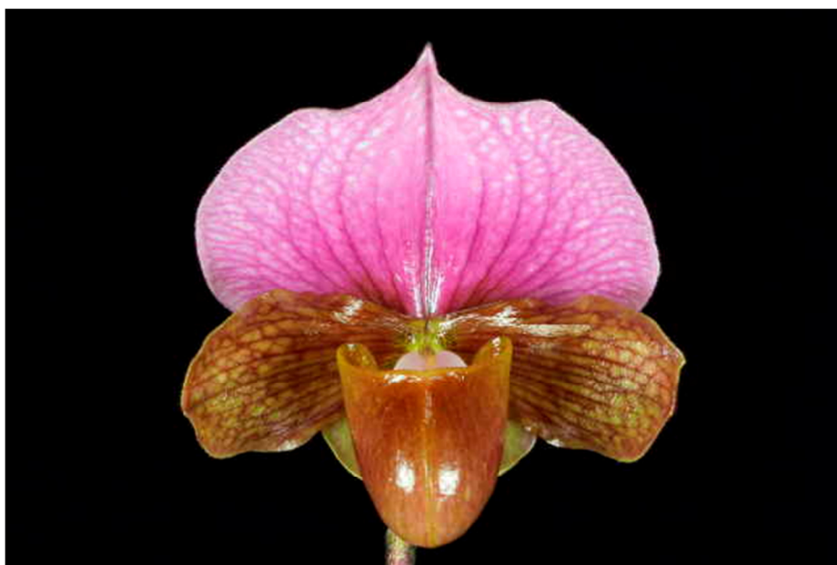
FIGURE 1: Paphiopedilum charlesworthii , a fine example of the genus, flowering in August.

As A RECENT SUBSCRIBER, I used to scoff at the frequent appearance in the AMERICAN ORCHID SOCIETY BULLETIN of articles on paphiopedilums, accusing the editorial staff, in its northern location, of a bias towards the cooler-growing genera. Living in central Florida at the time, I saw no reason, as a beginner, to even consider trying to grow these orchids. It is with a sense of irony, then, that some years later I am about to begin an article intended to encourage beginners everywhere to grow suitable Paphiopedilum species and hybrids — of which there are many, whatever the location!