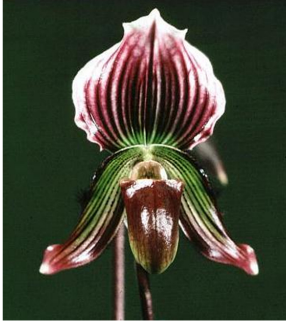
Figure 15 Paphiopedilum Faire-Maud 'Red Dot', HCC/AOS (76pts.) (fairrieanum x Maudiae) Awarded in 1980 and exhibited by Seacoast Orchids.

Those considering growing paphiopedilums in warmer climates should not miss Leora Hewlett's very helpful article, "Growing the Cypripedilinae in the South" (July 1972 BULLETIN). Here she points out, "The constant factors for paphiopedilums in their native habitats are: good humidity, good drainage, constant air movement, constant moisture for the root system, little day-night-length variation, tempered light and clean growing media. Temperature is the variable factor in the natural habitat.