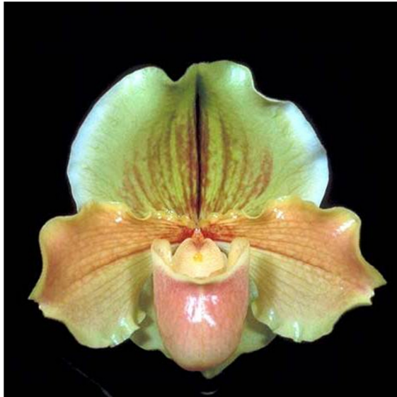
Figure 16 Paphiopedilum Apropo 'Winifred', HCC/AOS (78pts) (Diversion x Brownly) Exhibited in March 1980 by Ralph Zuranski and awarded with two flowers 12cm (4.75 inches) across on two inflorescences

Those considering growing paphiopedilums in warmer climates should not miss Leora Hewlett's very helpful article, "Growing the Cypripedilinae in the South" (July 1972 BULLETIN). Here she points out, "The constant factors for paphiopedilums in their native habitats are: good humidity, good drainage, constant air movement, constant moisture for the root system, little day-night-length variation, tempered light and clean growing media. Temperature is the variable factor in the natural habitat.