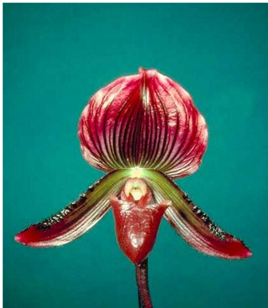
Figure 14 Paphiopedilum Maudiae 'Shueng Yuet Chin', AM/AOS (80pts) (callosum x lawrenceanum) coloratum type

1977, page 147) The multifloral Paphiopedilum species and primary hybrids are also a good example of this phenomenon. If the under lights grower is having difficulty flowering Paphiopedilum philippinense or Paph. lowii , he or she need not despair; Paphiopedilum Berenice ( lowii X philippinense ) (FIGURE 6) both grows and flowers readily under lights – as do many other primary hybrids of the more recalcitrant species.