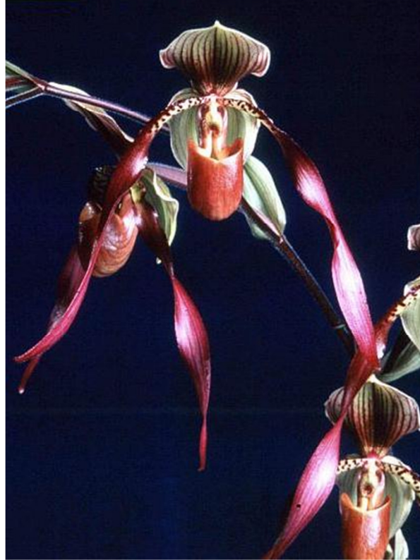
Figure 6 Paphiopedilum Berenice 'Blumen Insel', FCC/AOS (92pts.) (lowii x philippinense)

An average clone flowering during July and August can have four or five flowers, 5 inches (13cm) across, on one 1 ½ foot (46cm) inflorescence.