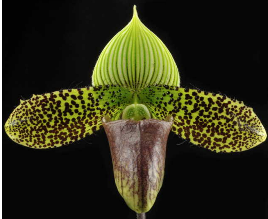
Paphiopedilum sukhakulii 'Bold Statement', AM/AOS (82pts) exhibited by Hilo Orchid Farm in 2010

Paph. bellatulum , Paph. callosum , Paph. chamberlainianum , Paph. ciliolare , Paph. curtisii , Paph. glaucophyllum , Paph. godefroyae , Paph. haynaldianum , Paph. hirsutissimum , Paph. hookerae , Paph. lawrenceanum , Paph. lowii , Paph. niveum , Paph. parishii , Paph. philippinense , Paph. rothschildianum , Paph. stonei and Paph. tonsum , among others. These species all originate from the lower, warmer elevations of the Far East. Those Paphiopedilum species designated "C" in Hawkes', "average night temperatures of 45-50°F [7-10°C] during the cool months", or "I" only (55-65°F, 13-18°C), were definitely in the minority: Paph. charlesworthii , Paph. concolor , Paph. fairrieianum , Paph. insigne , Paph. spicerianum , Paph. venustum and Paph. villosum . Many of these cooler-growing species from the higher altitudes of the Far East figure prominently in the background of today's complex Paphiopedilum hybrids.