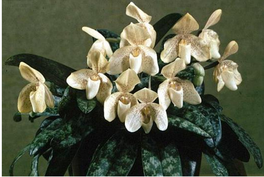
Paphiopedilum concolor 'Shirley', CCM/AOS (85pts.) exhibited by Michael Roccaforte , awarded in August of 1973 with 11 flowers 6cm (2 ½ inches) across and seven buds on seven inflorescences.

Light is only rarely the determining factor in the selection of one Paphiopedilum over another. Most paphiopedilums, from the most complex of hybrids to the species, will grow and flower successfully with the light intensities found under conventional fluorescent tubes (Raynor, 1975), provided that four-tube fixtures are used, the plants are within a foot (30 cm) of the lights, and the lights are on at least 12 hours a day (Batchelor, 1981a). The usually epiphytic, strap-leaf species, such as Paphiopedilum parishii and Paph. lowii , might prove difficult to flower under lights, however. These species, by virtue of their sunnier origins, may require higher light levels to flower well (Hartman, 1976; Hewlett, 1972).