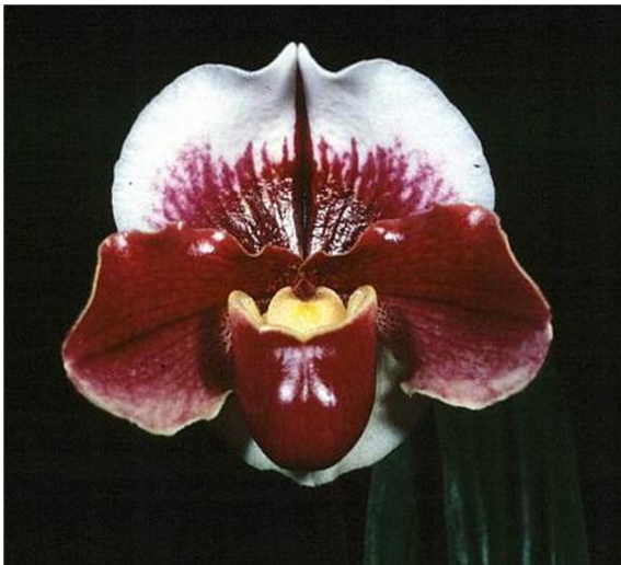
Figure 18 Paphiopedilum Bournette 'Basque', HCC/AOS (77pts.) (Bourneva x Millionette) Exhibited by Fred A. Stewart, Inc. in March of 1980. The flower was 10.3cm (4 inches) across.

sukhakulii , Paph. tonsum and Paph. venustum . She also recommends Paphiopedilum spicerianum and Paphiopedilum fairrieanum , plants of which are grown in the cooler areas of the Hewlett's intermediate greenhouse. In their "cool house", where both evaporative cooling and air-conditioning are provided, Paphiopedilum hirsutissimum , Paph. insigne , Paph. villosum and complex Paphiopedilum hybrids find a more suitable home. INDOOR/OUTDOOR CULTURE OF PAPHIOPEDILUMS