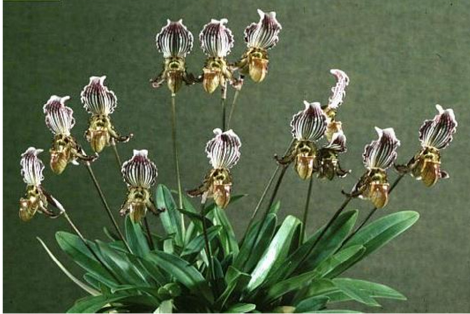
Paphiopedilum fairrieanum 'Big Mama', CCM/AOS (80pts) Awarded in January 1978 with 13 flowers, 6.1cm (2 1/3 inches) across, on 13 inflorescences. Exhibited by Norman L. Berwick

The original Paphiopedilum Maudiae , registered in 1900, was a cross of albino cultivars (lacking red pigment) of Paphiopedilum callosum and Paphiopedilum lawrenceanum . The resulting flowers were white and green. Normally pigmented cultivars of Paphiopedilum callosum (FIGURE 13) and Paphiopedilum lawrenceanum were crossed soon thereafter, making the "coloratum" clones of Paphiopedilum Maudiae (FIGURE 14) (Peterson, 1977). For a slightly different flower form, Paphiopedilum Maudiae was crossed with Paphiopedilum fairrieanum (FIGURE 8) to create Paphiopedilum Faire-Maud , registered in 1909 (FIGURE 15). Yet modern-day hybridizers have resumed breeding with Paphiopedilum Maudiae (Nash, 1981). For instance, utilizing ever darker cultivars of Paphiopedilum callosum and Paphiopedilum lawrenceanum , as well as those of other species such as Paphiopedilum curtisii , they are creating flowers so heavily pigmented they appear virtually black in color.