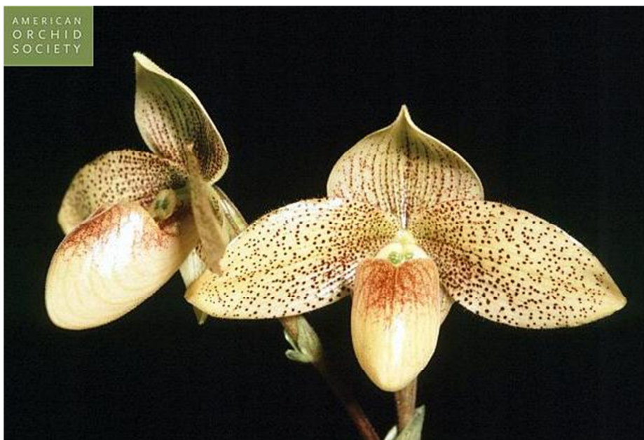
Paphiopedilum Colorkulii 'Shirley D', HCC/AOS (78pts) (concolor x sukhakulii) exhibited in 1990 by Neal R. Amundson.

Temperature, rather than light, is more often the stumbling-block for successful Paphiopedilum culture. It is generally believed that many paphiopedilums, particularly the complex hybrids, require a "cool treatment" at some time during the year in order to flower properly (Wilcox, 1971). Walter Bertsch, in a very thorough series of three articles on growing paphiopedilums, recommends night temperatures in the fall of 55-60°F (13-16°C) for two to eight weeks to induce flowering, finding that, on the other hand, night temperatures of 65-68°F (18-20°C) are best for vegetative growth, while day temperatures above 80°F (27°C) can be inhibiting. At the same time he mentions, "Day temperatures of up to 90°F [32°C] may actually be beneficial for some tessellated paphs such as Paph. callosum , Paph. Clair de Lune and the warmer growing brachypetalums. This is also true for certain large, strap-leaf paphs, which may not have tessellations, such as Paphiopedilum philippinense ." (Bertsch, 1979, pages 892-893). This would indicate that paphiopedilums offer some leeway in terms of temperature.