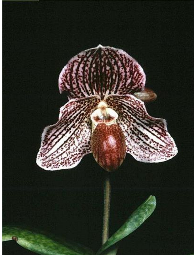
Figure 9 Paphiopedilum Iona 'Carrie K.' , HCC/AOS (76pts.) (bellatulum x fairrie anum)

generally lack distinct patterning on their leaves, have growths with leaves usually under a foot (30 cm) long when flowering size, and generally grow and flower best under cooler night temperatures. Their glossy, thick flowers, usually 4 inches (10 cm) or more across, frequently have a round form, created by the overlapping of very broad flower parts. Every conceivable color pattern is represented, the flowers presented boldly, and usually singly, on sturdy stalks which require minimal staking ( see the front cover of this issue, and FIGURES 16—19). Peak flowering of the complex Paphiopedilum hybrids is during the winter months of the year, but individual flowers can last over three months, particularly if cooler, lower light conditions prevail.