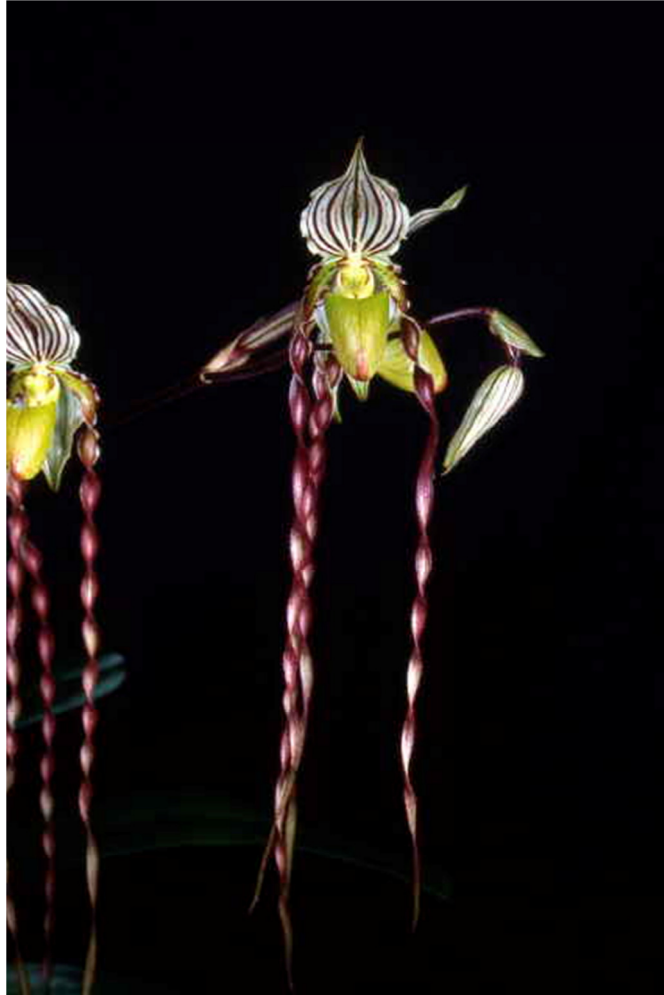
Figure 4 Paphiopedilum philippinense var. roebelenii 'Ten Inch Tales', AM/AOS (80 pts) Awarded in 1998 with 4 flowers, nearly a foot long, and 2 buds on 1 inflorescence.

Paphiopedilum philippinense var. roebelenii (synonym philippinense ) (FIGURE 4) and Paphiopedilum lowii (FIGURE 5) provide a strong contrast to the