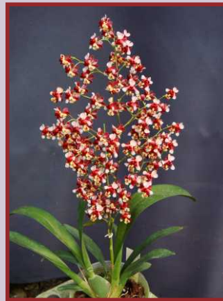
AJC-N015 Onc.Chiou-Pin 'Hanabi' Flower Size: Small Flowering: Nov-Feb Fragrance: Yes