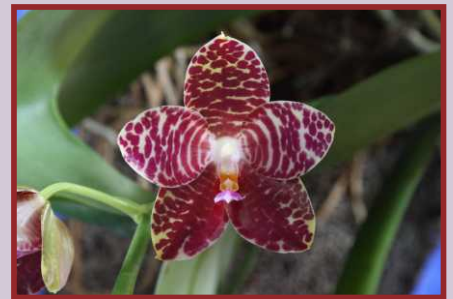
AJY-11104 P. gigantean X P. Yungho Princess Gelb