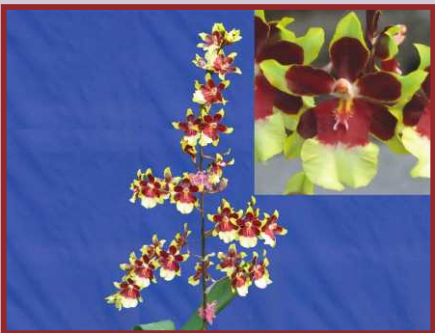
AJG/OD-009 Odcdm. Wildcat 'Rainbow' S.L.: 70-80cm N.S.: 5-6cm Climate: Little Cold Fragrance: No