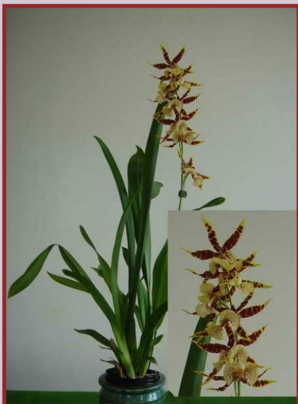
AJG/DG-002 Dgmra. Flying High 'Star & Bars' HCC/AOS S.L.: N/A N.S.: N/A Climate: Warm Fragrance: No