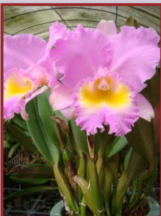
AJC-0091 Blc.Triumphal Coronation 'Spring Beauty' Flower Size: Very large Flowering: Nov-Apr Fragrance: No