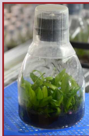
Middle flask 3-4 months to child flask