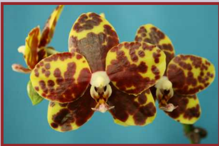
AJY-12237 P. Chiu Jih Peoker x P. Sogo Pride