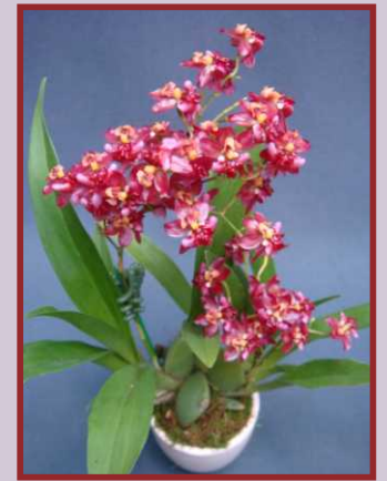
AJC-N010 Onc.Twinkle 'Delight' Flower Size: Small Flowering: Nov-Feb Fragrance: Yes