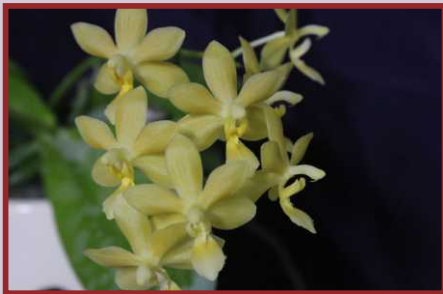
AJY-11064 P. Stone Dance var. yellow