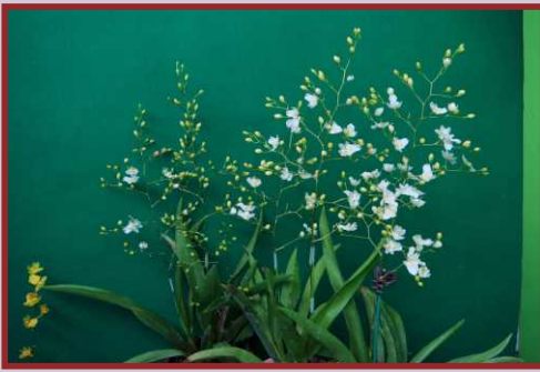
AJC-I002 Ionocidium. Catherine 'Lily' Flower Size: Small Flowering: Dec-Mar Fragrance: No