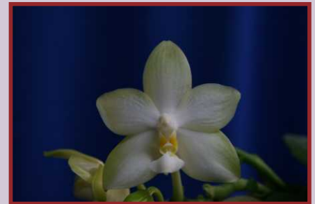
AJY-12148 P. Yungho Gelb Canary x P. Penang Violacea