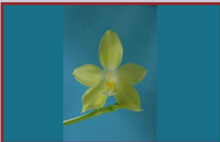
AJY-11117 P. javanica var. stripes