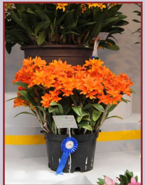
AJW-11089 Blc. Young Min Orange Flower Size: 4cm Flowers: Cluster Flowering: N/A