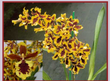
AJG/BT-003 Btcm. Hwuluduen Wasp "Queen Bee" S.L.: 30-50cm N.S.: 4-5cm Climate: Warm Fragrance: No