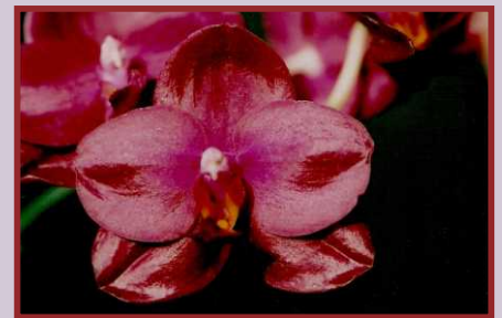
AJY-11079 P. Sogo Cock