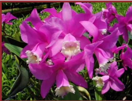
AJC-0102 C. Loddisong 'Summer Beauty' Flower Size: Medium Flowering: June-July Fragrance: No