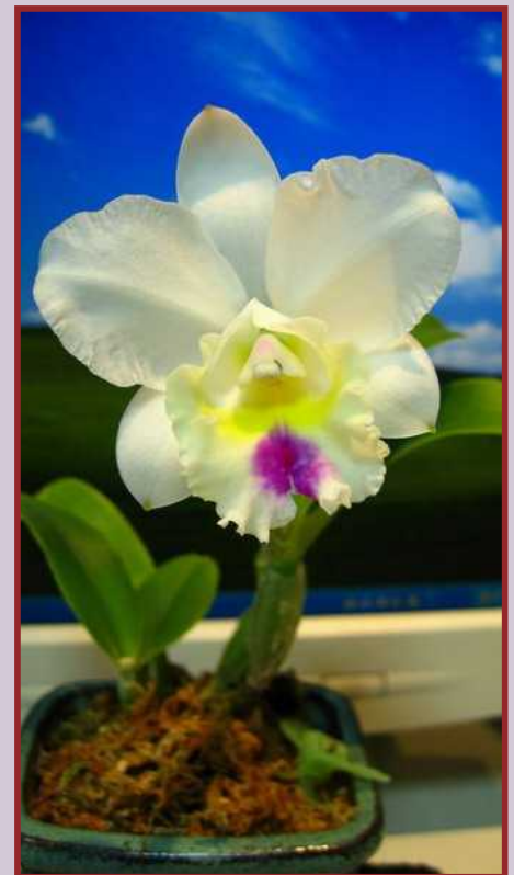
AJW-11024 Blc. Mini Heart 'Little Rainbow' Flower Size: 7cm Flowers: 2-3 Flowering: 1/yr