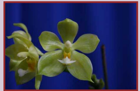
AJY-11065 P. Ho's Green Marble var. green