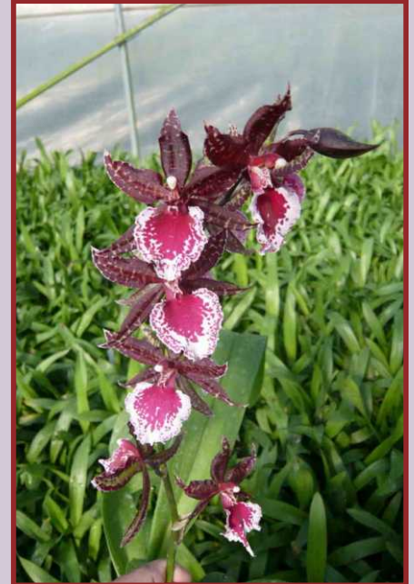
AJG/CO-002 Colmanara Massai 'Splash' S.L.: N/A N.S.: N/A Climate: Little Cold Fragrance: Little