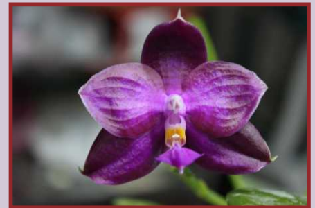
AJY-11120 (P. Gelblieber X P. Coral Isles) X P. violacea