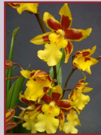
AJC-W005 Wils.Golden Afternoon 'Wise' Flower Size: Medium Flowering: Irregular Fragrance: Yes