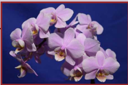
AJY-11192 P. Rothschildiana