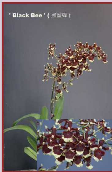
AJU-005 Hsu. Twinkle ' Black Bee '