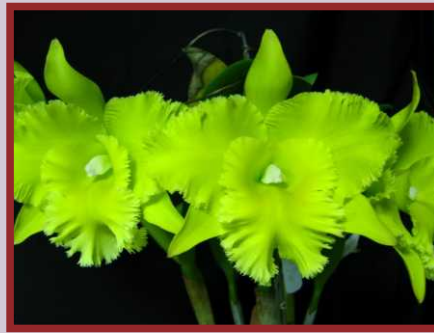
AJW-11027 Blc. Ports Of Paradise Flower Size: 14cm Flowers: 2-3 Flowering: 1-3/yr