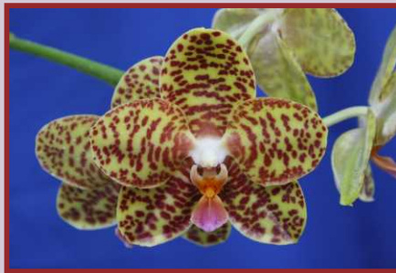
AJY-11103 Dtps. Chang Jhih Greengrape