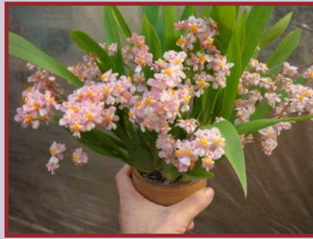
AJC-N007 Onc.Tsiku Marguerit 'Romantic Fantasy' Flower Size: Small Flowering: Nov-Feb Fragrance: Yes