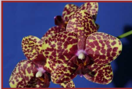
AJY-12241 Chang Jhih Rose