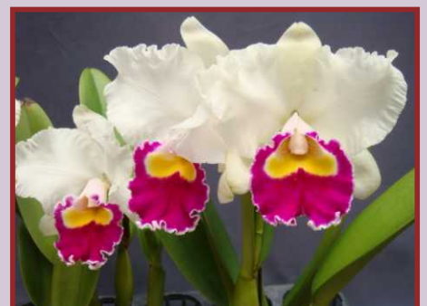
AJC-0103 Lc. Husman Galla 'Z1164' Flower Size: Large Flowering: Dec-Feb Fragrance: No