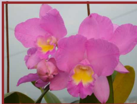
AJW-11081 Slc.Doris and Byron 'Christmas Rose' Flower Size: 7cm Flowers: 2-4 Flowering: 1/yr