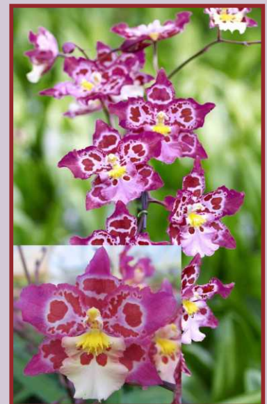
AJG/ZG-001 Zgd. Calico Gem '#1' S.L.: 30-80cm N.S.: 6-8cm Climate: Cold Fragrance: No