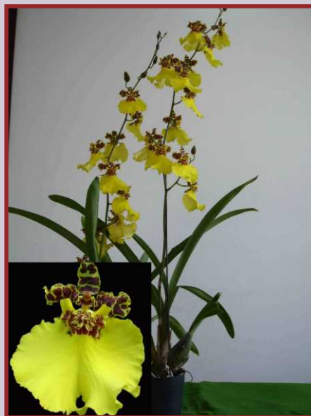
AJG/NC-004 Onc. Jiuobao Gold S.L.: 70-80cm N.S.: 5-7cm Climate: Hot Fragrance: No