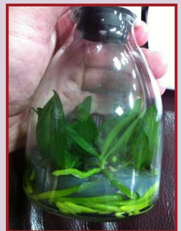
Child Flask → ready for shipping