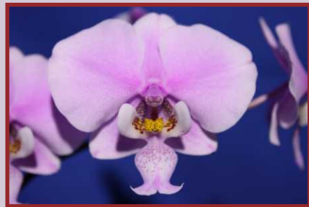
AJY-12152 P. schilleriana "Pink Butterfly"