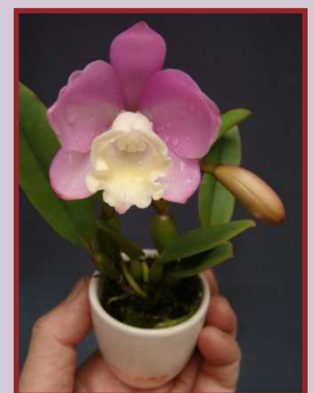
AJC-0134 Cattlianthe 'Mesha' Flower Size: Small Flowering: Irregular Fragrance: No