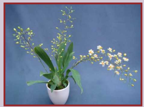
AJC-N023 Onc.Twinkle 'Sirayuki' Flower Size: Small Flowering: Nov-Feb Fragrance: Yes