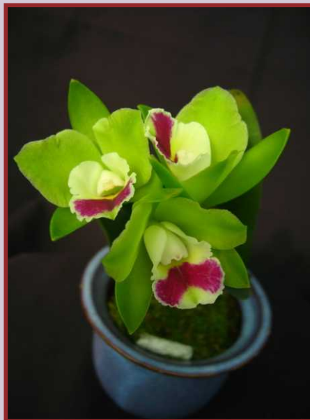
AJW-11048 Pry. Green River Flower Size: 5cm Flowers: 2-4 Flowering: Irregular