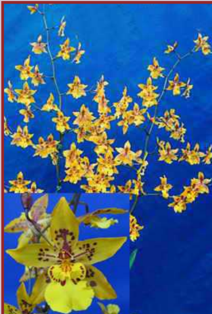
AJG/OD-006 Odcdm. Tiger Crow "Golden Girl" S.L.: 60-90cm N.S.: 5-9cm Climate: Little Cold Fragrance: Yes