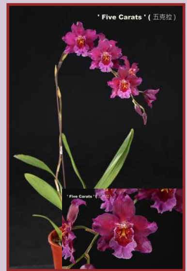
AJU-007 Vuyl. Diamond ' Five Carats '