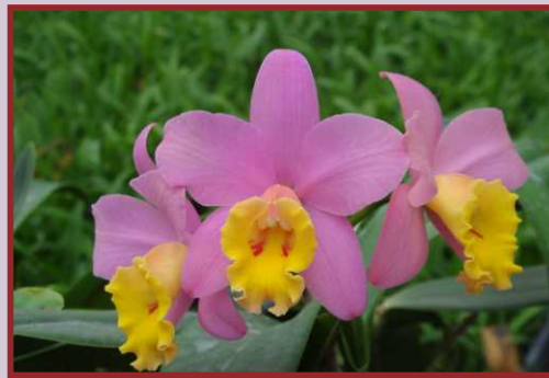
AJC-0133 Sc.Crystelle Smith 'N.R' HCC/AOS Flower Size: Small Flowering: Irregular Fragrance: No