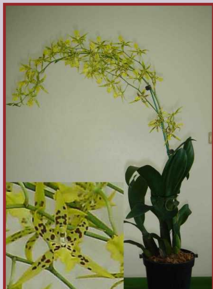
AJG/BR-001 Brsdm. Tzeng-Wen Spot S.L.: N/A N.S.: N/A Climate: Warm Fragrance: No