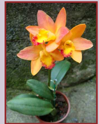
AJC-0135 'Sunset' Flower Size: Small Flowering: Mar-May Fragrance: No