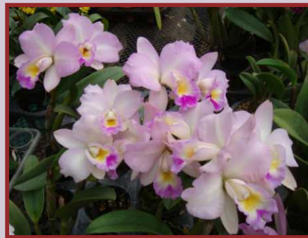
AJC-0101 Blc. 'Year's Fantasy' Flower Size: Medium Flowering: Jan-Mar Fragrance: Yes