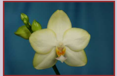
AJY-11127 P. Ba-Shi Blackspot var. green