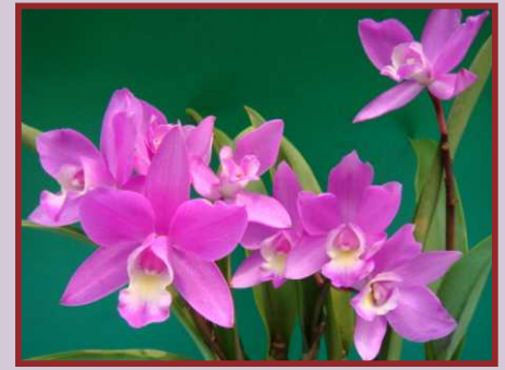
AJC-0106 Lc. 'Kermes Beauty' Flower Size: Small Flowering: Mar-Apr Fragrance: No