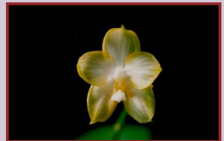
AJY-11126 P. Yungho Gelb Canary var. green