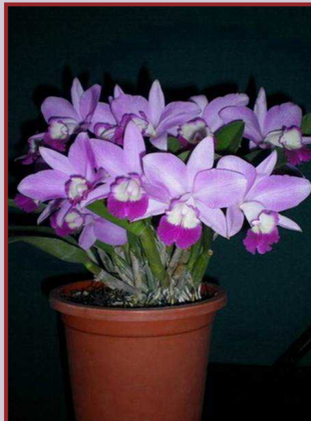
AJW-11015 Lc. Exotic Smile '4N' Flower Size: 9cm Flowers: 2-3 Flowering: 1/yr