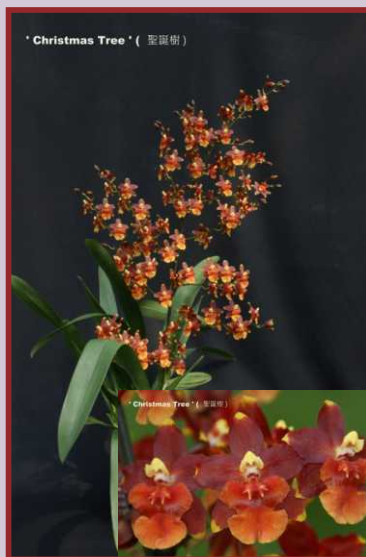
AJU-009 Wils. Pixie ' Christmas Tree '