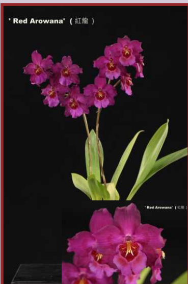
AJU-008 Vuyl. Diamond ' Red Arowana '