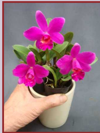
AJC-0092 L.(pumila x praestans) 'Little Red' Flower Size: Small Flowering: Irregular Fragrance: No