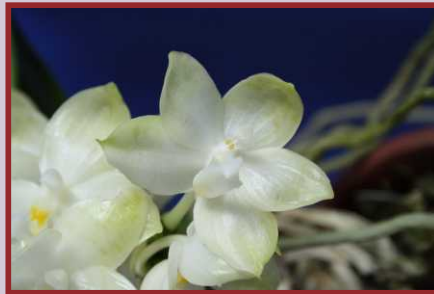
AJY-11123 P. Tzu Chiang Litlitz var. alba