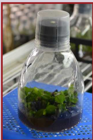
Meristem Flask 3-6 months to mother flask

You are free to pre-order varieties from our mother and middle flask lists, which we will then develop into child flasks or even 1.7" and 2.5" plants for you.