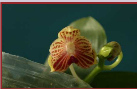
AJY-11117 P. javanica var. stripes