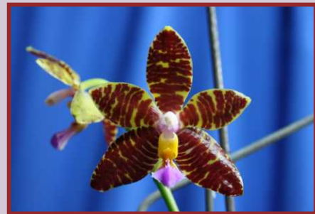
AJY-11119 P. Spica X P. Golden Pride