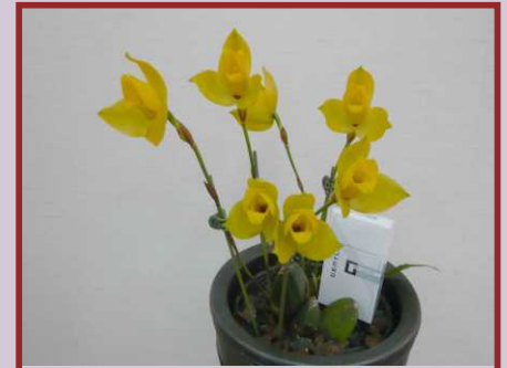
AJG/LY-005 Lyc. Hamana Jason x Concentration S.L.: 30-40cm N.S.: 8-10cm Climate: Little Cold Fragrance: Yes