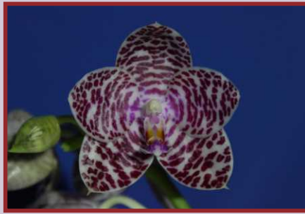
AJY-11076 P. Sogo Lobby "#2"