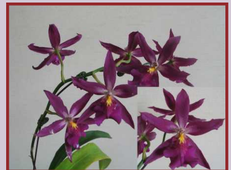
AJG/BL-001 Bllra. Marfitch 'Howard's Dream' (Fire Phoenix) S.L.: 70-80cm N.S.: 8-10cm Climate: Little Cold Fragrance: No