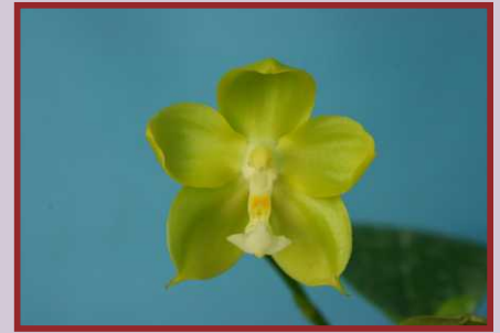
AJY-12135 P. Ho's Dreamy Jade "Yellow"