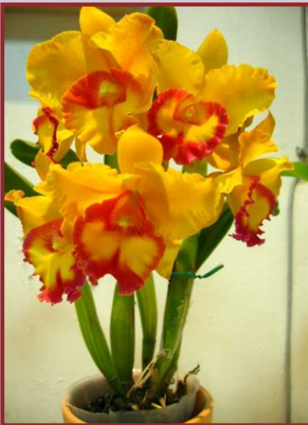
AJW-11072 Pot. 'Happy Tuesday' Flower Size: 10cm Flowers: 2-3 (normally) Flowering: 1-2/yr