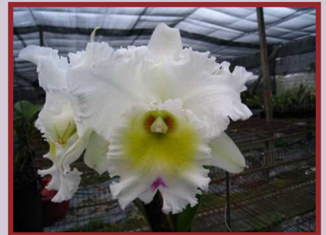
AJW-11032 Blc. Liou Hope 'Sherry' Flower Size: 16cm Flowers: 2 Flowering: 1/yr