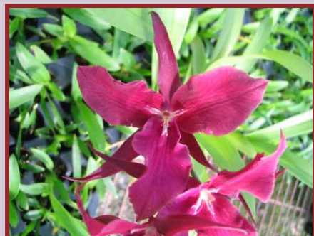
AJG/MTS-002 Mtssa. Royal Robe 'Green Valley' S.L.: 20-40cm N.S.: 7-9cm Climate: Hot Fragrance: No