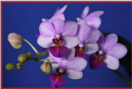
AJY-11140 Dtps.Liu's Berry