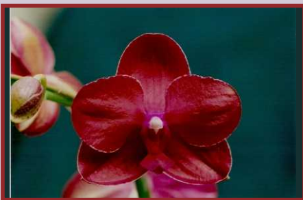
AJY-11068 P. amboinensis