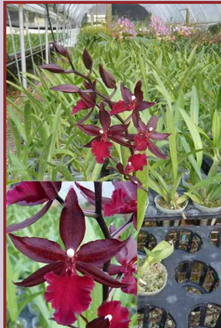
AJG/CO-001 Colmanara Massai Red S.L.: N/A N.S.: N/A Climate: Little Cold Fragrance: Little