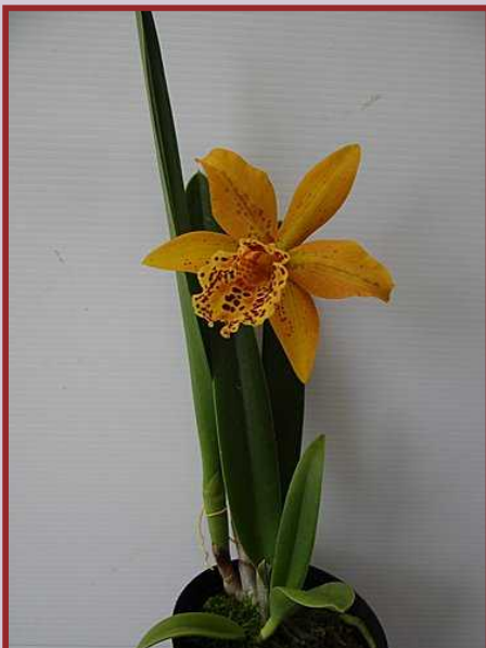
AJW-11086 Blc. Copper Queen Flower Size: 10cm Flowers: 1-2 Flowering: N/A