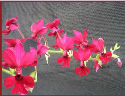
AJG/CE-004 Calanthe rubens (Clone) S.L.: N/A N.S.: N/A Climate: Warm Fragrance: No