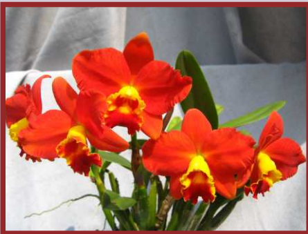
AJW-11017 Pot. Red Jewel Flower Size: 8cm Flowers: 3-4 Flowering: 2/yr