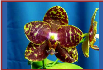
AJY-11069 P. Sogo Pony