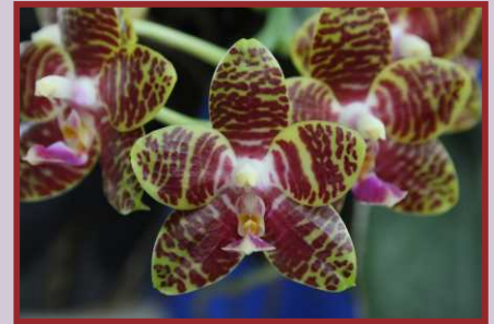
AJY-11105 P. Black Beauty X P. Coral Isles