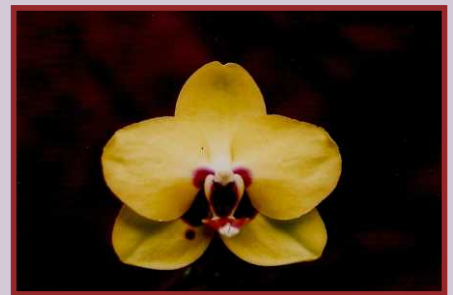
AJY-11111 Dtps. Sogo Dio "#2"