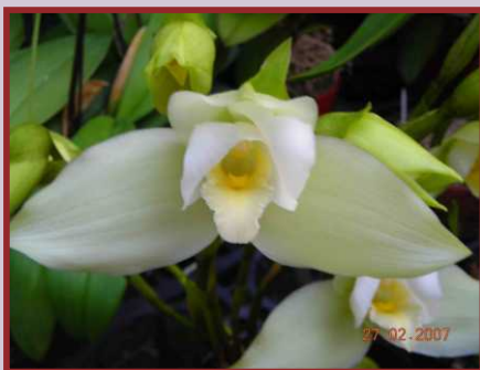
AJG/LY-003 Lyc. Auburn X Lyc. Highland Peak S.L.: 10-20cm N.S.: 8-15cm Climate: Little Cold Fragrance: No