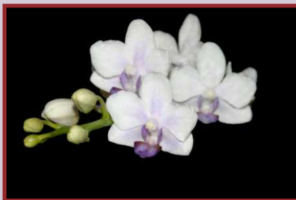
AJY-12152 P. schilleriana "Pink Butterfly"