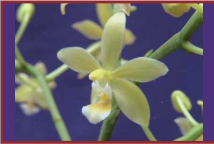
AJY-11085 P. cornustris var. green