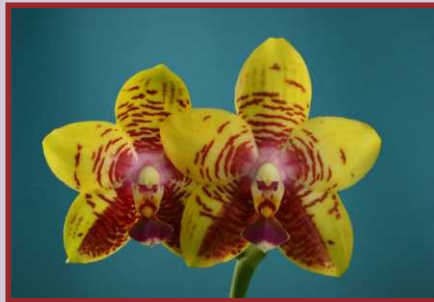
AJY-11157 P. Orchid World