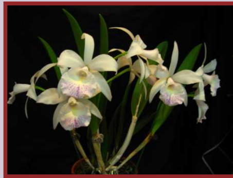
AJW-11038 Rby. Cindy 'Perfume' Flower Size: 10cm Flowers: 3-4 Flowering: 1/yr