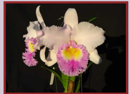
AJW-11030 Rsc. Jinn Feng Wish 'Classical' Flower Size: 19cm Flowers: 1-2 Flowering: 1-2/yr