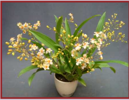
AJC-N011 Onc.Twinkle 'White Strong' Flower Size: Small Flowering: Nov-Feb Fragrance: Yes