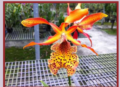
AJW-11158 Recc. Frances Fox 'Fire Fox' Flower Size: 9cm Flowers: 5-7 Flowering: Irregular