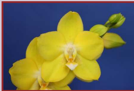
AJY-11073 Dtps. Sogo Nihou var. golden