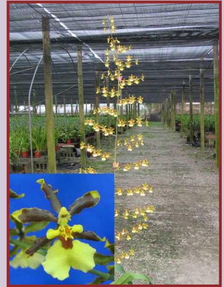
AJG/WI-002 Wils. Tropic Breeze 'Everglades' S.L.: 80-90cm N.S.: 5-6cm Climate: Warm Fragrance: Yes