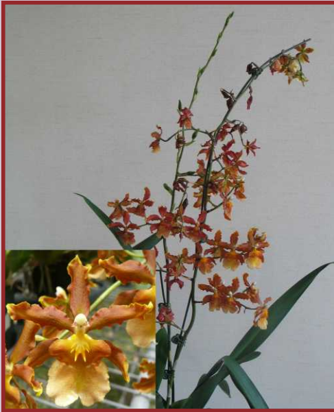
AJG/OD-001 Odcdm. Catatante 'Los Robles' S.L.: N/A N.S.: N/A Climate: Little Cold Fragrance: No