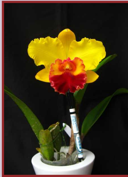
AJW-11074 Blc. Taiwan Ruby T.Y 6 Flower Size: 15cm Flowers: 1-2 Flowering: 1-2/yr