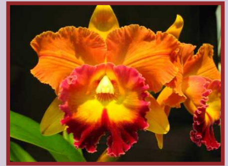
AJW-11025 Blc. Taiwan Ruby 'Magic' Flower Size: 15cm Flowers: 2 Flowering: 1/yr