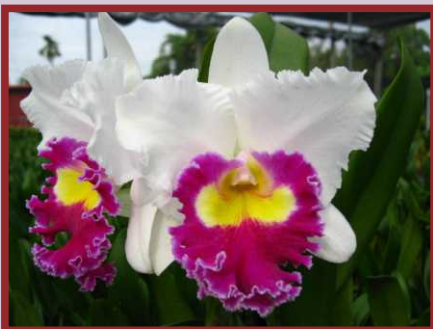
AJW-11063 Blc. Li Cheng Mary "Sweet Heart" Flower Size: 15cm Flowers: 1-2 Flowering: 2/yr