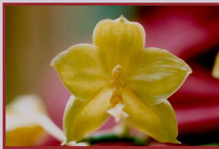
AJY-11124 P. Tzu Chiang Litlitz var. yellow