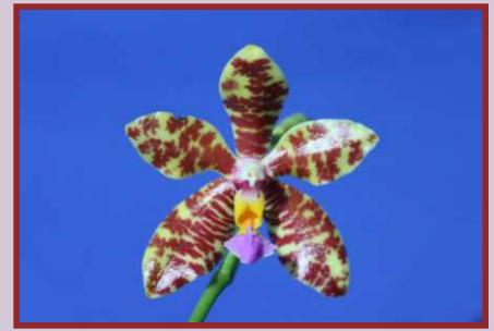
AJY-11062 P. Spica