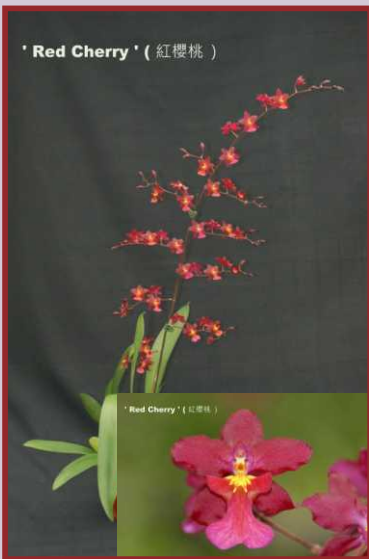
AJU-004 Wils. Nova ' Red Cherry '