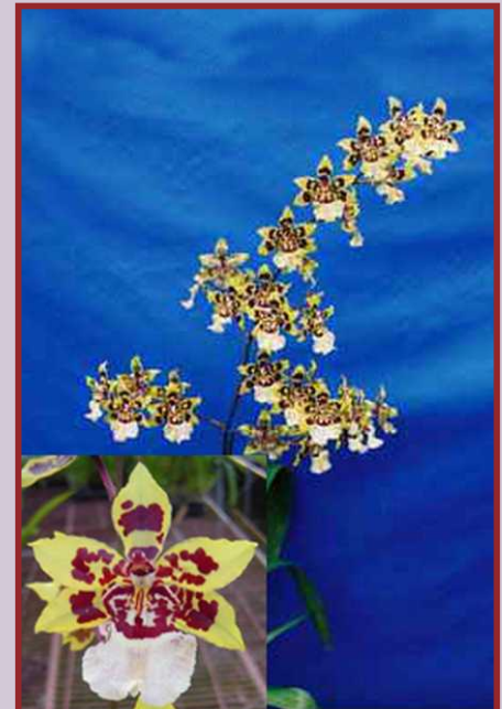
AJG/OD-010 Odcdm. Wildcat 'Yellow Butterfly' S.L.: 40-90cm N.S.: 4-7cm Climate: Little Cold Fragrance: No