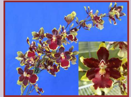
AJG/OD-008 Odcdm. Wildcat 'Cherry Tomato' S.L.: 30-60cm N.S.: 4-5cm Climate: Little Cold Fragrance: No