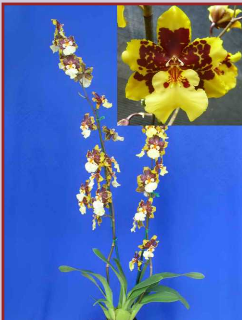
AJG/OD-005 Odcdm. Saint Anthony of Egypt S.L.: 30-40cm N.S.: 4-8cm Climate: Little Cold Fragrance: Yes