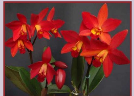
AJC-0093 'Red Charm' Flower Size: Small Flowering: Oct-Apr Fragrance: No