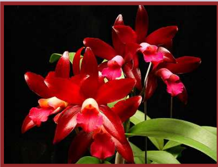
AJW-11114 Lc.Sagarik Wax 'African Beauty' Flower Size: 10cm Flowers: N/A Flowering: N/A