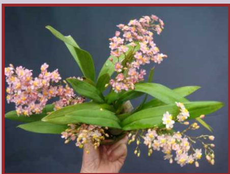
AJC-N021 Onc.Tsiku Marguerit 'Dragon' Flower Size: Small Flowering: Nov-Feb Fragrance: Yes