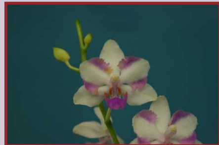
AJY-11096 Doritis pulcherrima X Luedde-violacea