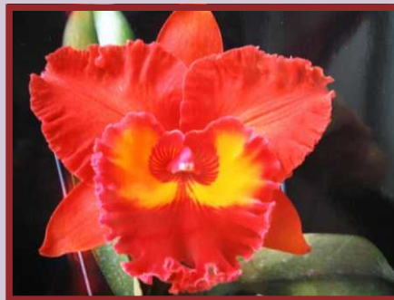
AJW-11077 Pot. Emperor 'Sunset' Flower Size: 16cm Flowers: 1-2 Flowering: 2/yr