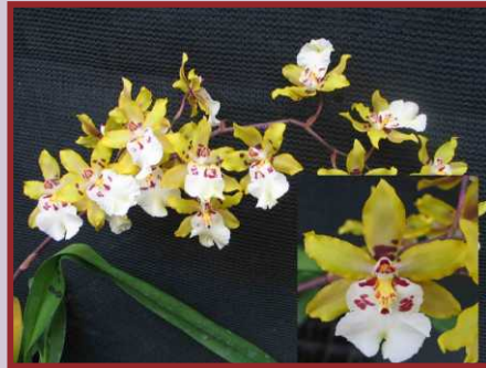
AJG/OD-007 Odcdm. Wildcat 'Golden Fairy' S.L.: 60-80cm N.S.: 7-8cm Climate: Little Cold Fragrance: Little