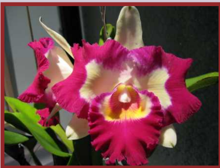
AJW-11066 Blc. Happy Flower Size: 16cm Flowers: 1-2 Flowering: 2-3/yr