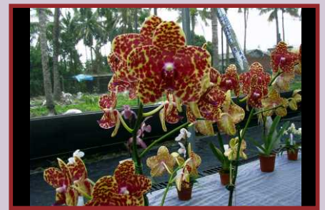
AJY-11101 P. Dou-dii Rose