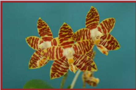
AJY-11067 P. amboinensis var. yellow