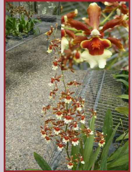
AJG/CD-001 Oncda. Kilauea 'Volcano Queen' HCC/AOS S.L.: N/A N.S.: N/A Climate: Little Cold Fragrance: No