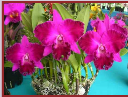
AJW-11085 Lc. Chiou-Jye Chen Flower Size: 15cm Flowers: N/A Flowering: N/A