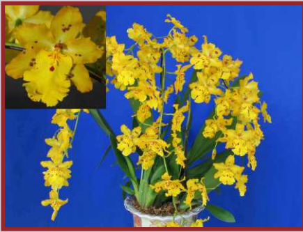
AJG/OD-003 Odcdm. Mayfair 'RCW' FCC/AOS S.L.: 40-100cm N.S.: 6-9cm Climate: Cold Fragrance: Little