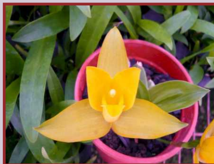
AJG/LY-004 Lyc. Concentration S.L.: N/A N.S.: N/A Climate: Little Cold Fragrance: Yes