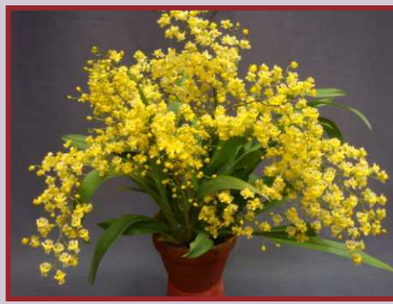
AJC-N016 Onc.Chiou-Pin 'Yangtze' Flower Size: Small Flowering: Nov-Feb Fragrance: Yes