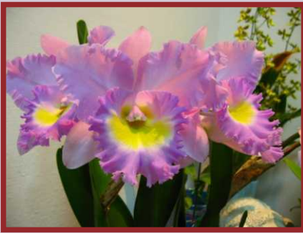
AJW-11026 Rsc. Mormilani Jewel 'Chunfong' AM/AOS Flower Size: 15cm Flowers: 2-3 Flowering: 1/yr