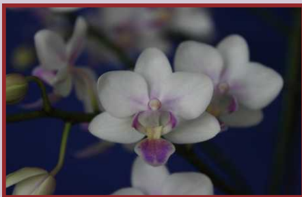
AJY-12235 P. Liu's Twilight Rainbow