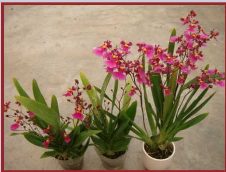
AJC-N013 Onc.Kutoo 'Little Cherry' Flower Size: Small Flowering: Irregular Fragrance: Little