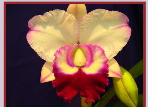
AJW-11037 Rsc. Journey 'First Choice' Flower Size: 12cm Flowers: 2-3 Flowering: 3/yr