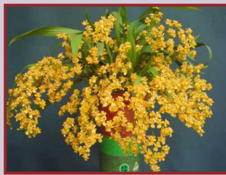
AJC-N022 Onc.Twinkle 'Golden No.2' Flower Size: Small Flowering: Nov-Feb Fragrance: Yes