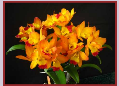
AJW-11039 Pot. Autumn Leaves Flower Size: 8cm Flowers: 4 Flowering: 1/yr