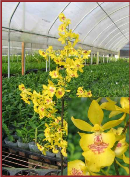
AJG/BT-004 Btcm. Hwuluduen Chameleon 'Golden Oriole' S.L.: 50-60cm N.S.: 4-5cm Climate: Warm Fragrance: No