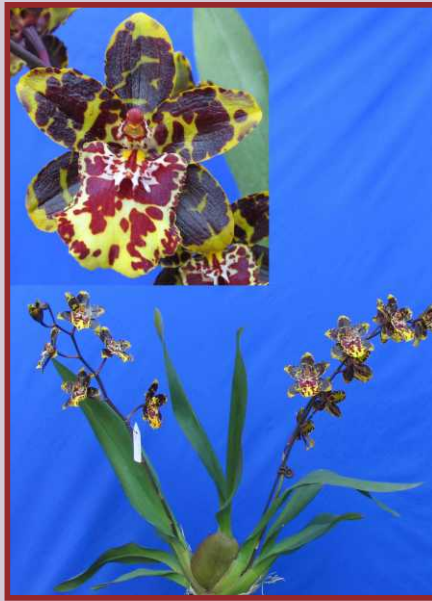
AJG/OD-002 Odcdm. Puma 'Black Diamond' S.L.: 50-60cm N.S.: 5-6cm Climate: Warm Fragrance: Yes