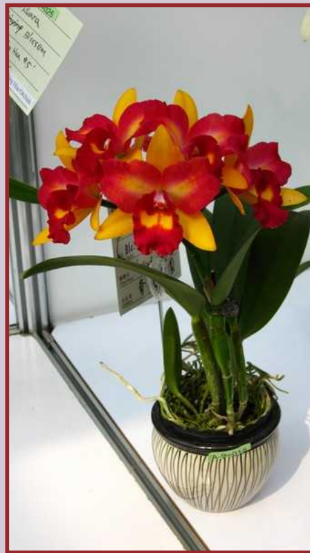
AJW-11016 Pot. Flora 'Spring' Flower Size: 9cm Flowers: 4-7 Flowering: 2/yr