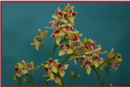
AJY-11115 Dtps. Sogo Gotris