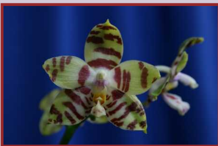
AJY-11068 P. amboinensis