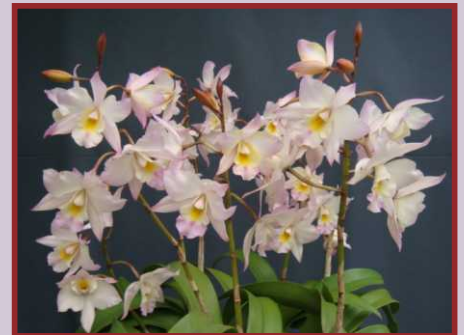
AJC-IW01 Iwanagara.Apple Blossom 'Pink' Flower Size: Medium Flowering: Mar-May Fragrance: No