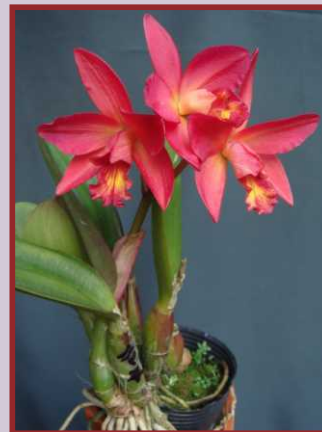
AJC-0095 'Mars' Flower Size: Small Flowering: Jan-Apr Fragrance: No