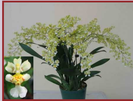
AJG/NC-005 Onc. Misaki Twinkle Obry 'Only you' S.L.: 10-20cm N.S.: 1-2cm Climate: Little Cold Fragrance: Yes