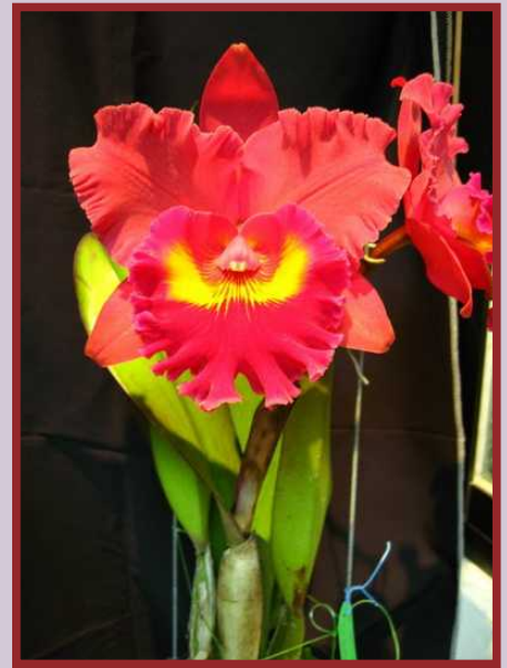
AJW-11014 Pot. Emperor 'Carmen' Flower Size: 16cm Flowers: 2-3 Flowering: 2/yr