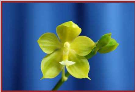
AJY-12133 P. Ho's Dreamy Jade var. Green