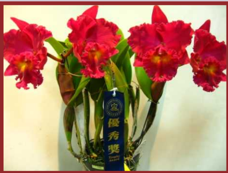
AJW-11029 Rsc. Armani 'Red Dragon' SM/TOGA Flower Size: 16cm Flowers: 2 Flowering: N/A