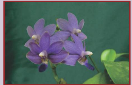
AJY-11094 Dtps. Purple Martin "Tzuchiang"