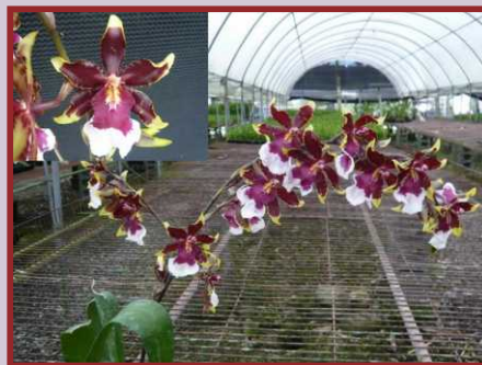
AJG/OD-011 Odcdm. Wildcat 'Pink Lady' S.L.: N/A N.S.: 5-6cm Climate: Little Cold Fragrance: No