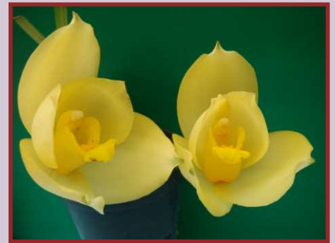
AJC-A002 Angulocaste Olympus 'Sun Dawn' AM/AOS Flower Size: Large Flowering: Nov-Mar Fragrance: No