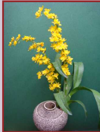
AJC-HW02 Howeara.Lovely 'Moon Beauty' Flower Size: Small Flowering: Jan-Apr Fragrance: Little