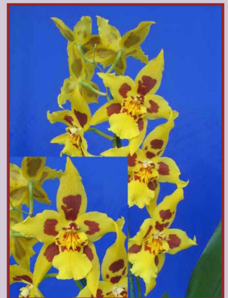
AJG/HM-001 Hmtn. Golden Harry 'Kamuella' S.L.: 50-70cm N.S.: 7-9cm Climate: Cold Fragrance: No