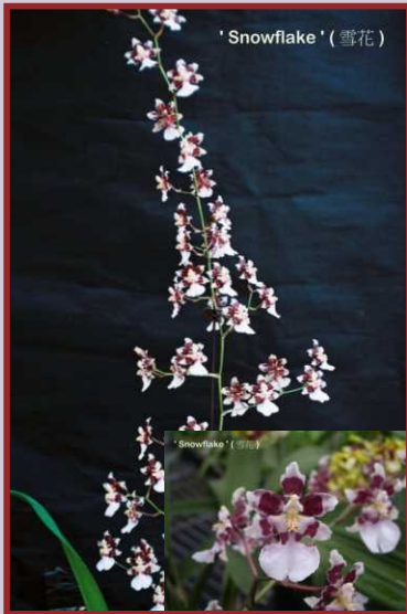
AJU-001 Onc. Sky ' Snowflake '