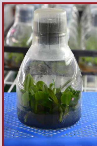
Mother flask 3-4 months to middle flask