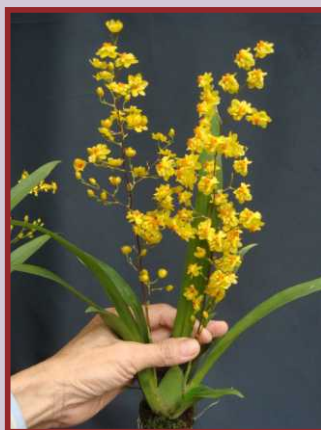
AJC-N017 Onc.Twinkle 'Golden' Flower Size: Small Flowering: Nov-Feb Fragrance: Yes