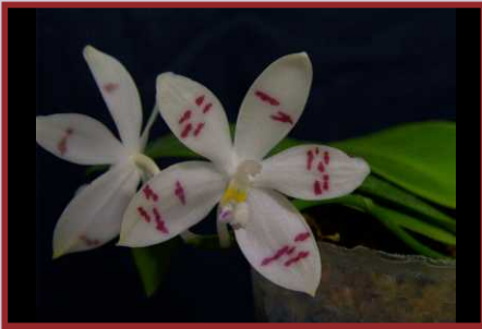
AJY-11181 P. tetraspis var. Stripes