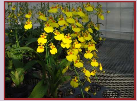
AJC-N009 Onc. 'Free Star' Flower Size: Large Flowering: Autumn-Spring Fragrance: No