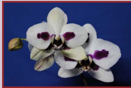
AJY-11016 P. Ever Spring Light