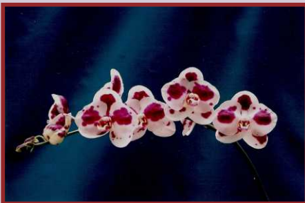
AJY-11121 P. Golden Peoker X P. Taisuco Kaala