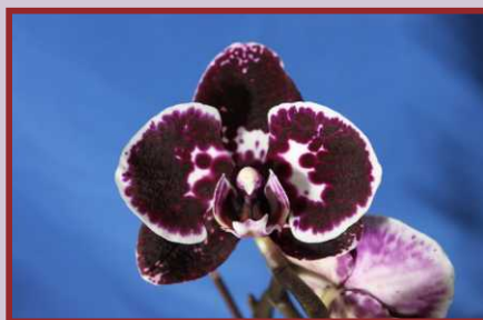
AJY-11927 Dtps. I-Hsin Black Jack