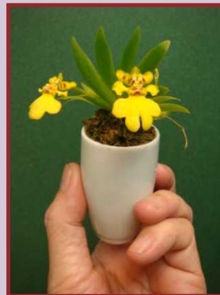
AJC-N014 Onc.pusillum Flower Size: Small Flowering: Irregular Fragrance: No