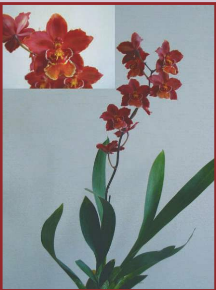
AJG/WI-003 Wils. Dianne Feinstein 'Red Ruby' S.L.: N/A N.S.: N/A Climate: Little Cold Fragrance: No