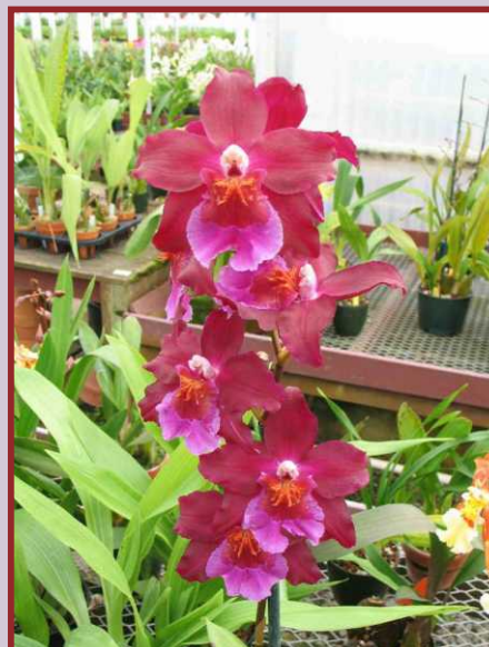
AJG/VL-001 Vuyl. Jerry Lawless 'Black Peony' S.L.: 60-70cm N.S.: 6-7cm Climate: N/A Fragrance: No