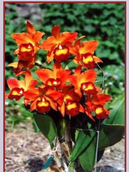
AJW-11012 Pot. Sweet Orange Flower Size: 12cm Flowers: 2-5 Flowering: 2/yr