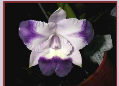
AJW-11073 Lc. Cariad's Mini Quinee "Angle Kiss" Flower Size: 10cm Flowers: 1-2 Flowering: 2/yr