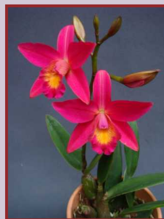
AJC-0104 Lc.Guiding 'Chiou Hsian' Flower Size: Small Flowering: Feb-June Fragrance: No