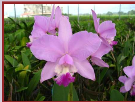
AJW-11062 Pot. Morning Love "Nice Day" Flower Size: 15cm Flowers: 2-3 Flowering: 1/yr