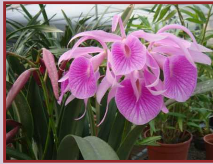
AJC-0099 Bl. Morning Glory 'Valentine Kiss' Flower Size: Medium Flowering: Nov-Feb Fragrance: Little