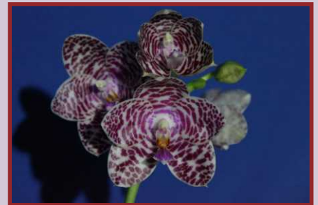
AJY-11076 P. Sogo Lobby "#2"