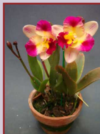
AJC-HK01 Hknsa. Chien Ya Ocean Flower Size: Small Flowering: Mar-May Fragrance: No