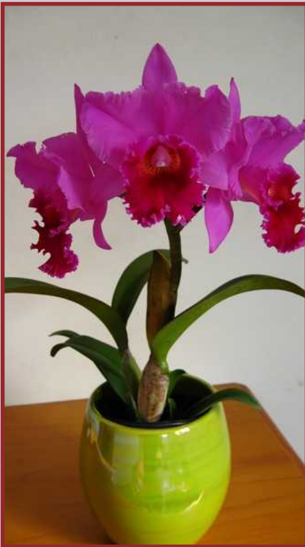
AJW-11018 Blc. Sailing 'Purple' Flower Size: 12cm Flowers: 2-3 Flowering: 1/yr