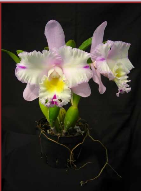
AJW-11040 Rlc. Choo Han Teck 'January Light' Flower Size: 16cm Flowers: 2 Flowering: 1-2/yr