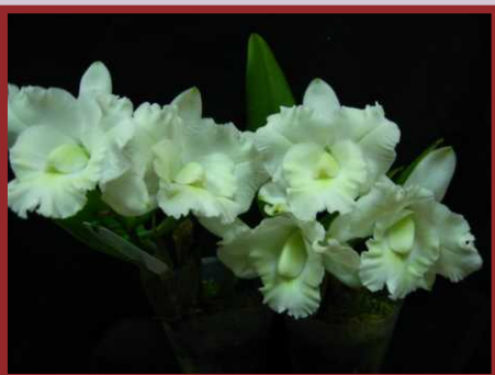
AJW-11034 Lc. White 'May Breeze' Flower Size: 10cm Flowers: 2-3 Flowering: Monthly