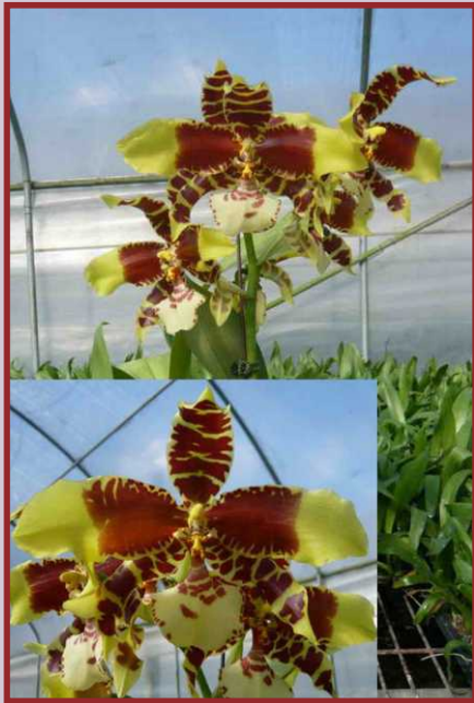
AJG/RS-001 Rssgls. Rawdon Jester 'Great Bee' S.L.: 60-70cm N.S.: 16-18cm Climate: Cold Fragrance: No