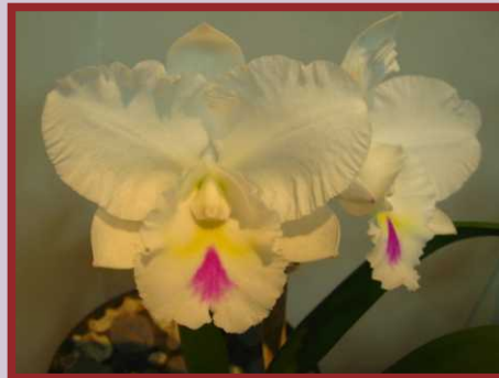
AJW-11031 Bc. Mr. Chang 'Coach' Flower Size: 10cm Flowers: 2-3 Flowering: 2/yr