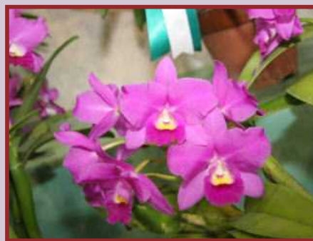
AJC-0108 C. Crown Royal 'Miyabi' Flower Size: Medium Flowering: Aug-Oct Fragrance: No