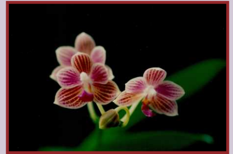
AJY-12143 P. Christine Magro var. stripes