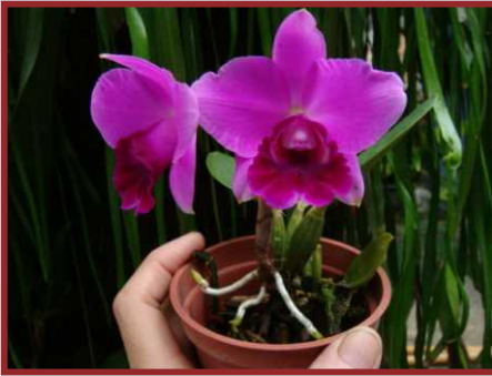
AJC-0098 Lc. Mini Purple 'Cluster' Flower Size: Small Flowering: Sep-Dec Fragrance: No