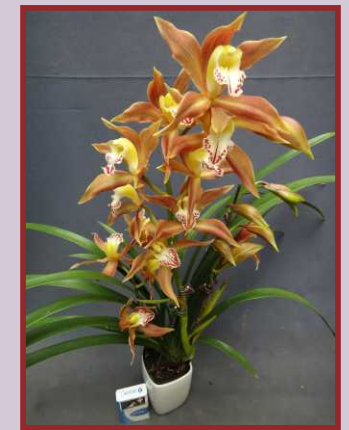
AJC-Y001 Cym.Aeka 'Year's' Flower Size: Medium Flowering: Dec-Mar Fragrance: Yes