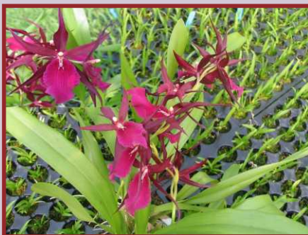
AJG/MTS-001 Mtssa. Royal Robe 'Jerry's Pick' S.L.: 20-40cm N.S.: 7-9cm Climate: Warm Fragrance: No