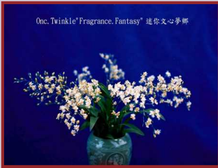
AJG/NC-006 Onc. Twinkle 'Fragrance Fantasy' 送你文心夢鄉 S.L.: 10-20cm N.S.: 1-2cm Climate: Warm Fragrance: Yes