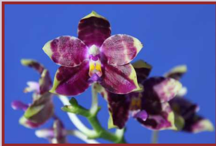
AJY-11121 P. Coral Isles X P. amboinensis