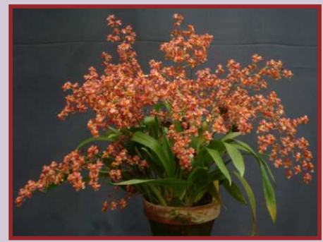
AJC-N020 Onc.Twinkle 'Red Girl' Flower Size: Small Flowering: Nov-Feb Fragrance: Yes