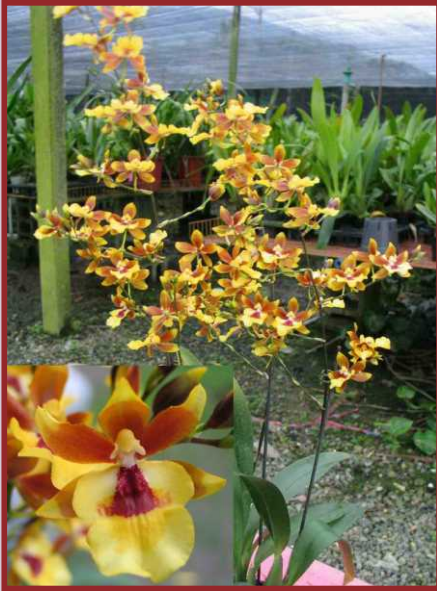
AJG/BT-001 Btcm. Hwuluduen Chameleon 'Colorful Lake' S.L.: 50-60cm N.S.: 4-5cm Climate: Warm Fragrance: Yes