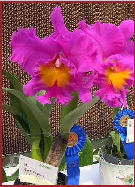
AJW-11065 Blc. Pink Empress Flower Size: 18-20cm Flowers: 1-2 Flowering: 1/yr