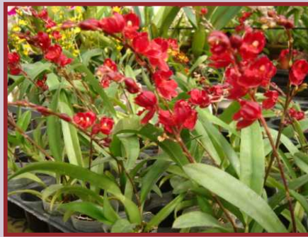
AJC-H003 Howeara.Lava Burst 'Red Bug' Flower Size: Small Flowering: Irregular Fragrance: No