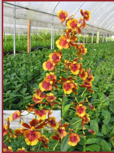
AJG/BT-002 Btcm. Hwuluduen Chameleon 'Red' S.L.: 50-60cm N.S.: 4-5cm Climate: Warm Fragrance: Yes