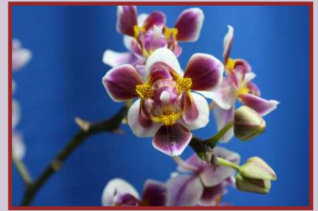
AJY-11114 P. Be Tris