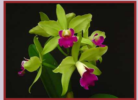
AJW-11115 Lc. Star Garden Flower Size: 12cm Flowers: N/A Flowering: N/A