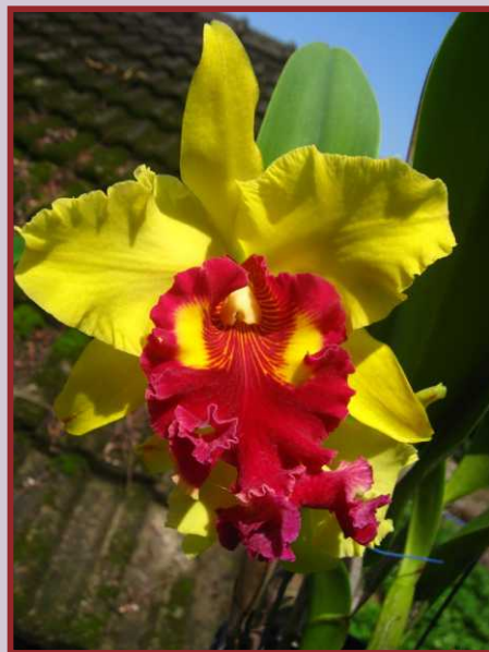
AJW-11111 Pot. Chief Delight 'Golden Lucky' Flower Size: 15cm Flowers: 1-2 Flowering: N/A