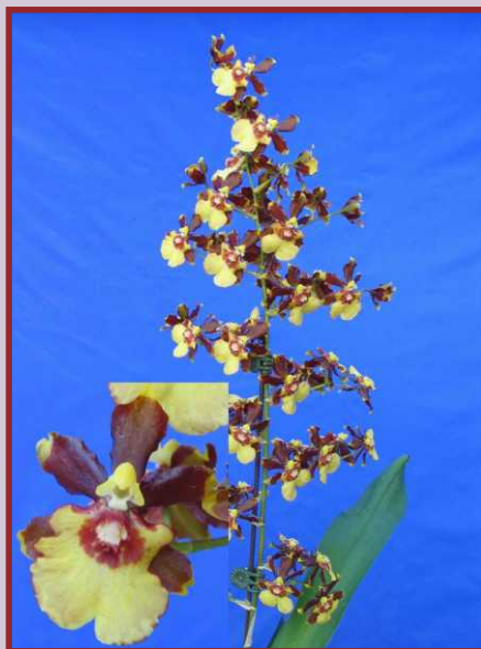
AJG/NC-003 Onc. Honey 'Sweet Lady' S.L.: 50-60cm N.S.: 2-3cm Climate: Hot Fragrance: Fragrant