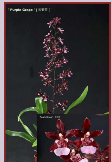
AJU-010 Wils. Isler ' Purple Grape '