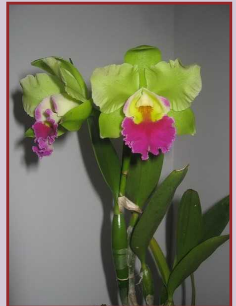
AJW-11041 Pry. Green Jewel 'Green Light' Flower Size: 12cm Flowers: 3 Flowering: 1/yr