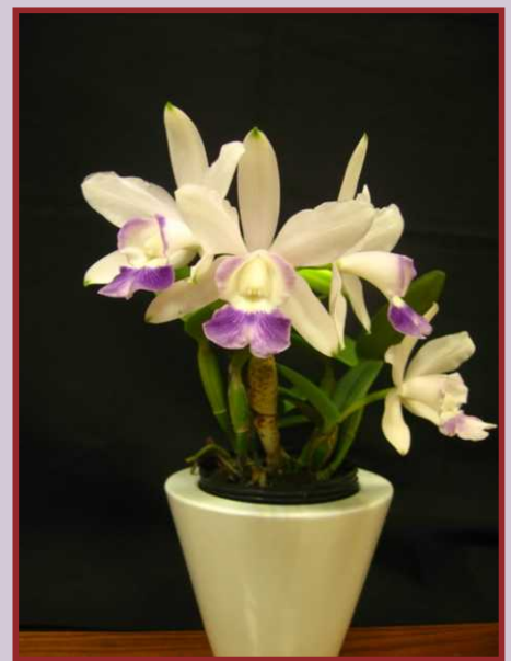
AJW-11053 Lc. Aloha Case X C. intermedia 'Blue White' Flower Size: 10cm Flowers: 3-4 Flowering: 2/yr