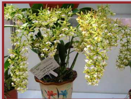
AJW-11036 Epi. Stamfordianum 'Galaxy' SM/TOGA Flower Size: 3cm Flowers: 60-70 Flowering: 1/yr