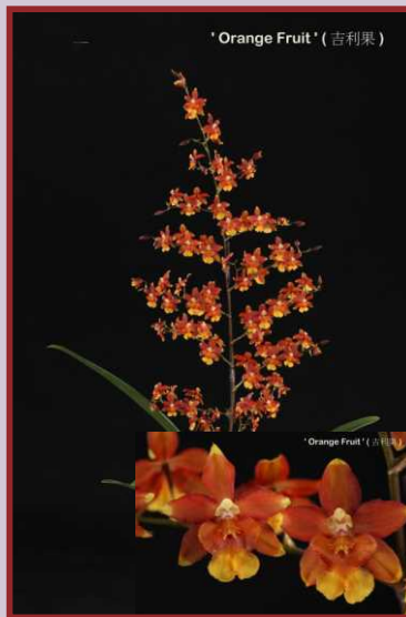
AJU-002 Wils. Pixie ' Orange Fruit '