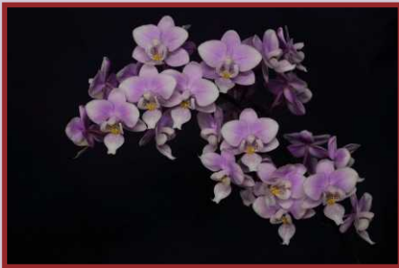
AJY-12236 P. Pink Girl