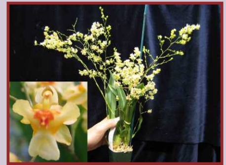
AJG/NC-001 Onc. Gold Dust 'Starlight' S.L.: 10-20cm N.S.: 1-2cm Climate: Warm Fragrance: Yes