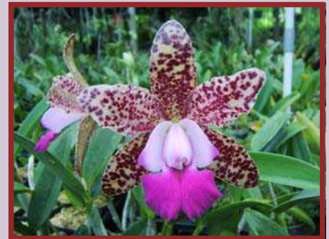
AJW-11157 C. Green Emerald Flower Size: 6cm Flowers: 5-7 Flowering: Irregular