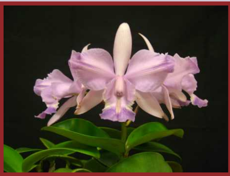
AJW-11051 C. Brazilian Star 'Soft Rock' Flower Size: 12cm Flowers: 3-4 Flowering: 2/yr