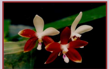
AJY-11173 P. speciosa var. red