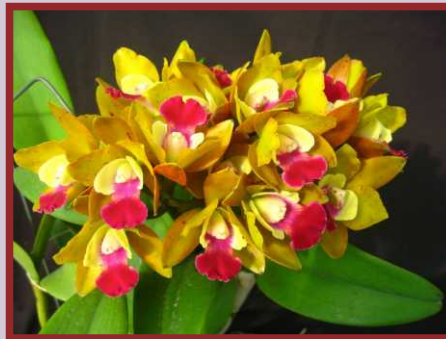
AJW-11054 Lc. Varut Startrack 'Golden Prince' Flower Size: 6cm Flowers: Cluster Flowering: 2/yr