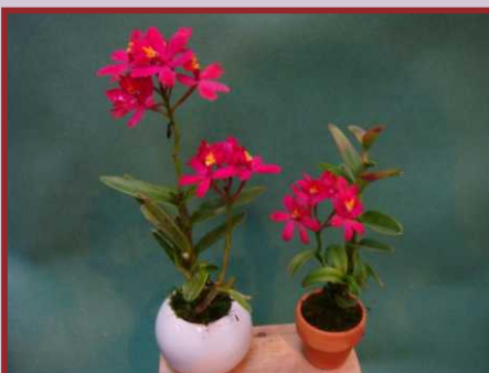
AJC-E004 Epi. Crystal Valley 'Red Star' Flower Size: Medium Flowering: Jan-May Fragrance: No