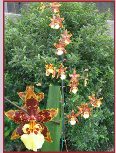
AJG/OD-004 Odcdm. Saint Anthony of Egypt 'Fragrant Beauty' S.L.: 60-100cm N.S.: 6-8cm Climate: Little Cold Fragrance: Yes