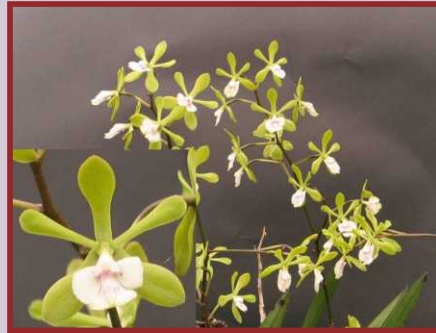
AJG/EPI-001 Epi. floribundum S.L.: 40-50cm N.S.: 4-5cm Climate: Warm Fragrance: Yes