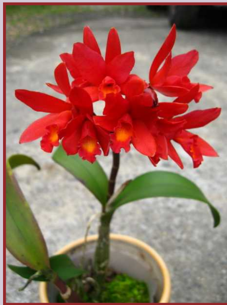
AJW-11013 Lc. Rojo X Slc. Precious Stone Flower Size: 4cm Flowers: 8 Flowering: 1/yr