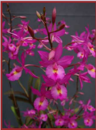
AJC-B001 Bard.Cyclotella-Jerusan 'Red Bird' Flower Size: Medium Flowering: Dec-Mar Fragrance: No