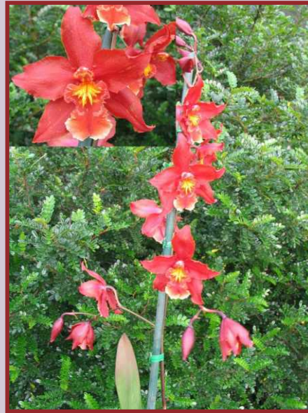
AJG/WI-001 Wils. Sheila Anne S.L.: N/A N.S.: N/A Climate: Cold Fragrance: No