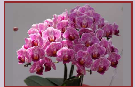
AJY-12134 Dtps.Sogo Vivien