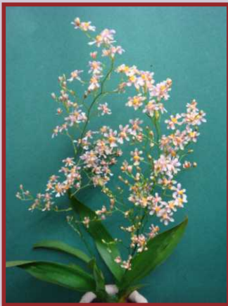
AJC-N012 Onc.Sepia Color 'Pure' Flower Size: Large Flowering: Jan-Apr Fragrance: Little