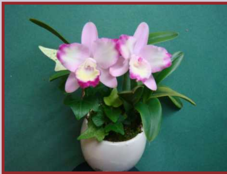
AJC-0136 Sc.Cherry Bee 'Happy Field' Flower Size: Small Flowering: Irregular Fragrance: No