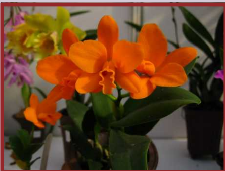
AJW-11047 Pot. Shinfong Little Sun 'Young-Min Golden Boy' AM/AOS Flower Size: 15cm Flowers: 3-4 Flowering: 1/yr