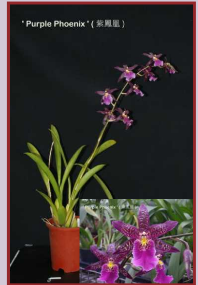
AJU-003 Gdlra. Aztec ' Purple Phoenix '