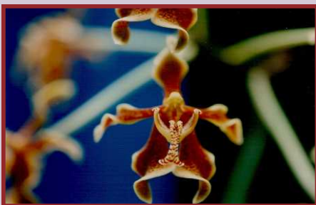
AJY-11118 Para. labukensis var. brown