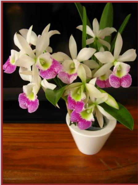
AJW-11035 Blc. Hawaii Stars 'Only One' Flower Size: 15cm Flowers: 4-5 Flowering: 1-2/yr