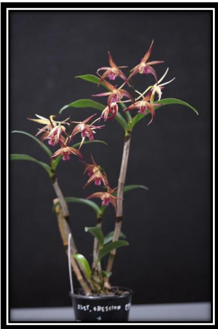
Dendrobium Australian Obsession Grown by F. Verlaan