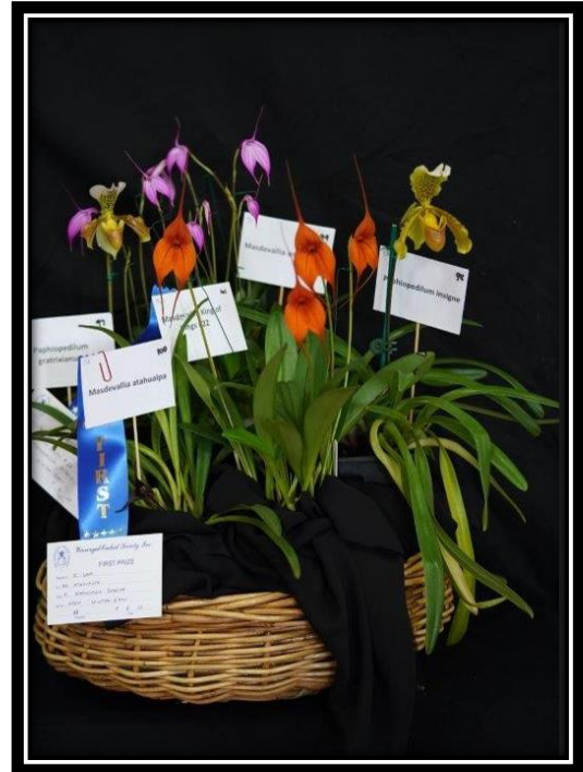
Displayed & grown by K. Lam