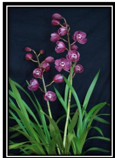
Cym. Alexandra's Flame x Flaming Vulcan Grown by K. Sloane