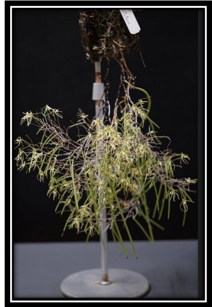
Dendrobium teretifolium Grown by L & A Shepherd