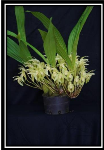
Sudamerlycaste fimbriata Grown by M. Coker