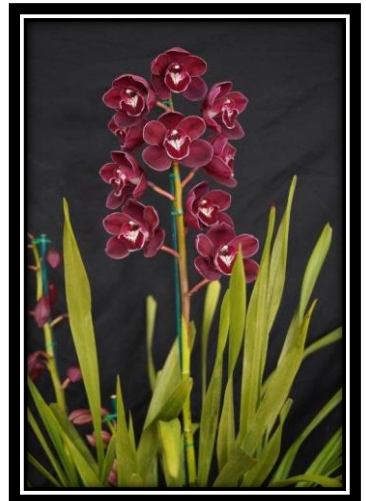
Cym. Pepper Blaze x Regal Flame Grown by D. Wain