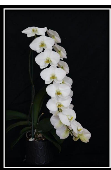
Phal. White Wonder 'Biba' Grown by J. Givano