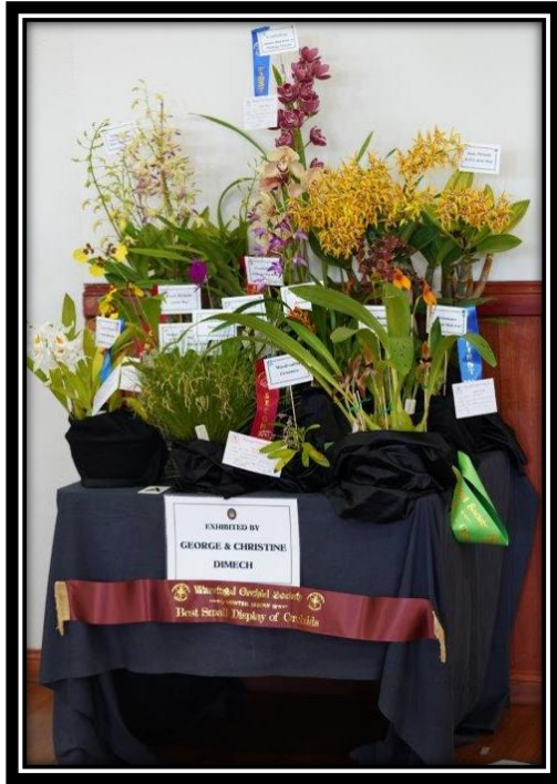
Displayed & grown by G. & C Dimech