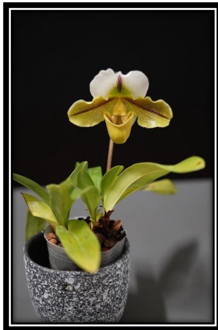
Paphiopedilum Unknown Grown by K. Ridgway