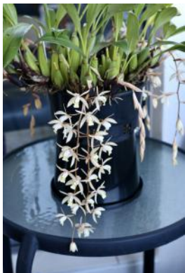
Coelogyne flaccida – Moira

Dendrobium prenticei = Dendrobium lichenastrum