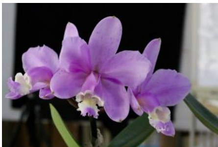
C. loddigessii.