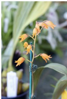
Den. mohlianum - Rod