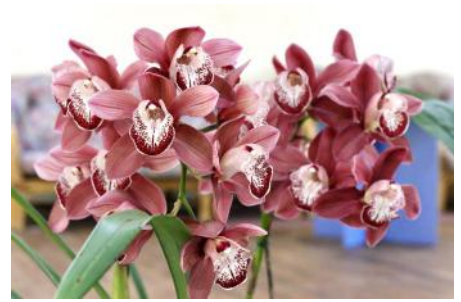
Cym. Khan Flame Roger