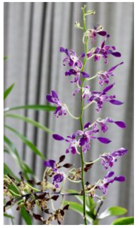
Den. AR Blue Twister. June