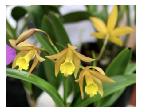
Rth. Twentyfour Carat. Roger