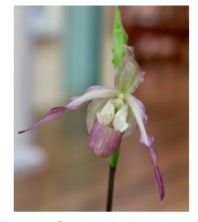
Phrag. Sedenii. Heather