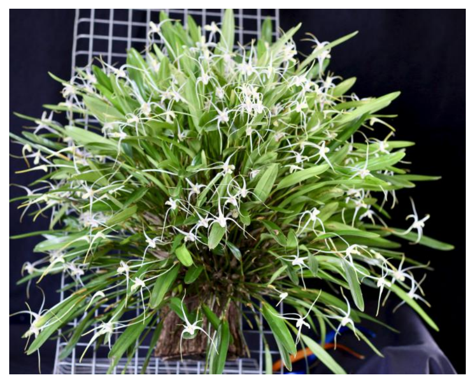
Judges choice - January - Dendrobium aratriferum J.J. Sm.

We have owned this plant for more than 10 yrs and it has relocated well in SE Queensland during this time! It grows well quickly forming a compact specimen plant.