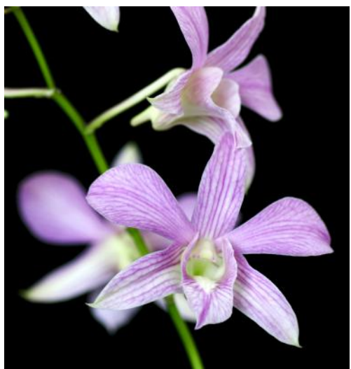
Judges Choice - Novice - January Dendrobium Unknown Grower-John