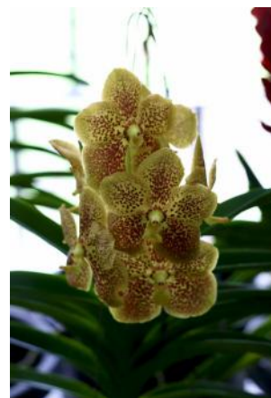
V. Suksamran Spots - Luda