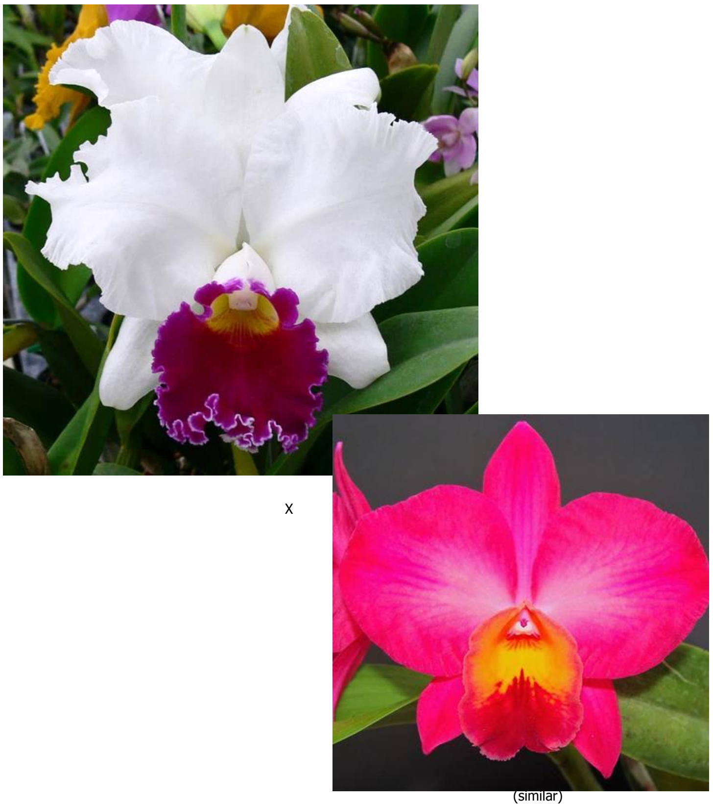
Lc. Melody Fair 'Carol' x Slc. Circle of Life 'New Ace' AM/AOS hybrid

This is a cross between the above shown orchid plants. It was purchased from H & R Nurseries as a plug in August of 2016 in a compot and has been growing outdoors happily during summer and winter under shade cloth.