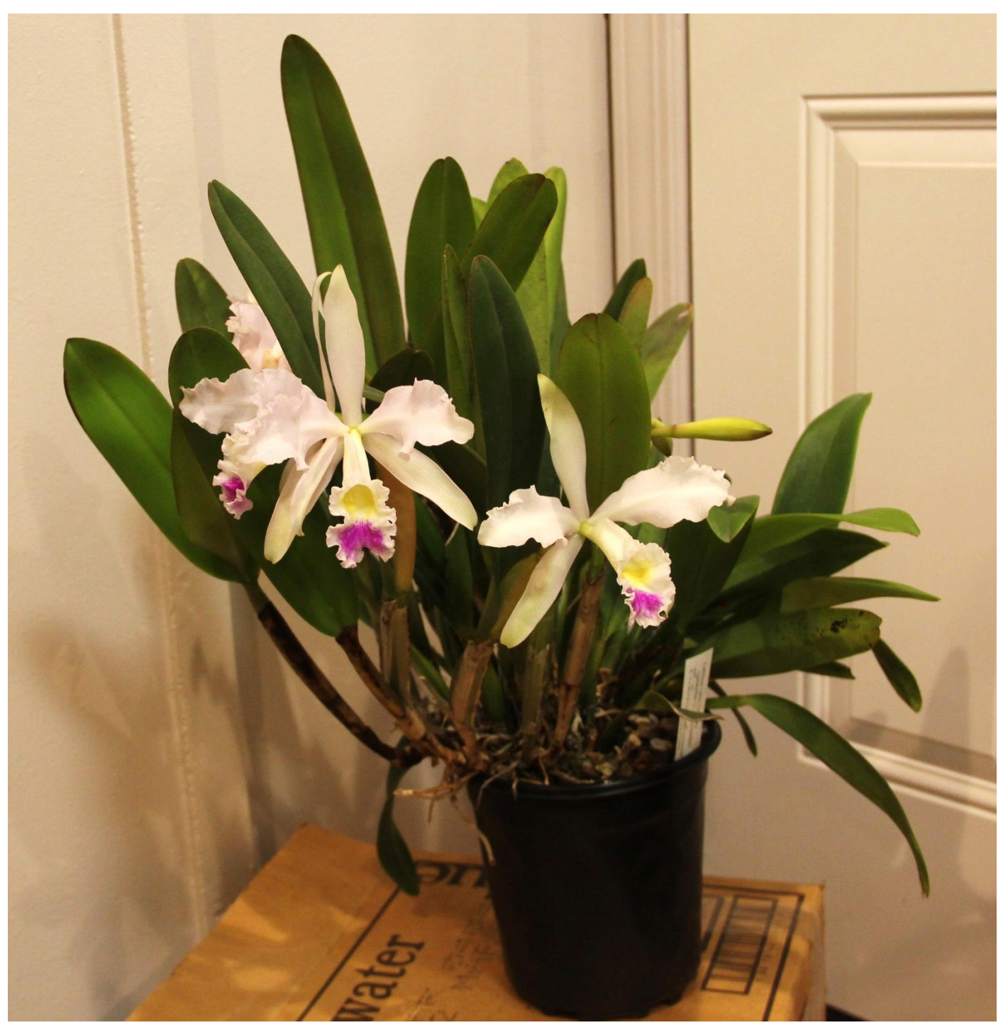
Cattleya Lady Crossley (C. gaskelliana x C. intermedia) primary hybrid

This plant was obtained from Santa Barbara Orchid Estate in November of 2014 and this is its first blooming. It is approximately 14" tall and is grown outdoors year-round under 55% shade cloth. It is an easy grower.