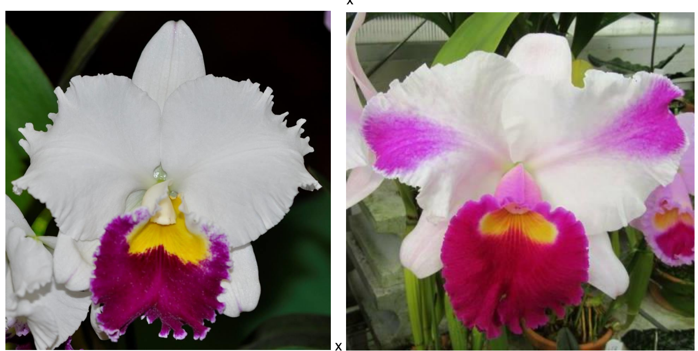
C. Motte Spot 'Paradise' x Rlc. Hilo Grand 'Yuki' hybrid

This is a cross between the above shown orchid plants. It was purchased from The OrchidWorks as a plug last year and has been growing outdoors happily during summer and winter under shade cloth.