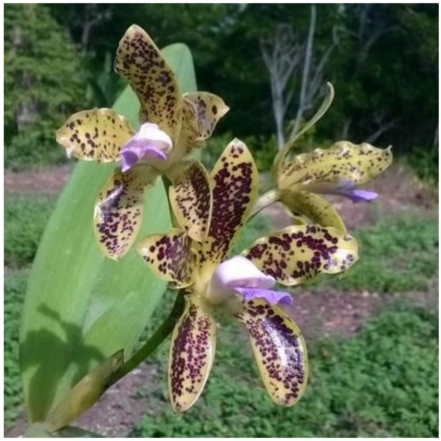
C. guttata var. coerulea ('Keiko' x 'Sergio') species plant

This is a medium sized, cool to warm growing epiphyte or lithophyte which prefers 50% shade and has fragrant flowers. This species needs a distinct dry winter rest which in turn will bring about blooming.