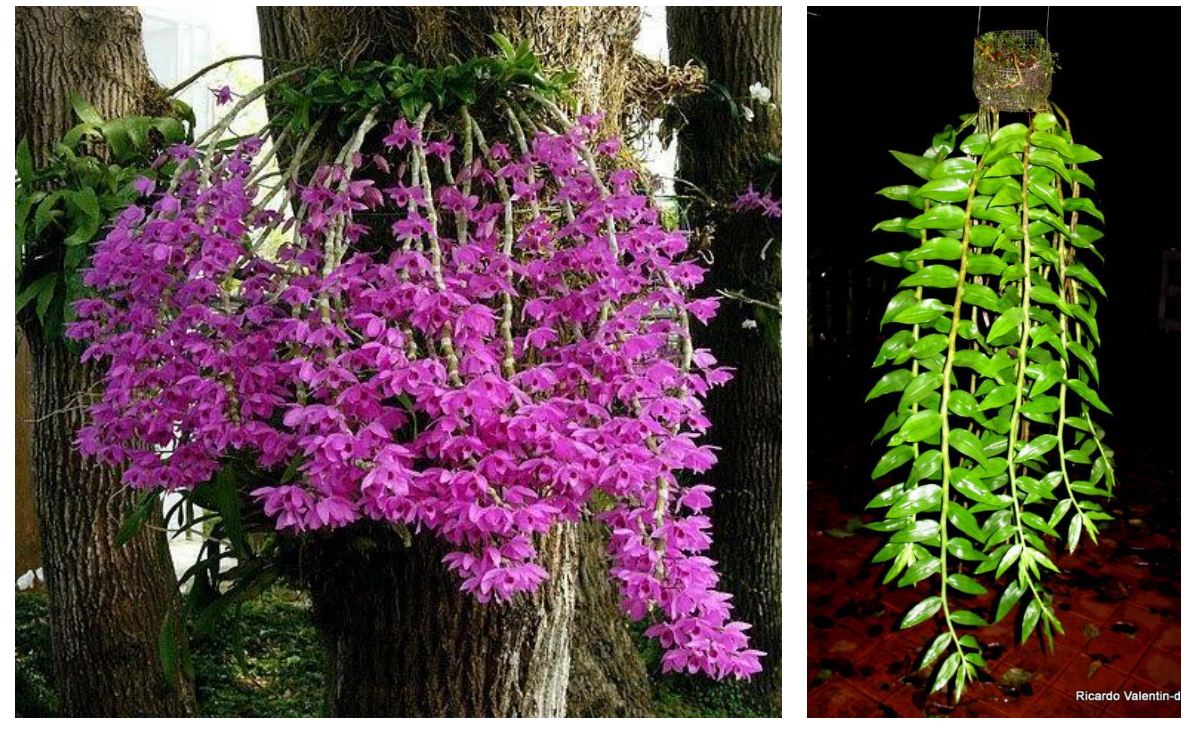
Two mounted D. anosmum shown above are for mounting reference.

This is a hot to cool growing pendulous cane orchid that likes 50% shade and is fragrant. The canes can grow to 3 or 4 feet in length and are pendant or arching. This plant requires a dry period from October until the new growths appear in early spring and then they need to be watered and fed well. The flowers appear on the previous year's leafless canes. It was obtained from The OrchidWorks this year as a plug.