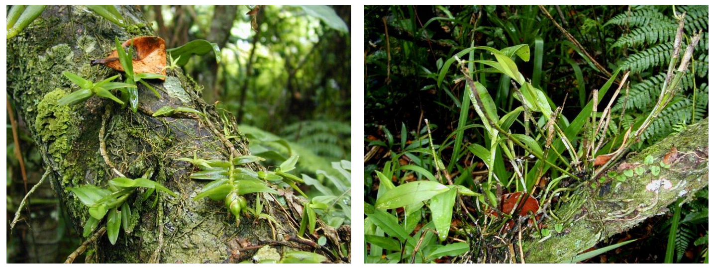
Epidendrum nocturnum species plant

This is a large sized reedstem orchid that is a hot to cool growing epiphyte. It blooms in the summer through fall and each raceme can produce flowers for more than one season, giving rise to, fragrant [often nocturnally], large, showy, successively opening flowers occurring over months on newly mature and older pseudobulbs. It prefers 75% shade.