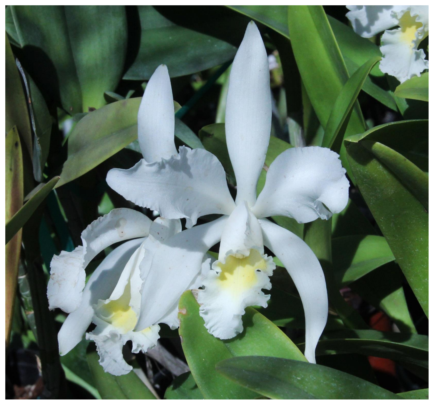
Cattleya intermedia var. alba species plant

This plant was obtained from Mariposa Garden in 2014 as a mature plant. It is approximately 16" in height and is blooming in March this year. It is grown outdoors year-round under 55% shade cloth and it is an easy grower.