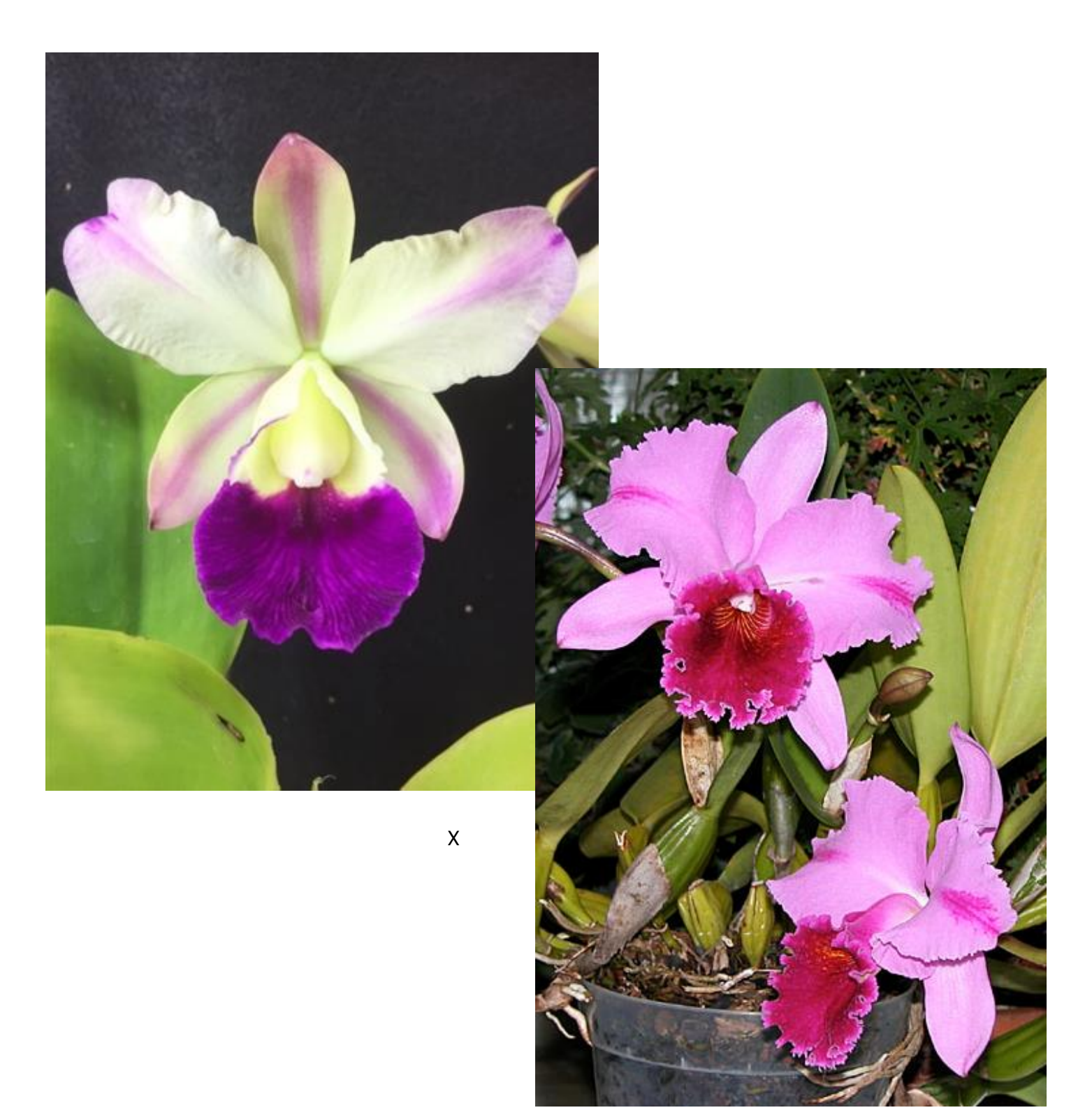
RIc. Robert's Choice x Lc. Carl Bornshine 'Mendenhall' hybrid

This is a cross between the above shown orchid plants. It was purchased from The OrchidWorks as a plug last year and has been growing happily outdoors during summer and winter under shade cloth.