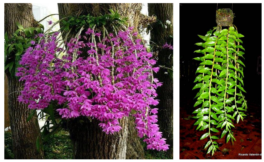
Two mounted D. anosmum shown above are for mounting reference.

This is a hot to cool growing pendulous cane orchid that likes 50% shade and is fragrant. The canes can grow to 3 or 4 feet in length and are pendant or arching. This plant requires a dry period from October until the new growths appear in early spring and then they need to be watered and fed well. The flowers appear on the previous year's leafless canes. It was obtained from The OrchidWorks this year as a plug.