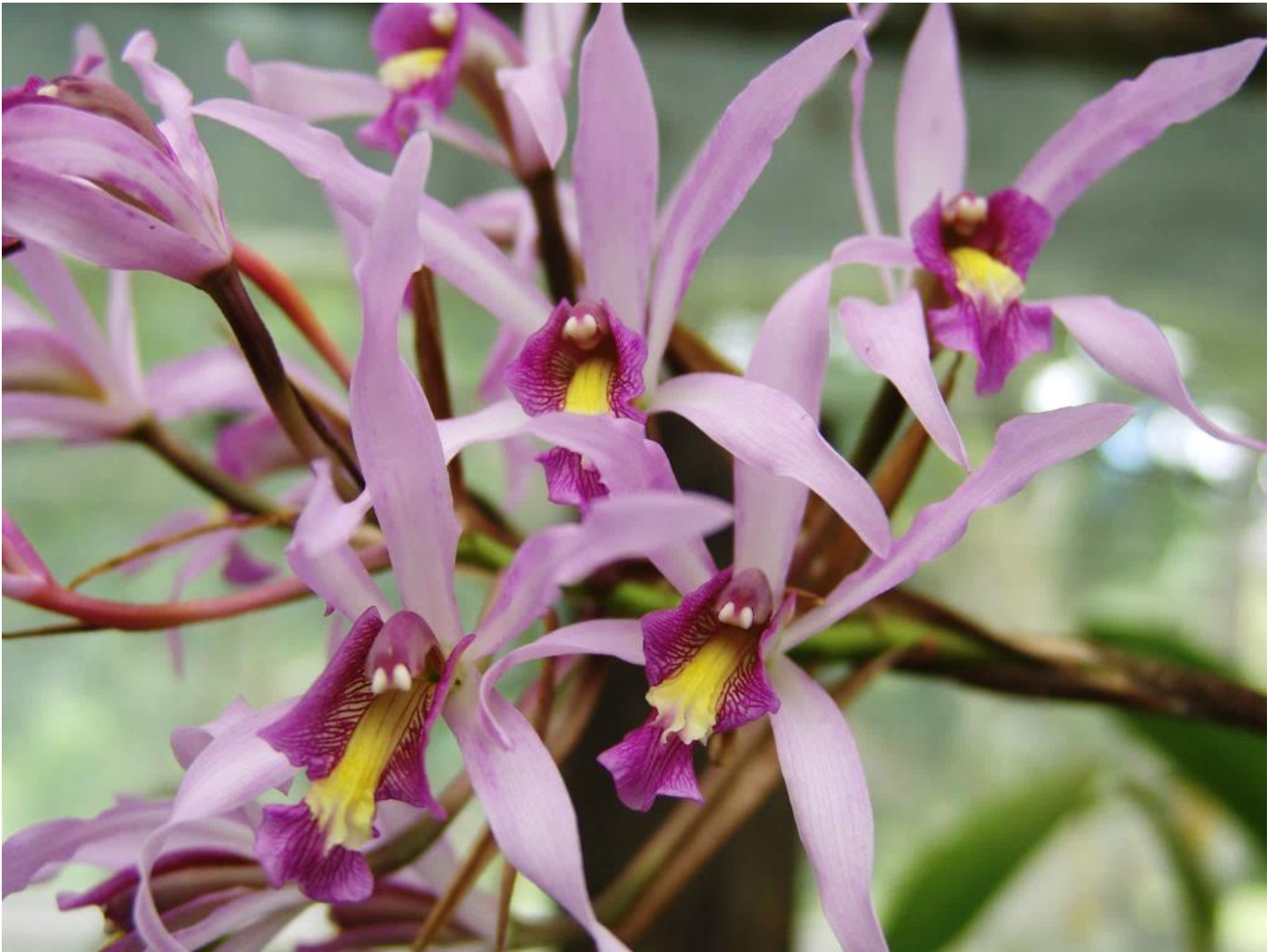
Laelia (Schomburgkia) superbiens species plant

This species is from Central America and does very well in our area under 55% shade cloth.