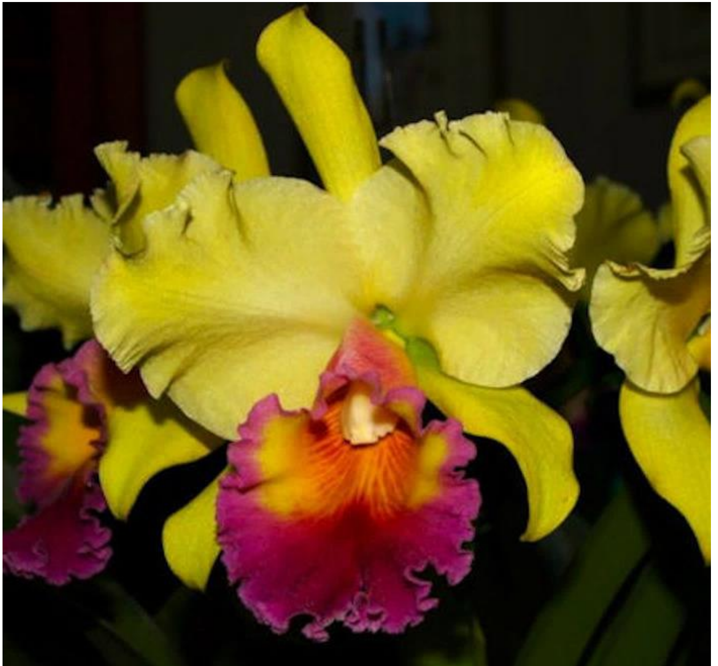
Blc. Goldenzelle 'Golden Sapphire' AM/AOS x Pot. Delta Mist 'River Queen' HCC/AOS hybrid

This plant was purchased from The OrchidWorks as a plug last year and has been growing happily during summer and winter under shade cloth.