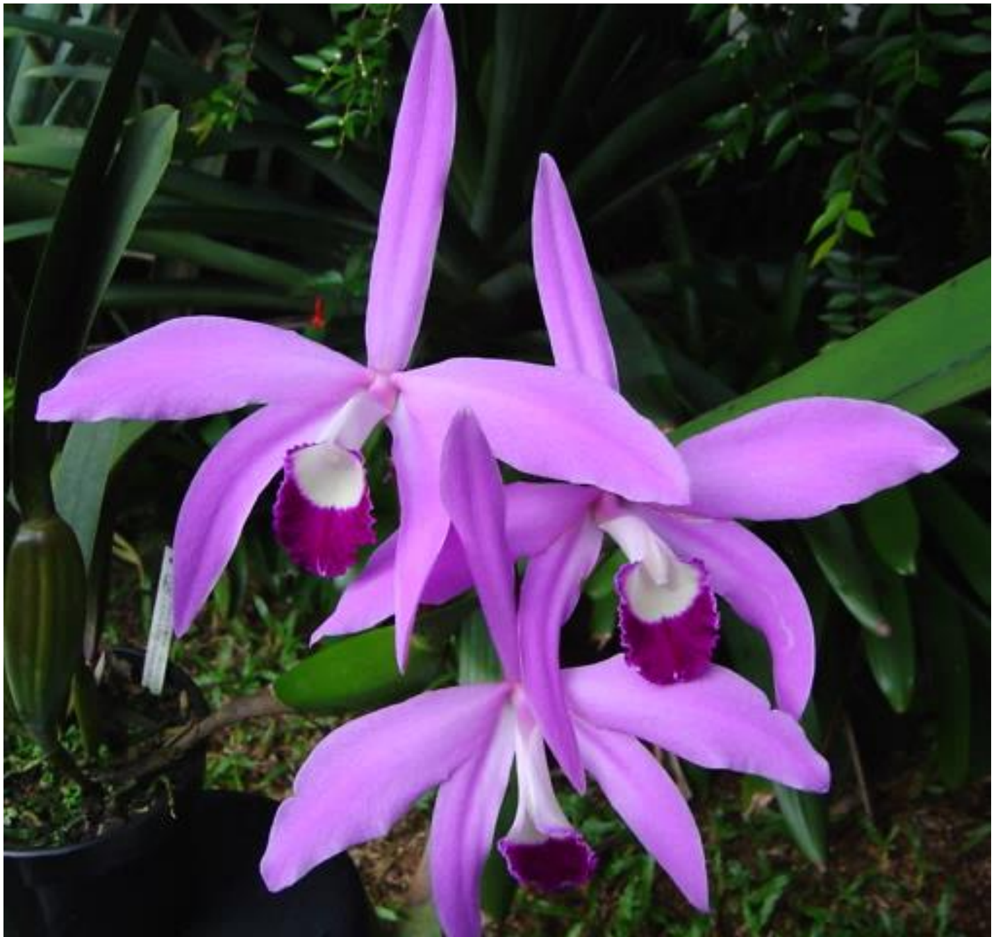
Laelia perrinii species plant

This plant is native to Brazil. It is a medium sized, warm to cool growing, epiphytic orchid that blooms in the late summer through the winter with 2 to 6, long-lasting 5 inch flowers. It likes 50% shade and grows well in our area.