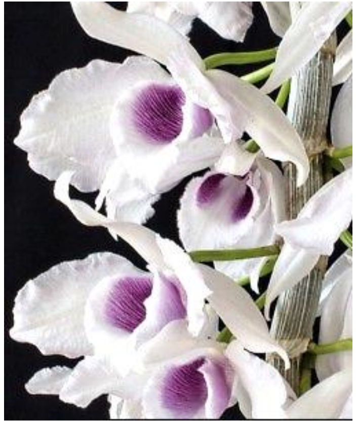
Dendrobium anosmum '4N'