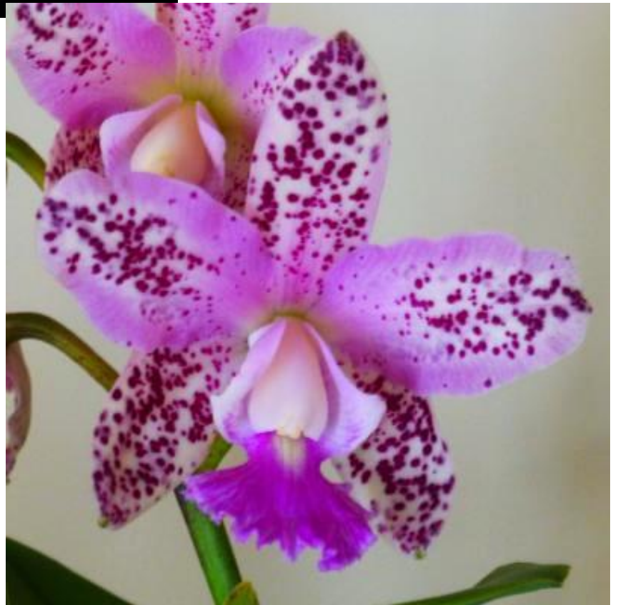
C. Summer Spot (4N) x C. Lulu (4N) hybrid

This is a cross between the above shown orchid plants. It was purchased from H & R Nurseries as a compot in July of 2015 and has been growing outdoors happily during summer and winter under shade cloth.