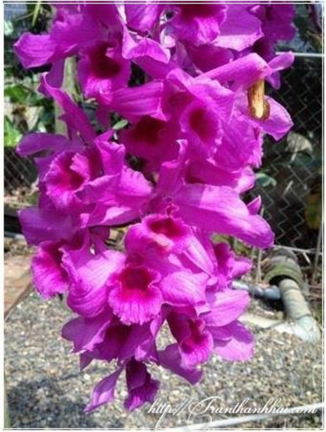
Dendrobium anosmum '4N'