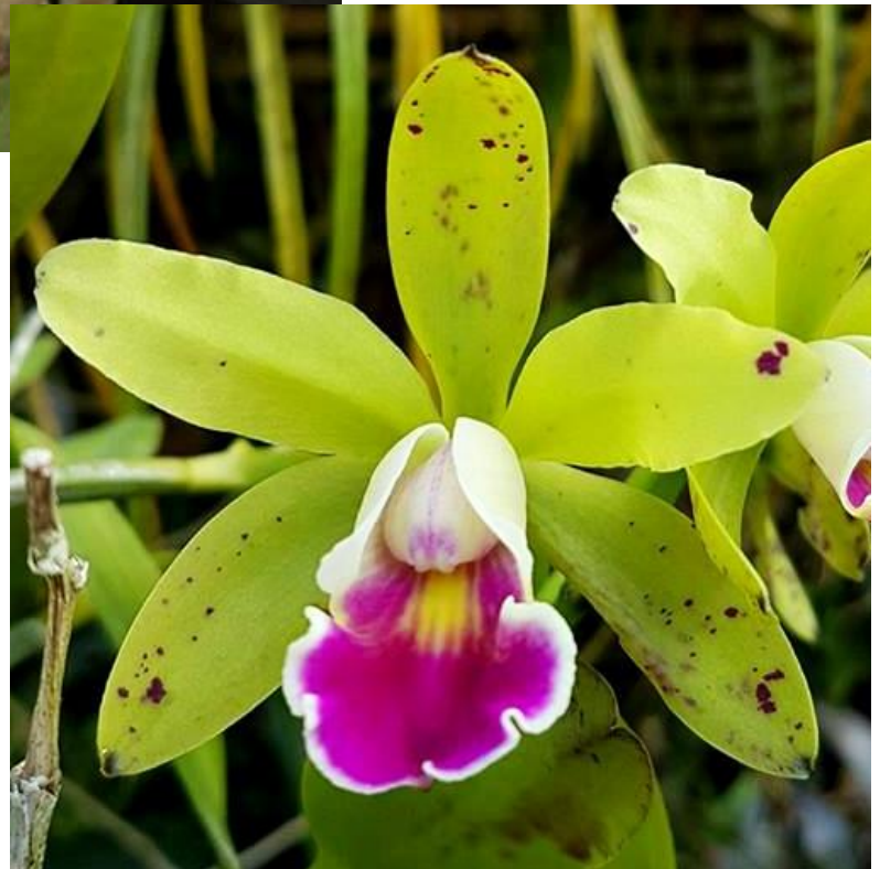
Lc. Jungle Elf (4N) x C. Small World (4N) hybrid

This is a cross between the above shown orchid plants. It was purchased from H & R Nurseries as a plug in July of 2015 in a compot and has been growing outdoors happily during summer and winter under shade cloth.