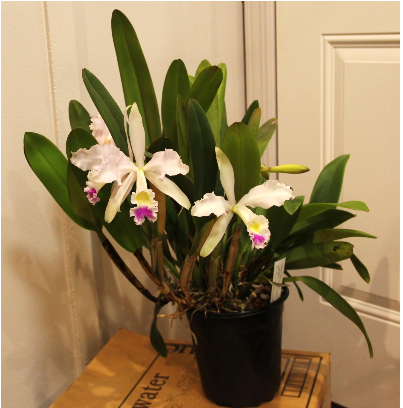
Cattleya Lady Crossley ( C. gaskelliana x C. intermedia ) primary hybrid

This plant was obtained from Santa Barbara Orchid Estate in November of 2014 and this is its first blooming. It is approximately 14" tall and is grown outdoors year-round under 55% shade cloth. It is an easy grower.