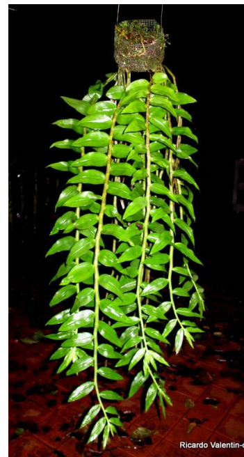
Two mounted D. anosmum shown above are for mounting reference.