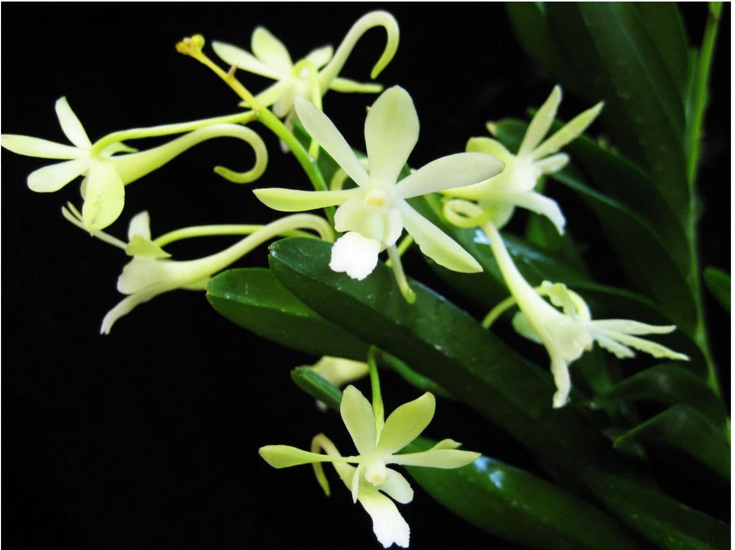
Chrisnetia Green Light (aka Vanda Green Light) parents shown below