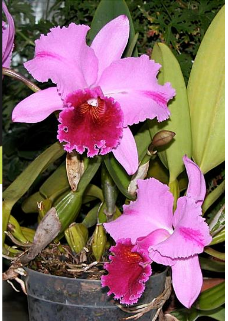
Rlc. Robert's Choice x Lc. Carl Bornshine 'Mendenhall' hybrid

This is a cross between the above shown orchid plants. It was purchased from The OrchidWorks as a plug last year and has been growing happily outdoors during summer and winter under shade cloth.