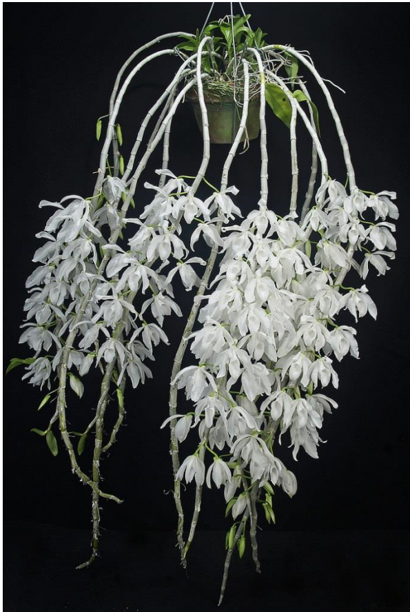
Dendrobium anosmum alba