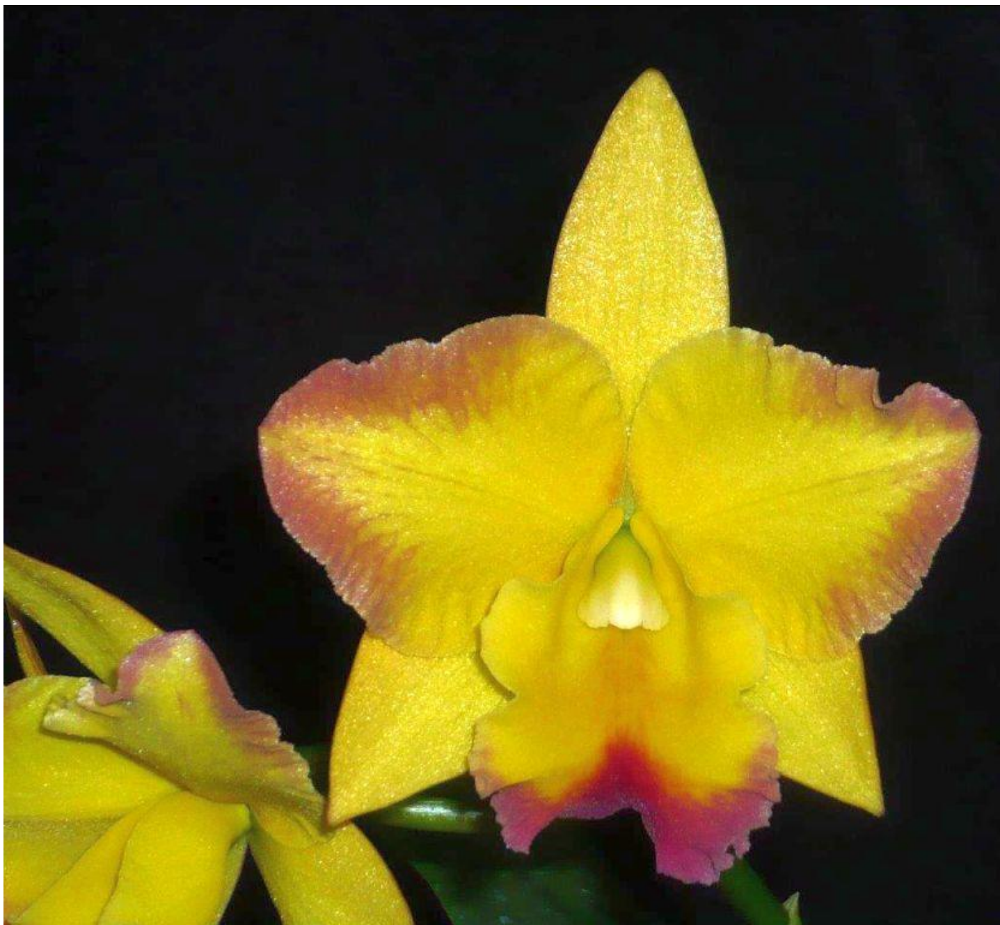
Pot. Beau's Golden Touch 'Touch of Class' (Rhyncattleanthe Maxima's Effect x Rhyncholaeliocattleya Beaugold) hybrid

This medium sized orchid has been growing outside in our area for over a year and is growing vigorously under 55% shade cloth.