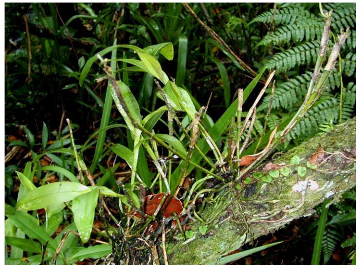
Epidendrum nocturnum species plant

This is a large sized reedstem orchid that is a hot to cool growing epiphyte. It blooms in the summer through fall and each raceme can produce flowers for more than one season, giving rise to, fragrant [often nocturnally], large, showy, successively opening flowers occurring over months on newly mature and older pseudobulbs. It prefers 75% shade.