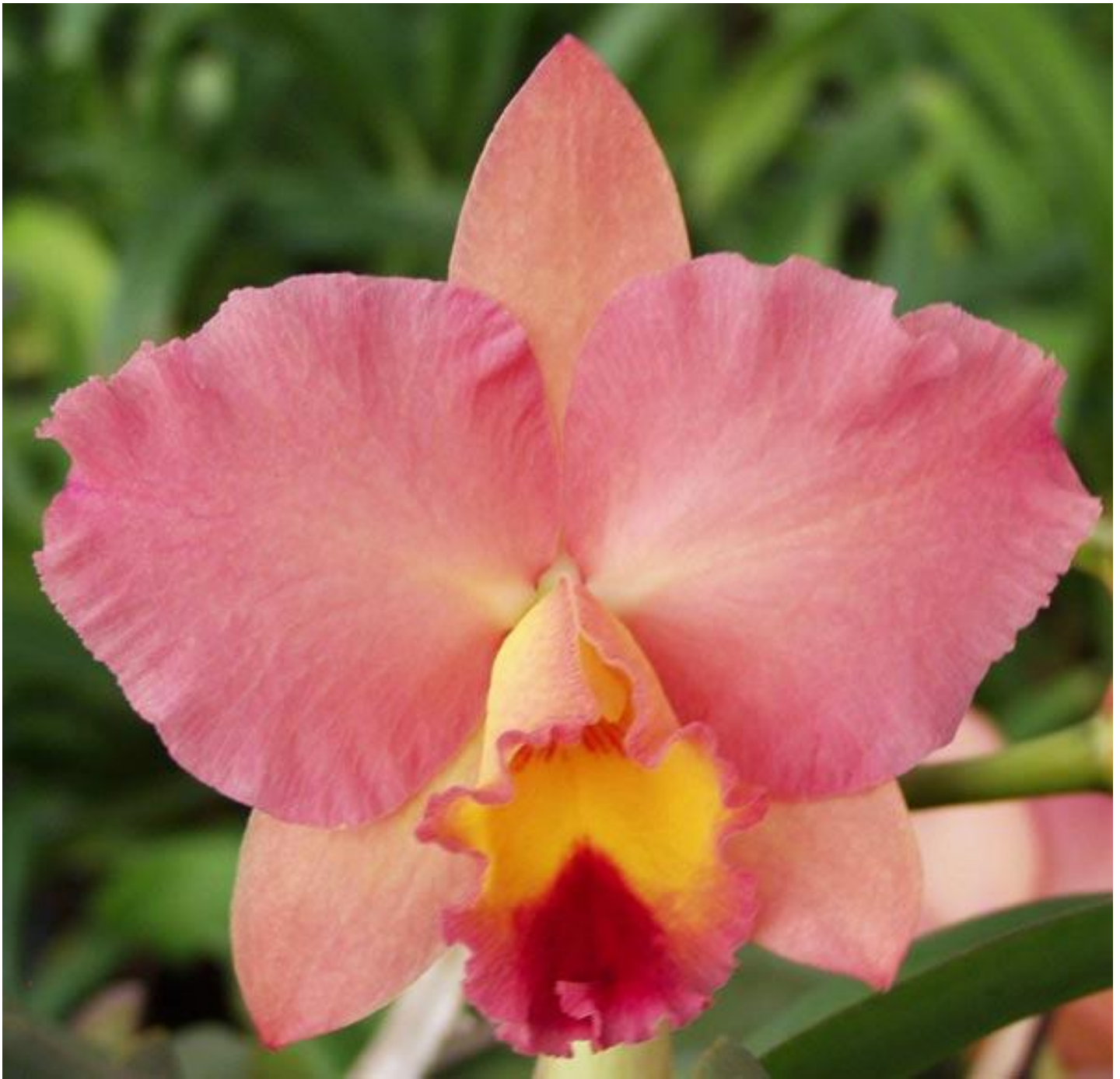
Slc. Final Touch 'Mendenhall' AM/AOS - mericlone (C. California Apricot x C. Drumbeat) hybrid

This plant was purchased from Carmela Orchids as a plug in October of 2014 and has been growing happily during summer and winter under shade cloth.