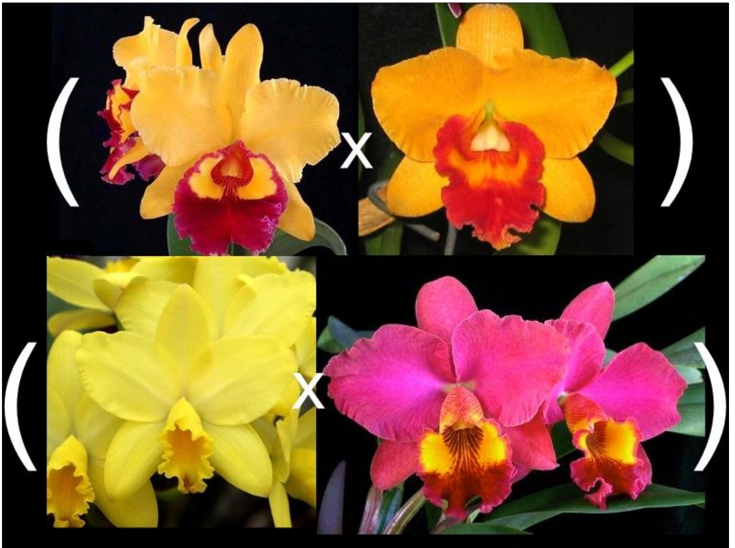
(Rlc. Chungyeah 'Tzeng-Wen' x Pot. Love Call) x (Rlc. Love Sound x Slc. Jeweler's Art) hybrid

This is a cross between the above shown orchid plants. It was purchased from The OrchidWorks as a plug in April of 2016 and has been growing outdoors happily during summer and winter under shade cloth.