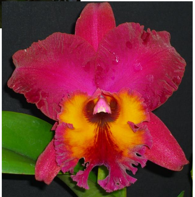
C. Horace 'Maxima' AM/AOS x Rlc. (Oconee 'Mendenhall' x Sunset Sail) 'Paradise' hybrid

This is a cross between the above shown orchid plants. It was purchased from The OrchidWorks as a plug last year and has been growing happily outdoors during summer and winter under shade cloth.