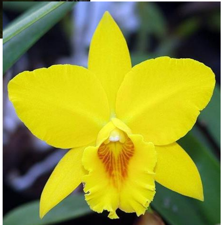
C. Horace 'Maxima' AM/AOS x Pot. Mem. Jim Nickou 'James HCC/AOS' hybrid

This is a cross between the above shown orchid plants. It was purchased from The OrchidWorks as a plug in August of 2016 and has been growing happily outdoors during summer and winter under shade cloth.