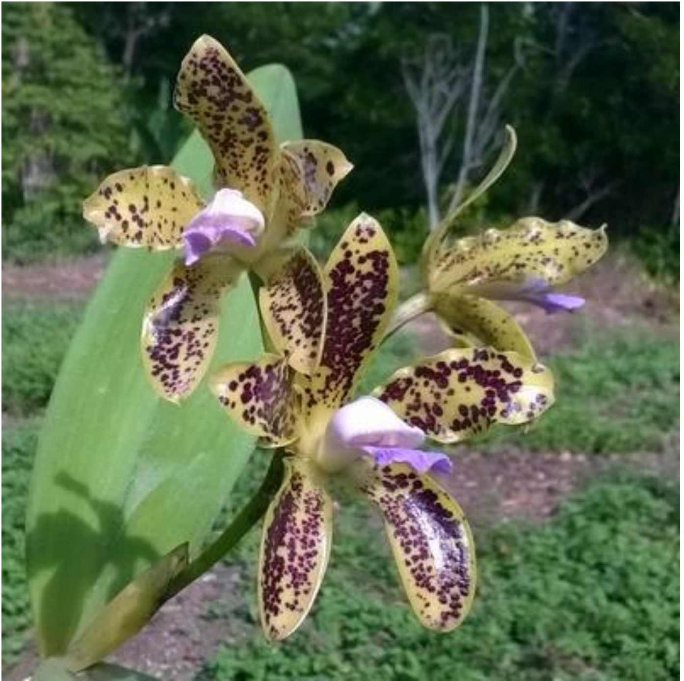
C. guttata var. coerulea ('Keiko' x 'Sergio') species plant

This is a medium sized, cool to warm growing epiphyte or lithophyte which prefers 50% shade and has fragrant flowers. This species needs a distinct dry winter rest which in turn will bring about blooming.