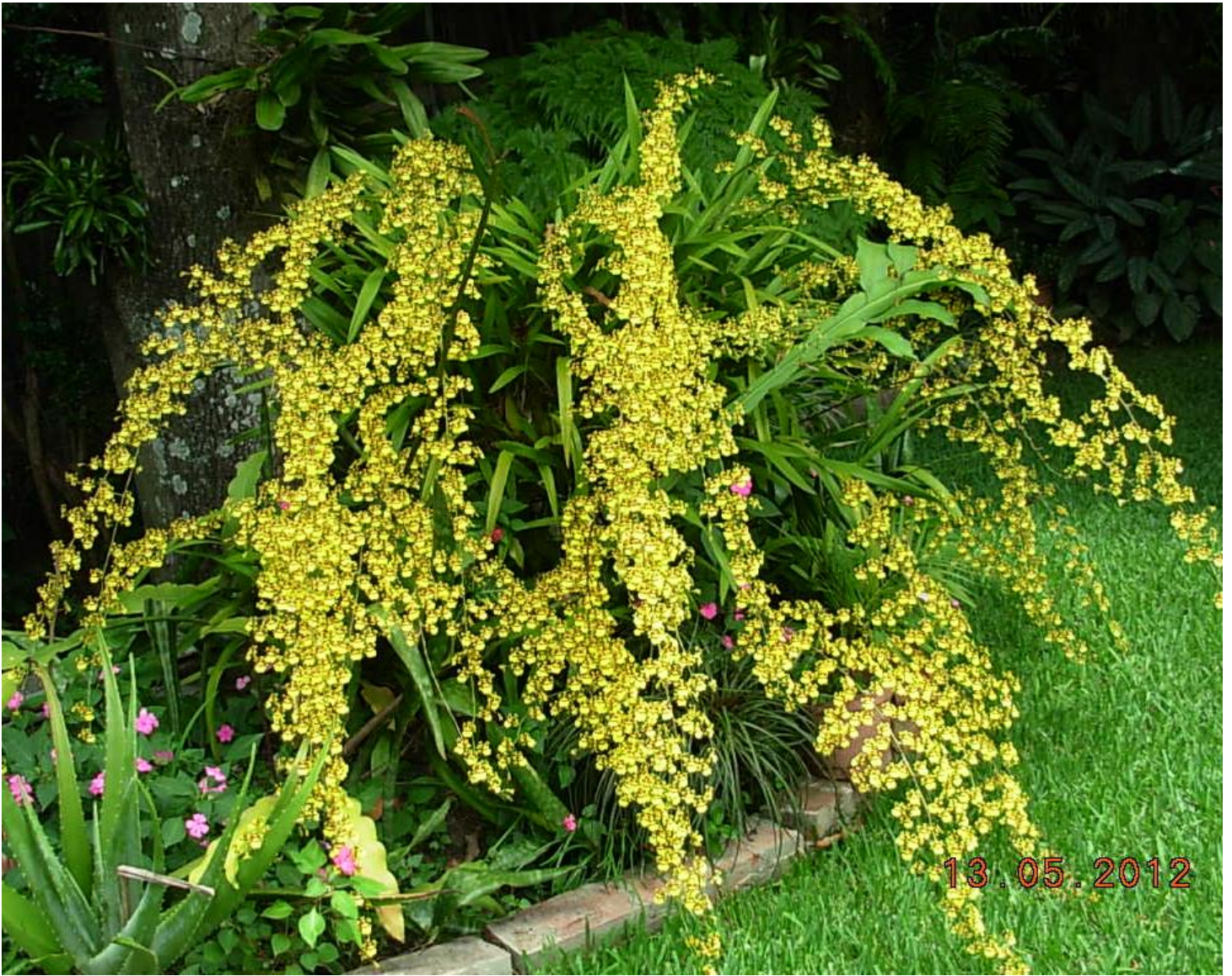
Oncidium sphacelatum species plant

There are several mature plants from which these cuttings have been made. It is a warm to hot growing epiphyte that grows well in this area under approximately 75% shade conditions. It blooms in the spring with spikes that can reach 6 feet in length, with lateral to pendulous panicles that can carry many flowers. The flowers are faintly fragrant.