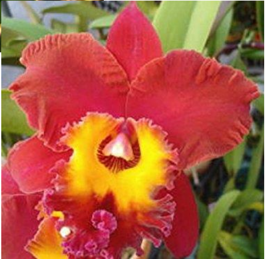
Rlc. Elegant Dancer 'Rouge' x Rlc. (Oconee x Sunset Sails)' 'Paradise Bird' hybrid

This is a cross between the above shown orchid plants. It was purchased from The OrchidWorks as a plug last year and has been growing happily outdoors during summer and winter under shade cloth.