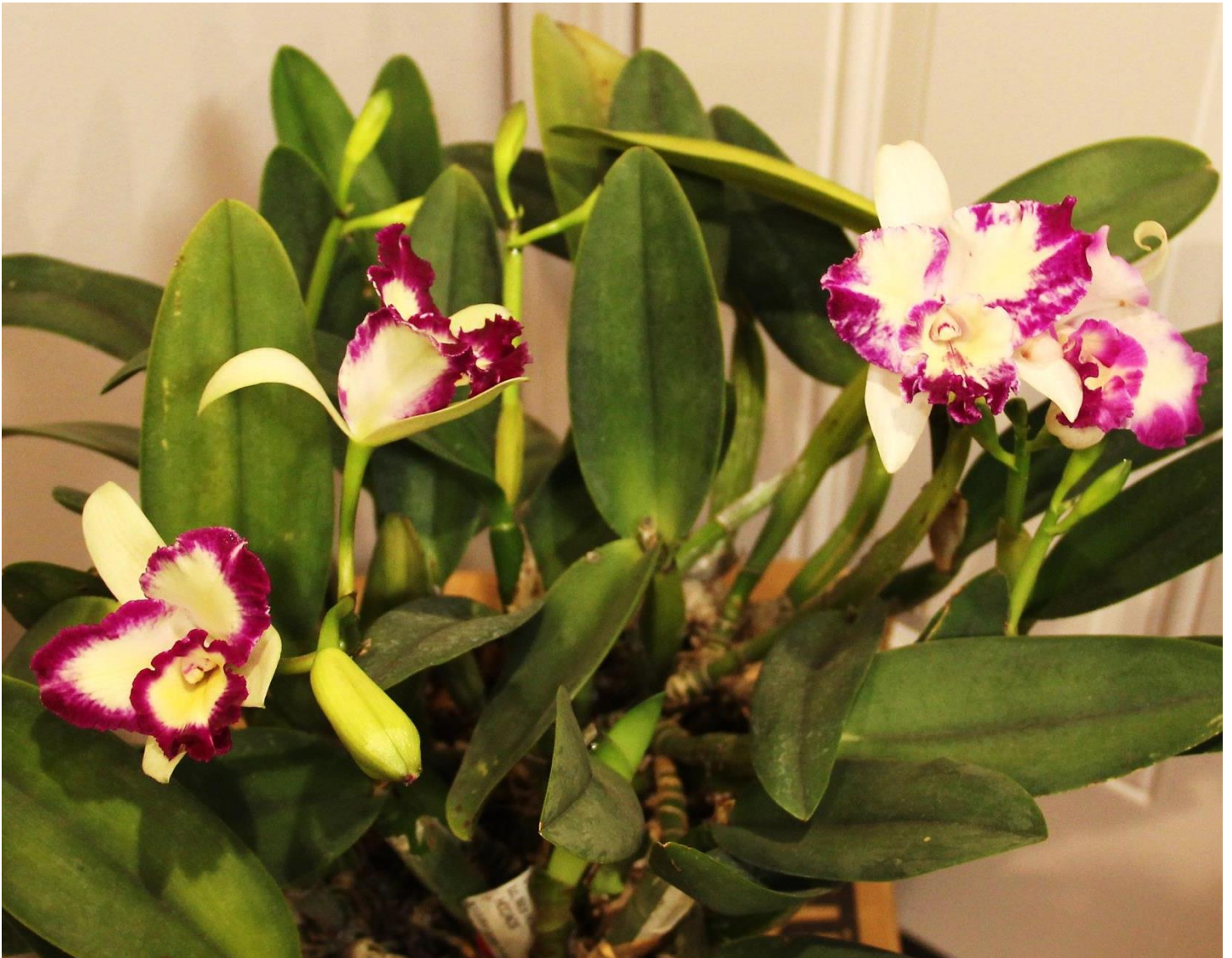
Lc. Nice Holiday 'Suntopia' HCC/AOS (Cattleya Mari's Song x Cattleya Flavina) hybrid

This plant was obtained in March of 2010 from Carmela Orchids at the Santa Barbara Show and is approximately 10" tall. It is grown outdoors year-round under 55% shade cloth and it is an easy grower.