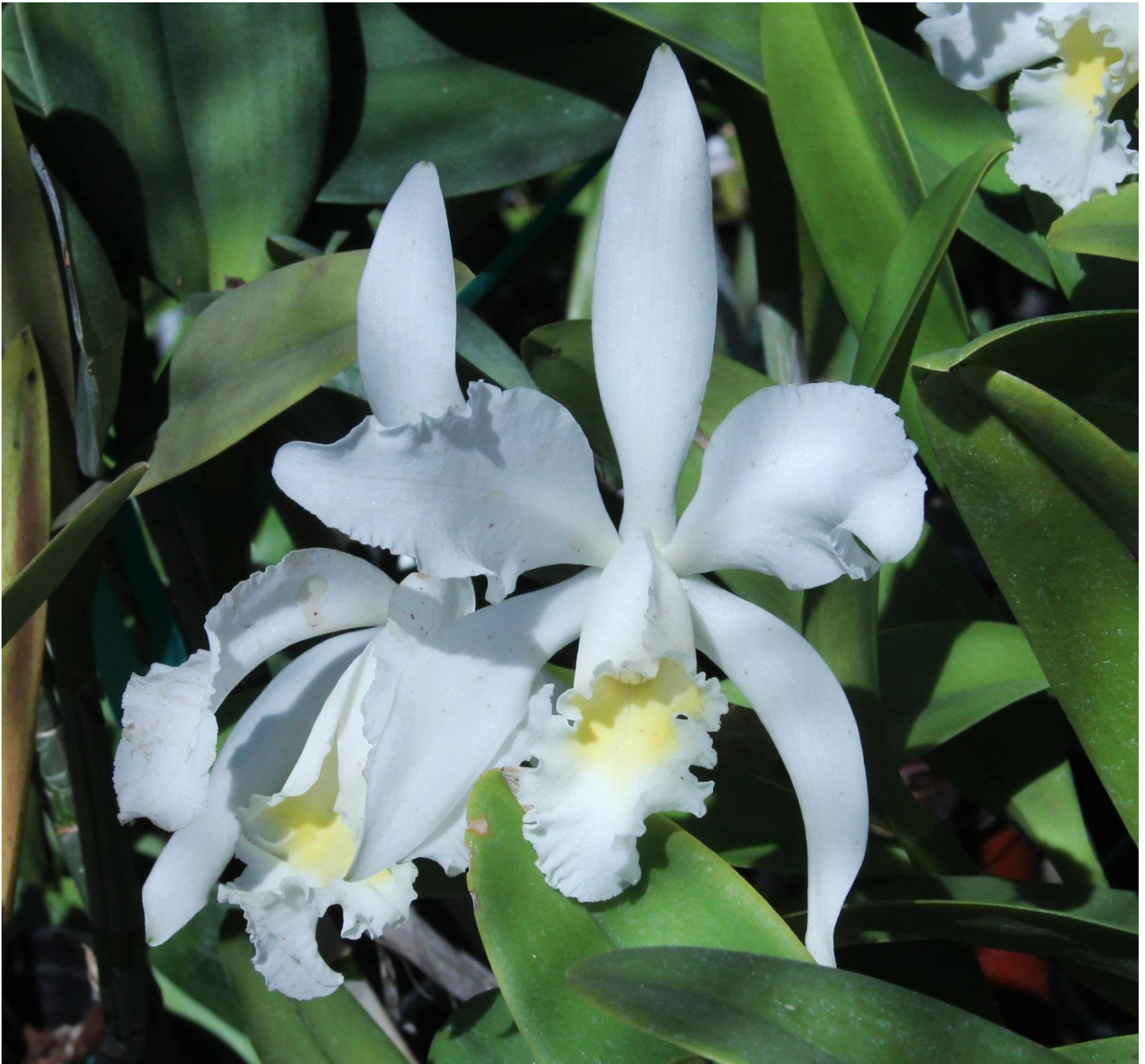
Cattleya intermedia var. alba species plant

This plant was obtained from Mariposa Garden in 2014 as a mature plant. It is approximately 16" in height and is blooming in March this year. It is grown outdoors year-round under 55% shade cloth and it is an easy grower.