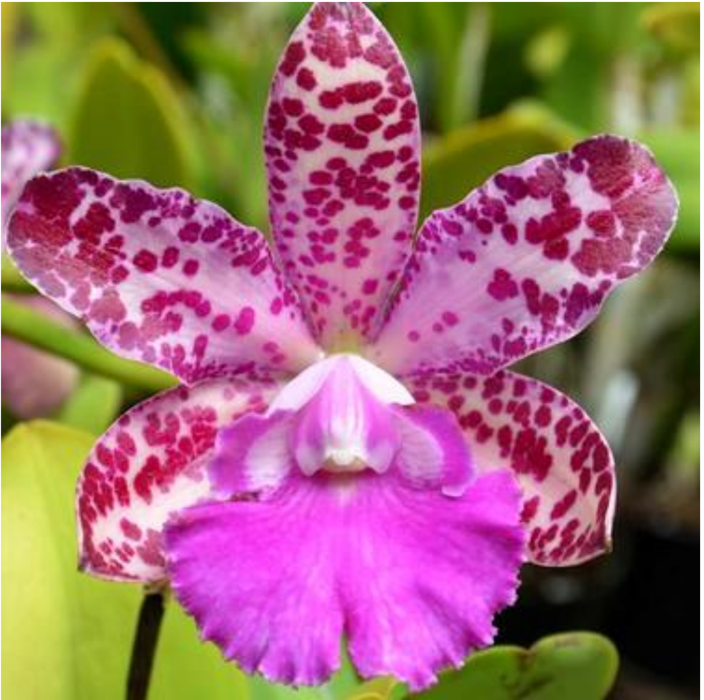
C. Lumita (Gene May x Lulu 'Spots') hybrid

This plant was purchased from H & R Nurseries as a plug in July of 2015 in a compost and has been growing happily during summer and winter under shade cloth.