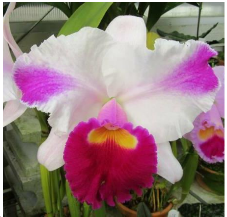
C. Motte Spot 'Paradise' x Rlc. Hilo Grand 'Yuki' hybrid

This is a cross between the above shown orchid plants. It was purchased from The OrchidWorks as a plug last year and has been growing outdoors happily during summer and winter under shade cloth.