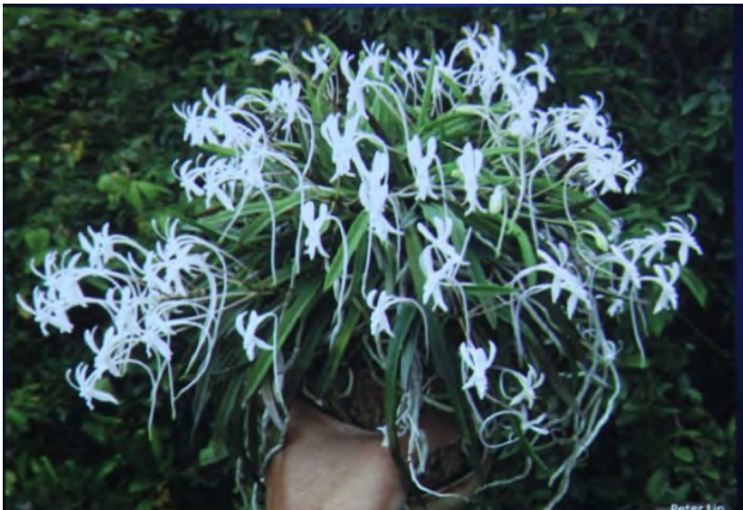
Neofinitia falcata can grow to be a specimen plant yet still be held in one hand (see Peter's hand at lower center of photo).