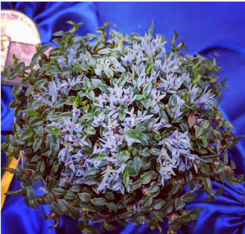
Den. parvulum was the Grand Champion at the 22nd WOC. The flowers are about 0.25 to 0.5 inches across. This supermini plant hails from the interior portions of New Guinea. See more photos from the conference at www.instagram.com/americanorchidsociety .