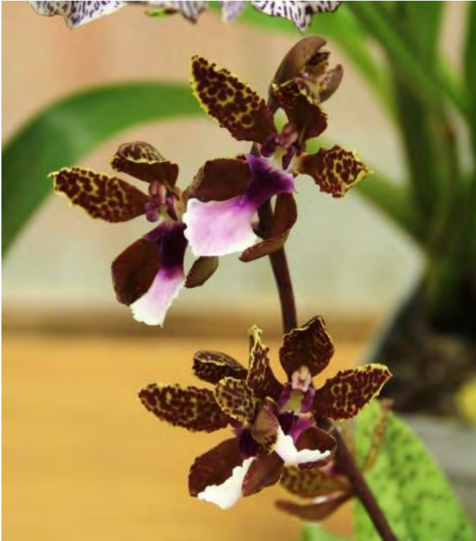
Species – First Place Oncidium No Name – Una Yeh