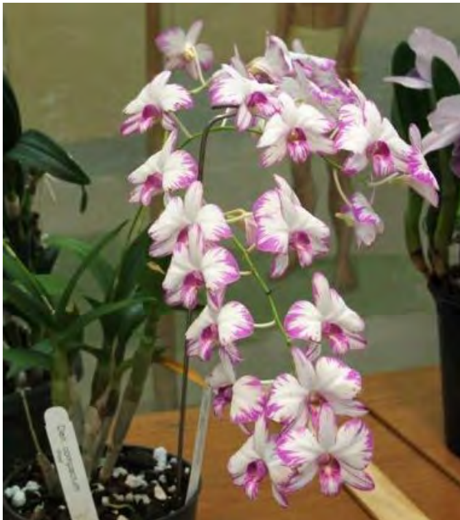
Dendrobium – First Place Den. compactum 'Pink' – Jim Wheeler