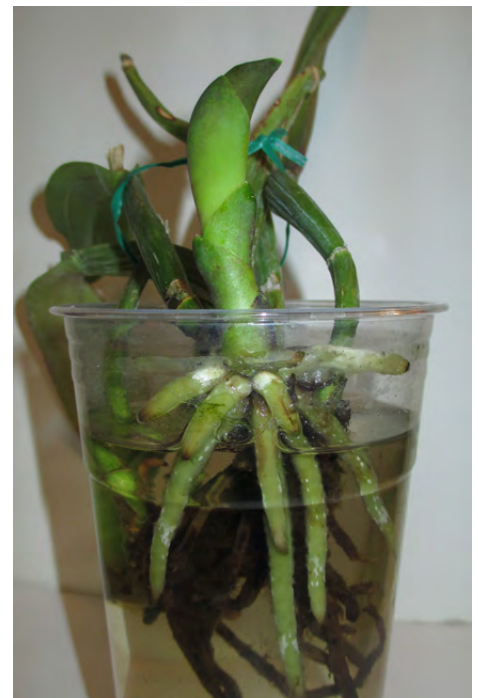
Orange County Orchid Society

I can really recommend this method for reviving an orchid.