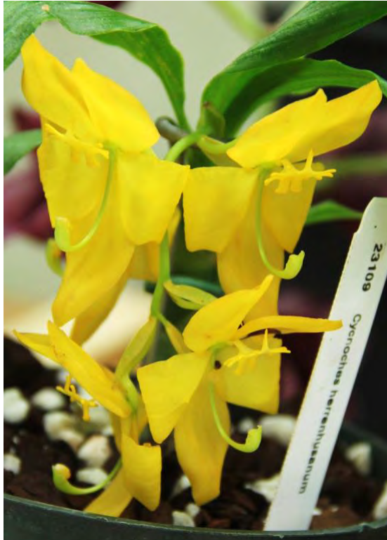
Botanical – First Place Cycnoches herrenhusanum – Jim Wheeler