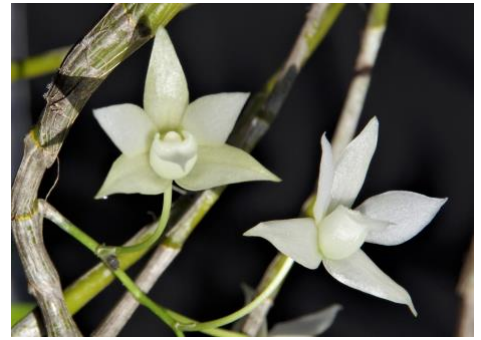
Dend. hercoglossum 'alba'