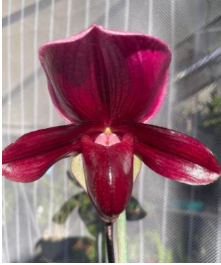
Paph. charlesworthii x Paph, Hsinying Cyber Leopard'