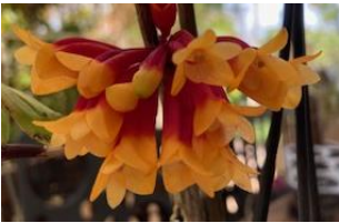
Dend. lawesii var. bicolor

Requires warm conditions, good air circulation, high humidity and frequent watering.