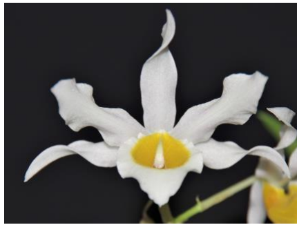
Dend. crystallinum 'alba