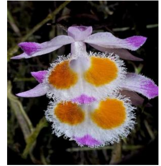
No, it's not a single flower!!