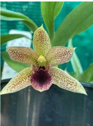
Prom. Dinah Albright 'Connells Point' x rollinsonii