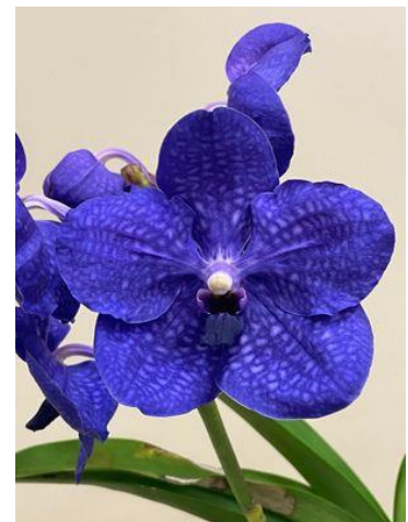
V. Robert's Delight 'Midnight Special'