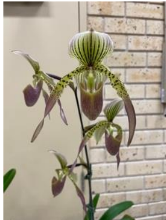
Paph. Larry Booth