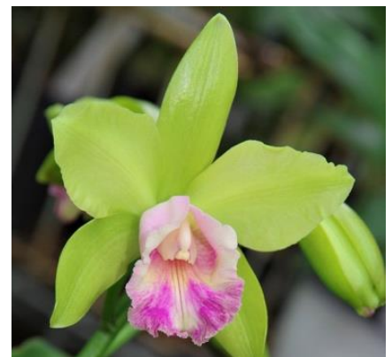
Three seedlings just flowered of Bc. Hawaiian Passion 'Kermie'