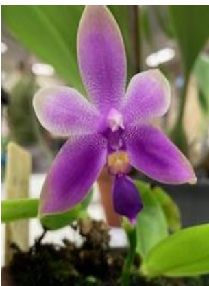
Phal. violacea var.

I am growing in spag and a water well pot, so far so good.