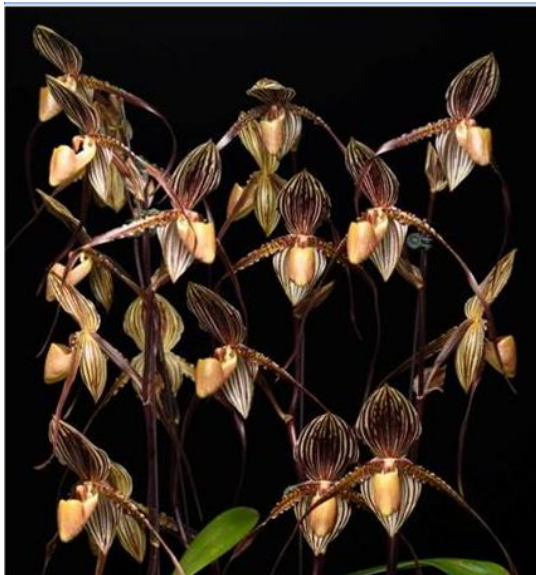
Paphiopedilum Saint Swithin 'Rock Creek' CCM/AOS, AM/AOS May 5, 2018, Photo: Bryan Ramsay, O+ 1.4

Paphiopedilum Saint Swithin is a cross with many awards. It is Paphiopedilum philippinense X Paphiopedilum rothschildianum . The best clones have rothschildianum dominating the form, but most clones tend to have narrow petals. The newest remakes of the cross will be using the newest best rothschildianums and they should be better than what we had up to now.