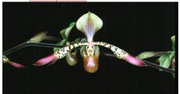
Paphiopedilum lowii 'Jamboree Gem' HCC/AOS, Photo: Orchids Plus v. 1.4

The FCC (First Class Certificates) images shown, show the improvements over time as better clones are used as parents, but your transcriber's favorite is the 'Imperial' clone!