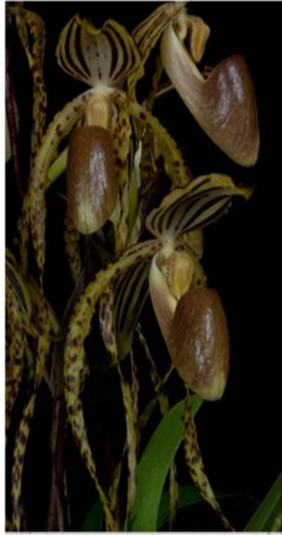
Paphiopedilum Sander's Pride 'Jake's Chasus' HCC/AOS, O+ 1.4