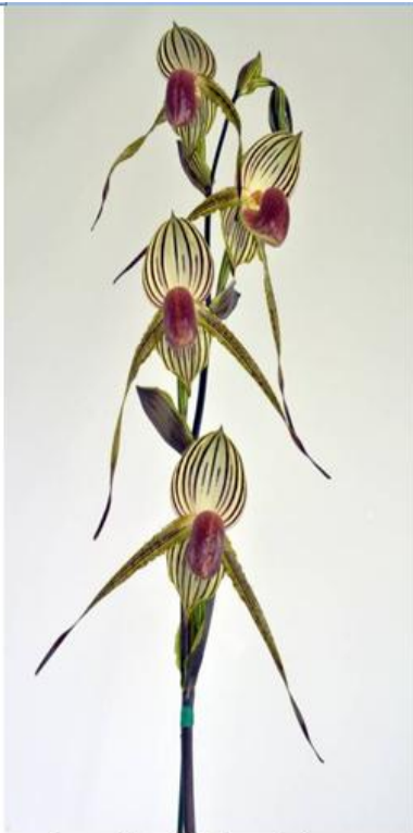
Paphiopedilum Lady Isabel 'Bald Eagle' HCC/AOS, O+ 1.4