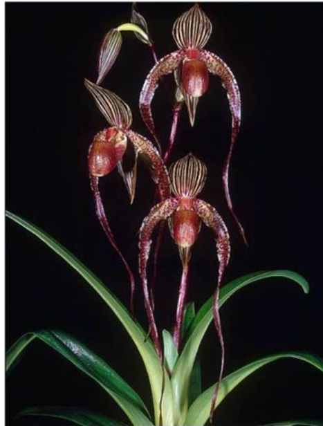
Paphiopedilum Prince Edward of York 'Imperial' FCC/AOS, March 24, 2006, Photo: Armand Latour, O+ 1.4