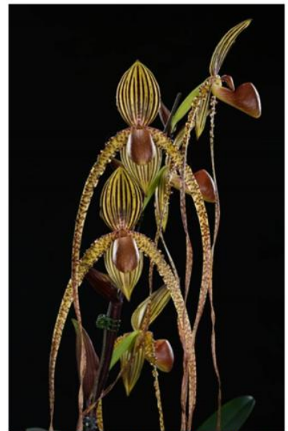
Paphiopedilum Prince Edward of York 'TN 2391-2' FCC/AOS, March 2, 2017 Photo: Jea Shang, O+ 1.4