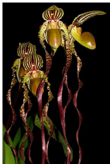
Paphiopedilum Michael Koopowitz 'Brandon' AM/AOS, O+ 1.4