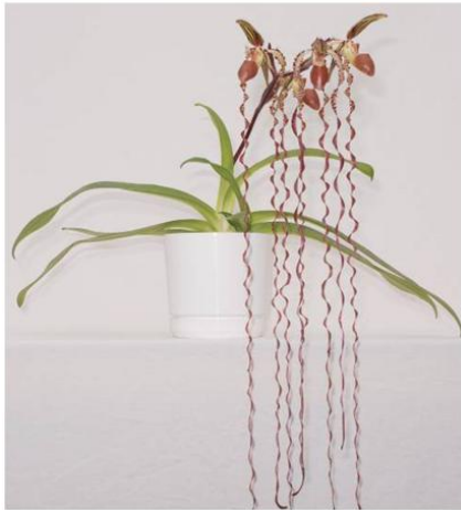
Paphiopedilum sanderianum 'Dr John Doherty' AM/AOS, O+ 1.4