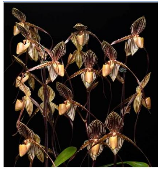
Paphiopedilum Saint Swithin 'Rock Creek' CCM/AOS, AM/AOS May 5, 2018, O+ 1.4

Paphiopedilum Saint Swithin is a cross with many awards. It is Paphiopedilum philippinense X Paphiopedilum rothschildianum . The best clones have rothschildianum dominating the form, but most clones tend to have narrow petals. The newest remakes of the cross will be using the newest best rothschildianum s and they should be better than what we had up to now.