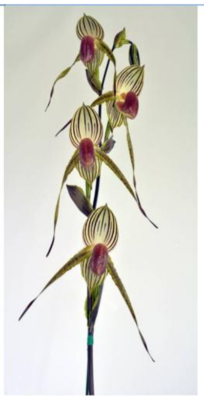
Paphiopedilum Lady Isabel 'Bald Eagle' HCC/AOS, Photo: Glen Barfield, O+ 1.4