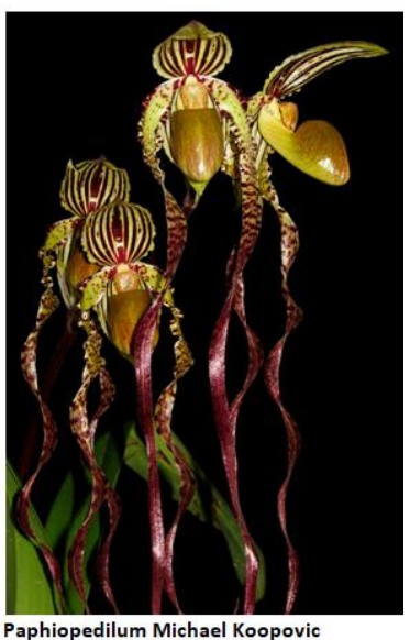
Paphiopedilum Michael Koopovic