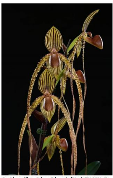
Paphiopedilum Prince Edward of York 'TN 2391-2' FCC/AOS, March 2, 2017 Photo: Jea Shang, O+ 1.4