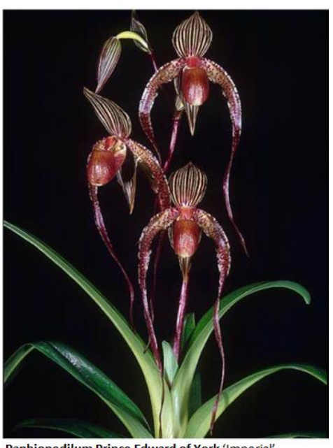
Paphiopedilum Prince Edward of York 'Imperial' FCC/AOS, March 24, 2006, Photo: Armand Latour, O+ 1.4