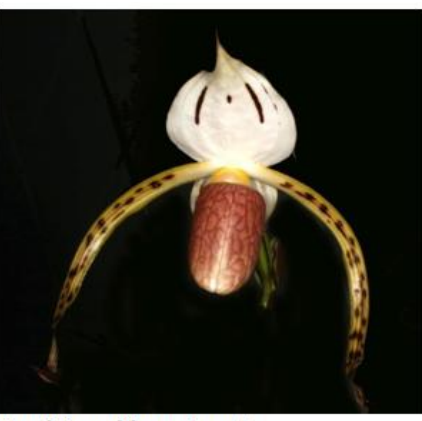
Paphiopedilum stonei Photo: Lynn O'Shaughnessy, OW 5.0

Paphiopedilum stonei has nice colours, but the dorsal is usually very hooded and its colour washes out more intense colours of the other parent in hybrids. Also the petals are narrow and their form is poor — reflexed on the proximal part and irregularly twisted at the distal part.