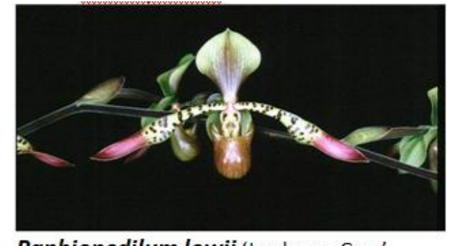
Paphiopedilum lowii 'Jamboree Gem' HCC/AOS, Photo: Orchids Plus v. 1.4