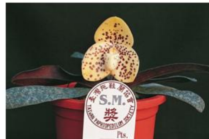
Paph. Conco-bellatulum 'Chen-Fu' SM/TPS Is a peach clone (Orchids +)