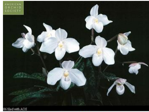
Paphiopedilum Pisar 'MAJ' CCM/AOS (O+)

The cross of Paphiopedilum concolor with Paph. emersonii results in a flower that looks like a mini emersonii .