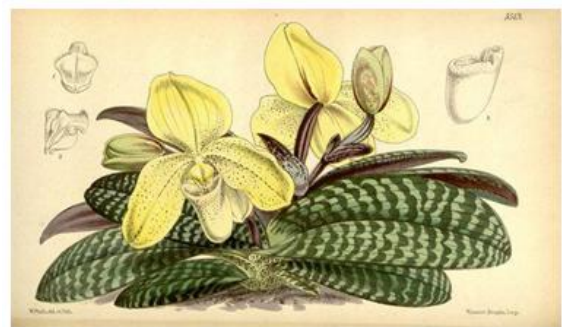
Paphiopedilum concolor , image from Curtis's Botanical Magazine, OWX3.3