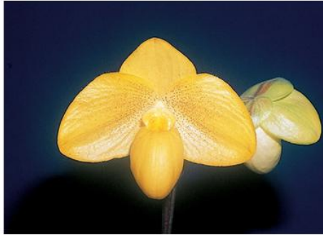
Paphiopedilum Fumi's Gold 'Elim' SM/TPS (83pts), Natural spread 10.0 x 8.0cm, a large gold flower