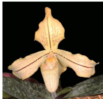
Paphiopedilum concolor variety longipetalum , OW X3.3

Another variety that has different flowers is the variety striatum . It has a stripe along the centre of the dorsal sepal and petals. Another form, found in a small area of Thailand is the variety longipetalum (Rolfe-1896) Pfitzer (1903) which, as the name implies has longer petals. The tessellation is unlike the typical form which has spots only, but the spotting and heart-shaped staminode is the same as in the typical form. Also it has no scent, while the typical form usually has a scent.