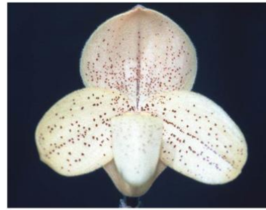
Paphiopedilum concolor 'Dudley Ott' AM/AOS, 80 points, (Natural spread 5.9 x 5.6cm), Orchids+

Because of its wide geographical range this species varies a lot. An interesting variety is subspecies chlorophyllum (Rchb.f.) Fowlie 1977 (not recognized by World Checklist of Monocotyledon Database - WCMD), which has no purple in the leaves, but the flowers are like the normal form. It was mistaken for an alba form during its discovery.