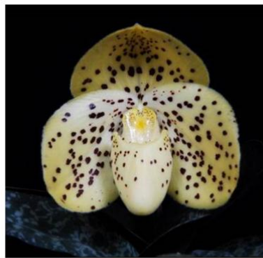
Paphiopedilum wenshanense 'Omoteyama' Bronze Medal/JOGA 77 points, Photo: Orchids Plus

This variety is only of interest to collectors not to breeders..... But the WCMD does recognize this variety.