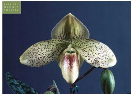
Paphiopedilum Colorkulii 'Bluejay' AM/AOS(O+)

Paphiopedilum Colorkulii is a cross with sukhakulii , a species with fairly wide, flat horizontally held petals: