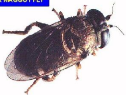
GINGER MAGGOT Eumeris figurans GINGER MAGGOT FLY

This species is pollinated by the hover fly, Eumeris figurans in the wild. This fly is a pest damaging ginger plants.