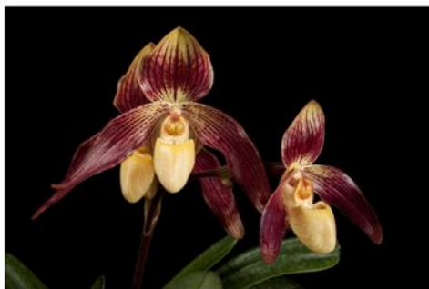
Paphiopedilum Conestoga 'OK' , HCC/AOS

Hybrids of Paphiopedilum concolor with Parvisepalum species (the Chinese Paphs with full, large petals and small dorsals):