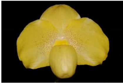
Paphiopedilum Fumi's Gold '24 K Gold' AM/AOS (85 pts), Natural Spread 8.9 x 7.7cm, is a very full light gold flower. (O+)

Hybrids of Paphiopedilum concolor with Cochlopetalum alliance (Successively flowering) are interesting, but of course not as full as the previous hybrids: