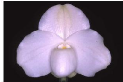
Paphiopedilum Wellesleyanum 'Hat Trick' HCC/AOS is a lovely unspotted white clone.