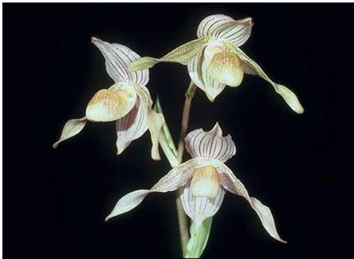
Paphiopedilum Conkoloco 'Falls' HCC/AOS

Paphiopedilum Conestoga is a cross with the elegant Paph. philippinense