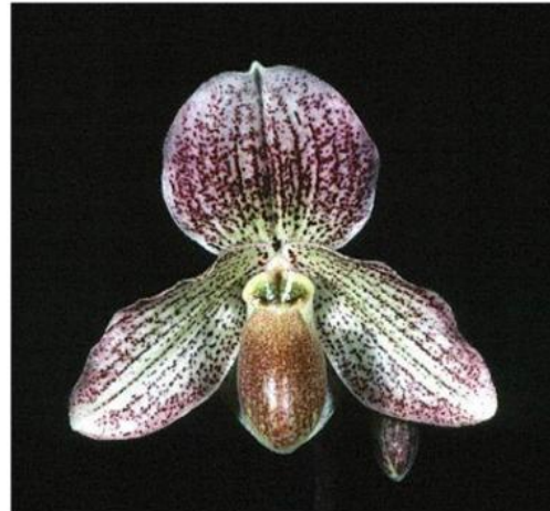
Paphiopedilum Soulangeana 'Cathedral Oaks' HCC/AOS, O+

Paphiopedilum Colorkulii is a cross with sukhakulii , a species with fairly wide, flat horizontally held petals: