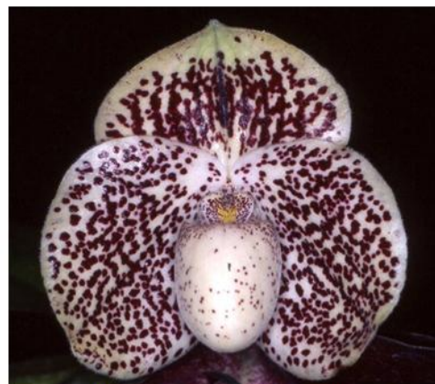
Paphiopedilum Bella Lucia 'Red Pepper' HCC/AOS Photo: Craig Plahn, OW X3.3

Paphiopedilum Wellesleyanum crossed with Paphiopedilum concolor results in Paphiopedilum Bella Lucia . The clone shown by our speaker was even flatter than the example shown here.