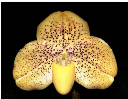
Paphiopedilum Wellesleyanum 'Omaha's Fifth'

The Thai breeders are also working with Paph. Wellesleyanum ( concolor x godfroyae ) trying to get full yellow flowers. The clone shown was well on its way to the goal. The clone shown here is almost as good.