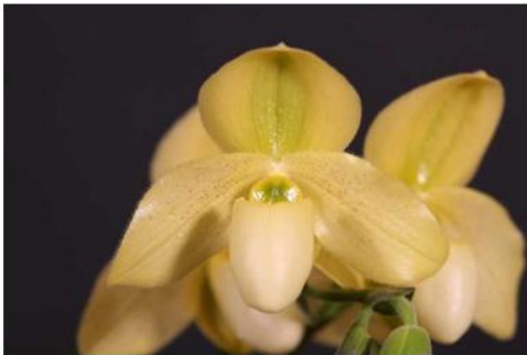
Paphiopedilum Primcolor 'JER' AM/AOS 80 pts Paphiopedilum concolor X primulinum

Paphiopedilum Primcolor , a hybrid of concolor with primulinum varies from white to gold, with or without spots: