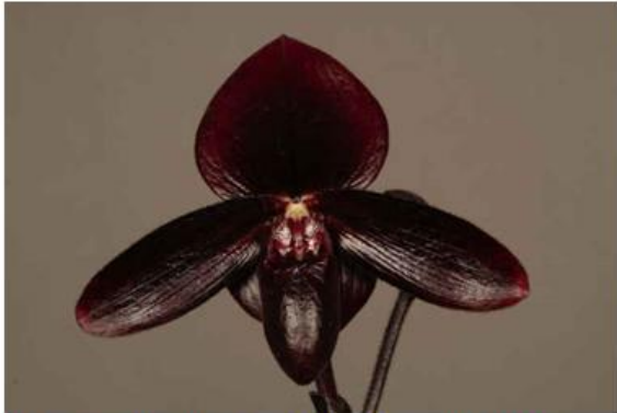
Paphiopedilum Ron Sims 'Ursa Major' FCC/AOS

The cross of Charles Sladden and concolor , Paph. Moon Capricorn , illustrated by the clone 'Mountain Fur' BM/JOGA. It was droopy and not very full, nor with flat segments. The cross of the vini-coloured Paph. Hsingyin Web with concolor resulted in Paphiopedilum Ron Sims . The only award was to the clone shown and it got a 90pt FCC/AOS! It was a smooth near black flower with red flares around the dorsal edge and the petal tips. Stunning!