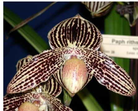
Paphiopedilum Louise Jernigan , Photo: Lois Cinert, OW X3.3

The breeders are also producing multiflowered, large, yellow, full Paphs. by crossing Paph. Concoloko with Paph. armeniacum .