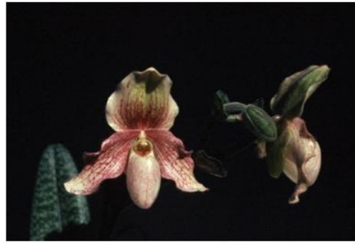
Paphiopedilum Tinicum 'Ken Johnson' AM/AOS Paphiopedilum concolor X glaucophyllum (O+)

Paphiopedilum Tinicum a hybrid of concolor with glaucophyllum has not lost the grace of the species: