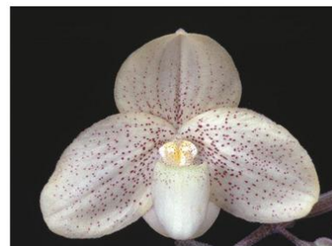
Paphiopedilum concolor 'Massive' AM/AOS

The natural hybrid Paphiopedilum wenshanense Z J Liu & Yong Zhang (2009) is a hybrid swarm of Paph. concolor and bellatulum . It used to be known as Paphiopedilum concolor-bellatulum , a name now reserved for the man-made hybrid. It occurs in South-Central China (Eastern Yunnan to Southwest Guangxi) where the ranges of the two parent species overlap. But the curious effect of the hybridization was that the flowering time shifted ahead of that of its parents. It is therefore reproductively isolated from them and is inevitably evolving away from them. (Catherine Cash, The Slipper Orchids, Pg. 80)