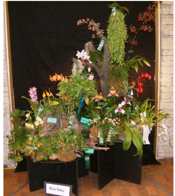
Marsh Hollow Display at SOOS 2011 Show, AOS Show Trophy, Silver Medal Certificate.