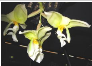
Plant: Stanhopea inodora Grower: G Yong Gee