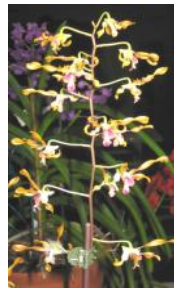
Plant :- Den. Gloucester Sands Grower :- K & P Webster