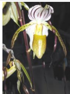
Plant :- Paph. Mount Toro 'Granada' Grower:- L Vickers