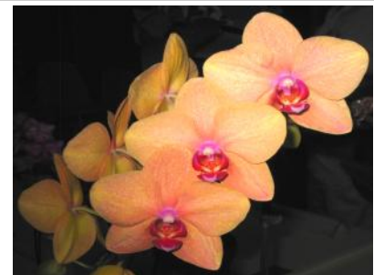
Plant :- Phal. Leopard Prince 'Seasons Prince' Grower :- G. Grant