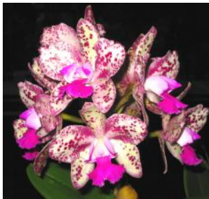
Plant :- C. Caudebec Candy Grower :- L Baxter