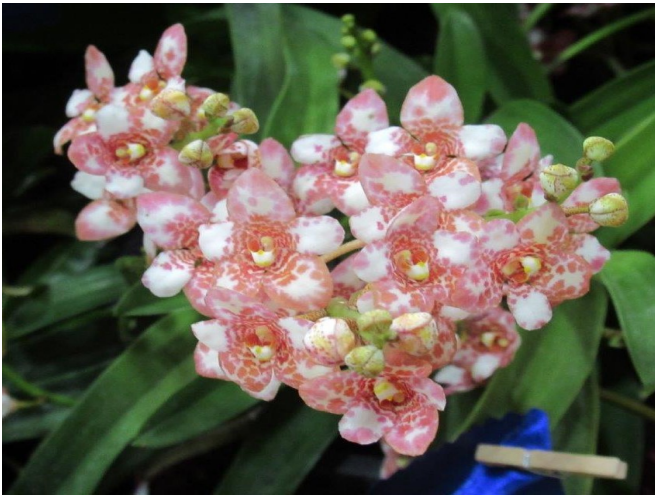
Sarco. Kulnura Blend 'Pink Picotee'