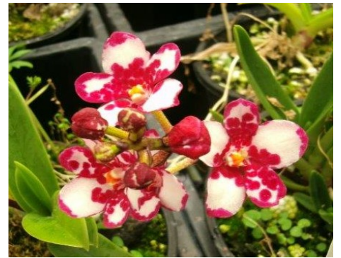
Sarco. Kulnura Ballerina x Sarco. Kulnura Secure