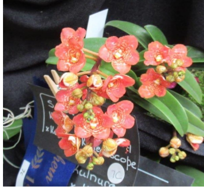
Sarco. Kulnura Sanctuary x Sarco. Kulnura Kaliedescope