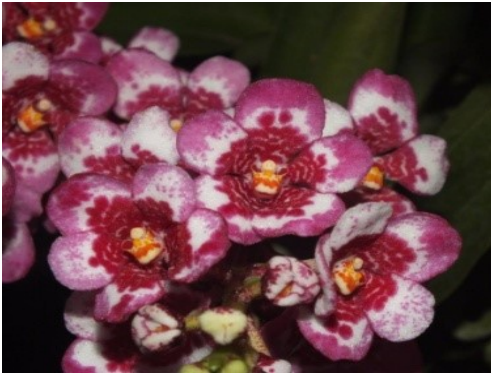
Sarco. Kulnura Now 'Dreamer' AM

Last month there was an open day at Barrita Orchid Nursery at Kulnura. Barrita Orchids grow mainly Sarcochilus and Cymbidiums and below are a few of his latest hybrids, as well as some photos of plants in the Southern Orchid Spectacular.