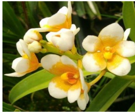
Sarco. Kulnura Lemon