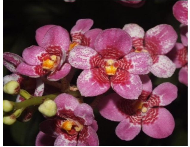
Sarco. Kulnura Dragonfly '#3' AM