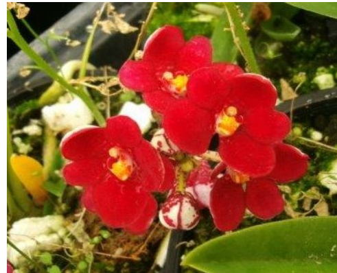
Sarco. Kulnura Fireball x Sarco. Sweetheart