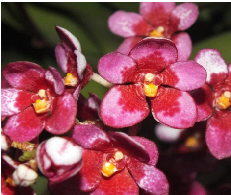
Sarco. Kulnura Hysteria 'RedA' AM