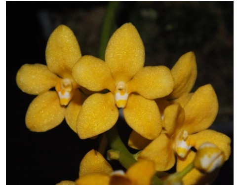
Sarco. Kulnura Taser 'Bethany' AD