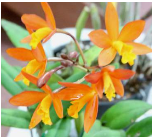
Ctt. Sixpence - Mal