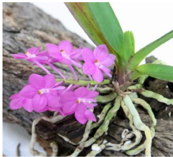
Vanda ampullacea - Mavis