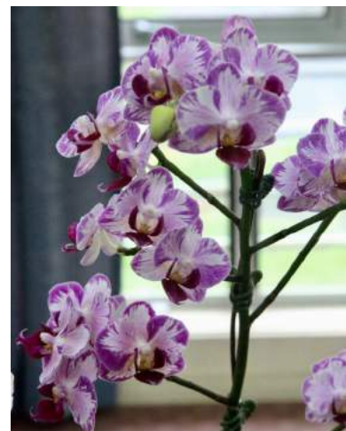
Phal. Little Gem Stripe 'Flare' - Judy