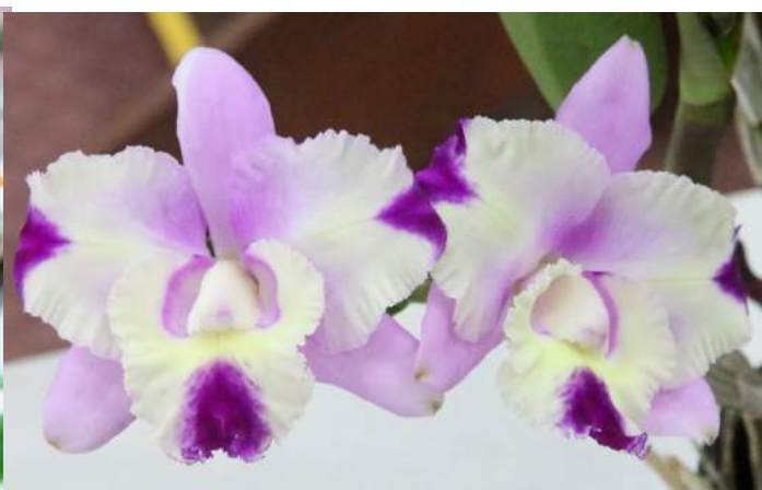
Rlc. Capricorn Charm - Graham & Beryl