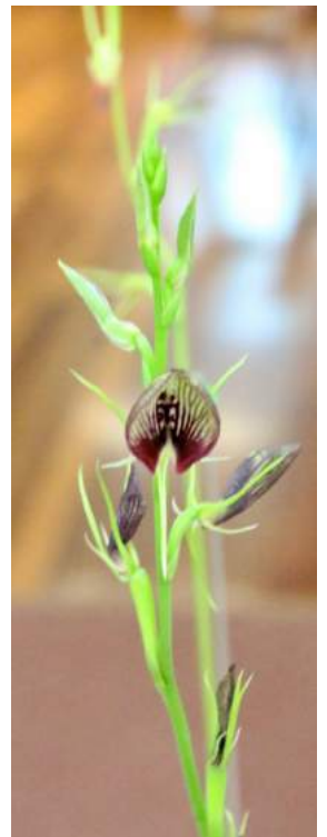
Cryptostylis erecta - Alan & Alison