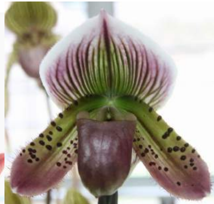
Paph. Flame Arrow Graham & Beryl