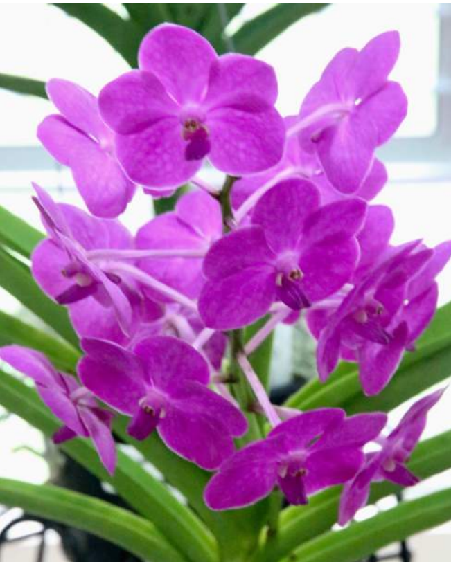
V. Suksamran Beauty - Tom