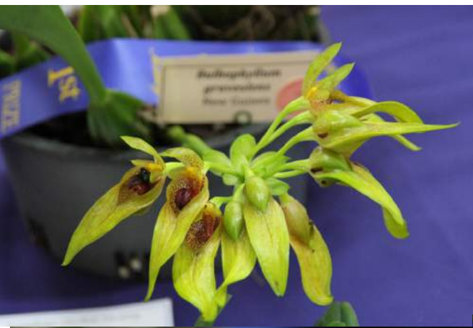
A small selection of plant on display at the Species Show