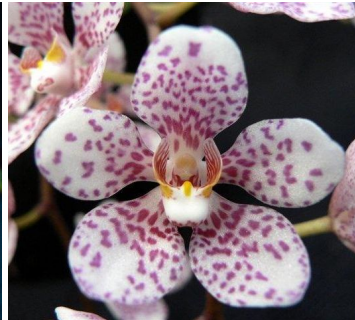
Sun Spot (=falc x fitzchart)