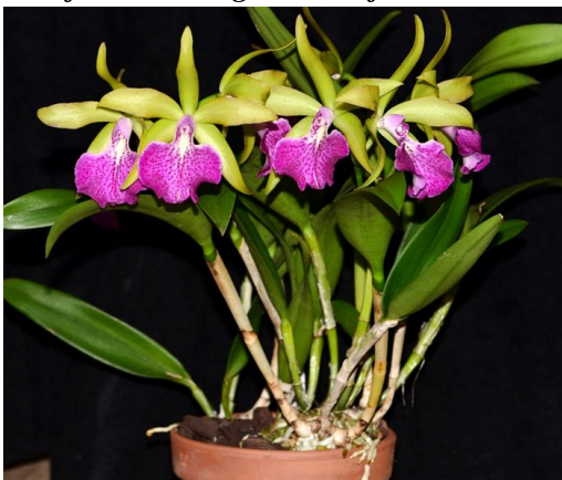
Novice – Bc. Mem. Vida Lee 'Limelight'

Best of the Evening Orchids from last meeting (more on each inside)