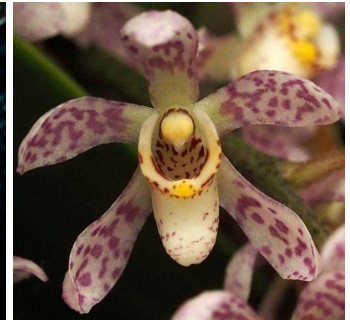
Peristerchilus Olive Grace