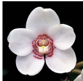
Sarc. Melba (N. Roper)

Neville Roper – in an analysis Neville did of the features he had observed passing from species to hybrid (see KOS bulletin June 2009), Neville reported that he found that where falcatus was the pod parent, there had been some tendency to shorter racemes and slightly less filled in flowers, but he also noted that in the primary hybrid between falcatus and hartmannii ( Sarc Melba ), which grows vigorously and flowers off small plants, although it had long elegant racemes of white flowers with wonderfully contrasting red spots in the centre, some clones displayed rather sequential flowering (ie opening from the bottom first, and the bottom finishing by the time the top flowers opened).