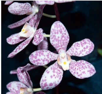
Verolice (=falc x fitzgeraldii)

And to finish, here are a couple of pictures of primary hybrids of Sarc. falcatus that I think have obvious merit and I am sure have been used as parents themselves but that must be another story. Unfortunately, I couldn't find any pictures for a couple that might have tweaked your interest but that is probably because they are hybrids made a good time back. One was the cross with Rhinerrhiza divitiflora , a species with many, many yellow and red spidery flowers that are quite short lived. It's cross to Sarc. falcatus makes Rhinerchilus Orange Stars which would, I imagine, produce similar but slighter fuller flowers that age at least a little better than the spidery parent but I haven't seen it. The other was the cross to Sarc. hirticalcar , which has very small yellow and red flowers and has been used to introduce yellow colours to hartmannii hybrids. The name of that cross is Sarc. Falcalcar but once again no pictures. But anyway, I hope you enjoy and get a few ideas from these last few.