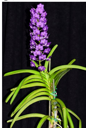
Vandachostylis Pine Rivers 'Wasana'