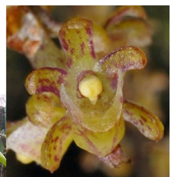
close up of Perist. hillii