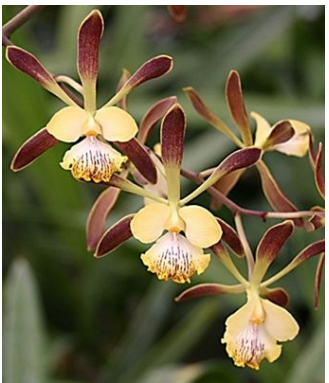
-- Enc. randii --