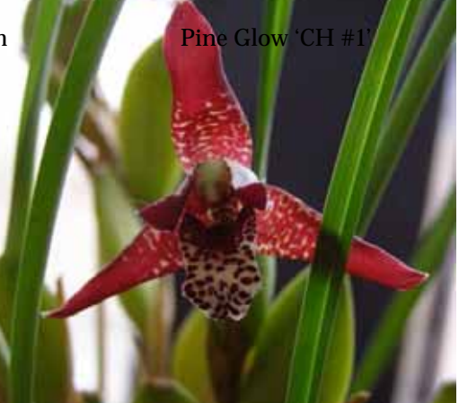
Maxillaria tenuifolia (sp)

Paphiopedilum moquetteanum (sp) Paphiopedilum Greensleeves x Acker's Peak x Acker's Peak