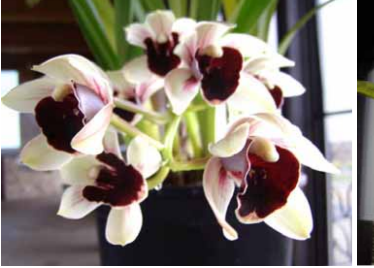
Cymbidium Devon Gala 'New Horizon'