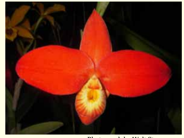
Chuck Acker's Phragmipedium besseae