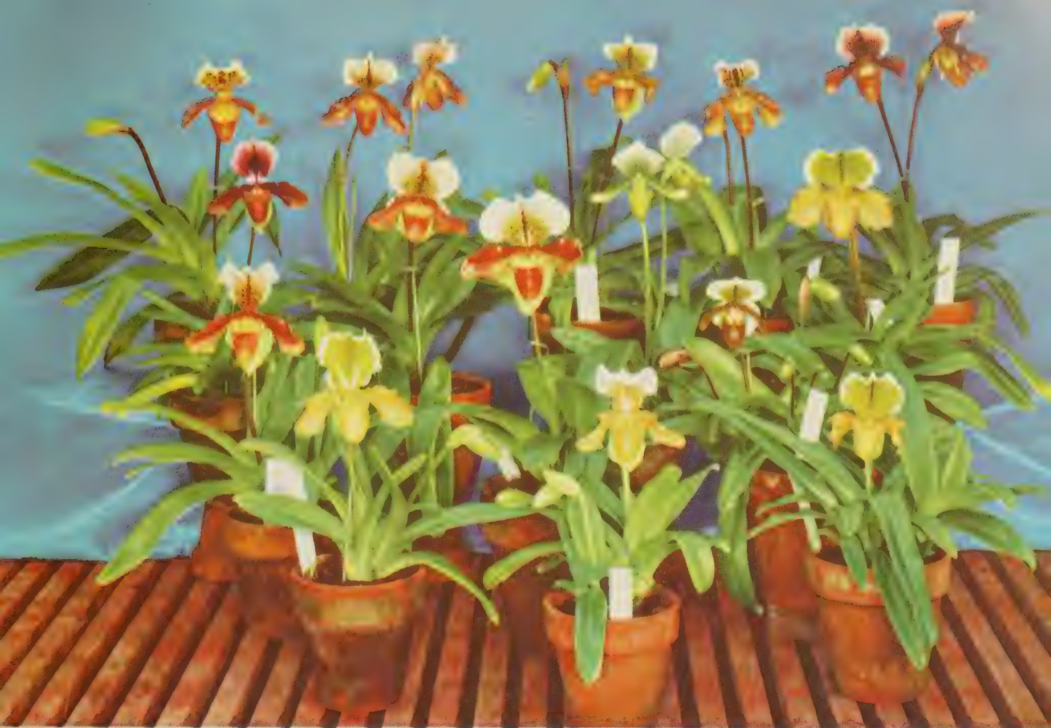
insigne Harefield Hall Corsoir Hadrian Martin Glenarm King Arthur Sundown Maudiae Mag. Crescent Meadow Mem. F.M. Ogilvie Harry Endersby Leeanum Gratrixiae Crescent Meadow Wm. Kirch Olivette

GIGAS VAR. CORNDEAN HALL ( Harrisianum x Lawrenceanum ) . . . . . $25.00 Large size. Deep purple pouch. Petals greenish and darkly veined with dark slate purple. The dorsal is white and heavily veined with purple and sorghum brown.