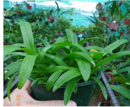
Compot of Den. Virtual Magic x Den. Suan 'Big White'

The distribution of these two growing competition plants to TOS members and visitors who intend becoming TOS members who did not receive theirs last month, will continue at the March meetings (no cost involved). For those of you who have received them, I hope you have potted them into your favourite medium and they have settled in well. Bring them to the meetings for measurement and you could be the lucky grower to win a prize. Happy Growing.