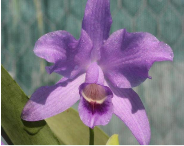
Guarianthe bowringiana var coerulea