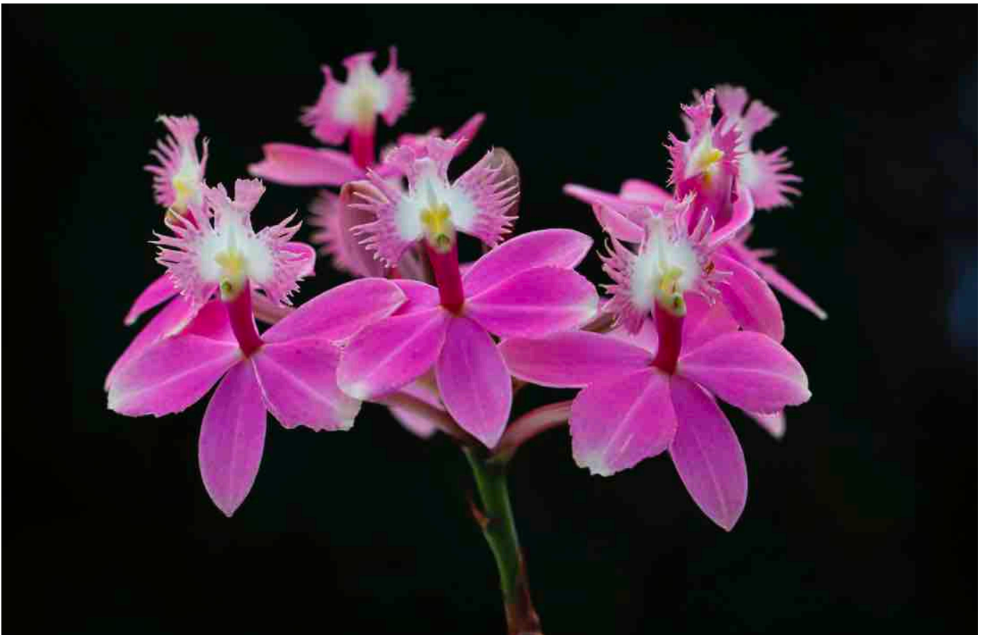
Epi. (Pacific Punch 'Purple' x Pacific Dragon 'Neon Purple') Hot Pink' x Wedding Valev 'Sakura Komachi', grown by Lou Rhoades