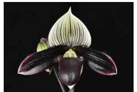
Left: Paph. hirsutissimum 'Paph Zone TBD' AM/AOS, grown by Lehua Orchids Center: Paph. Macabre Illusion 'Slipper Zone Blood Pressure' AM/AOS, grown by Lehua Orchids Right: Paph. Petula Aflame 'Slipper Zone TBD' HCC/AOS, grown by Lehua Orchids