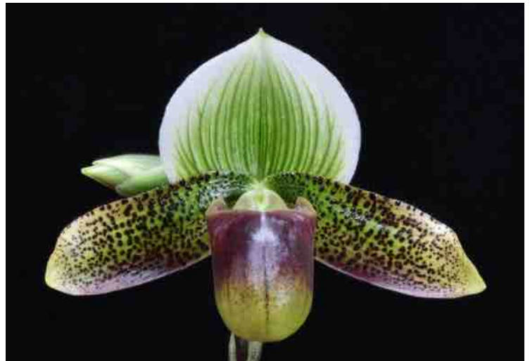
Left: Paph. Paph. Petula's Wood 'Slipper Zone Synsation' HCC/AOS, grown by Lehua Orchids Right: Paph. Spring Pleasure 'Slipper Zone Double Delight' HCC/AOS, grown by Lehua Orchids