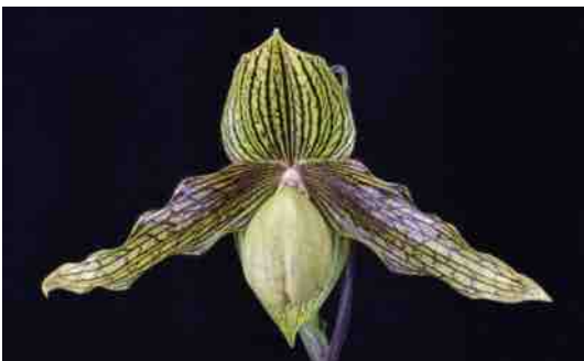
Paph. Harold Koopowitz 'OrchidFix Say What' AM/AOS, grown by OrchidFix