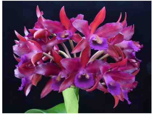
Left: ( Cattleya Japala x L. lyonsii ) 'Fire Eater' HCC/AOS, grown by Orchid Eros