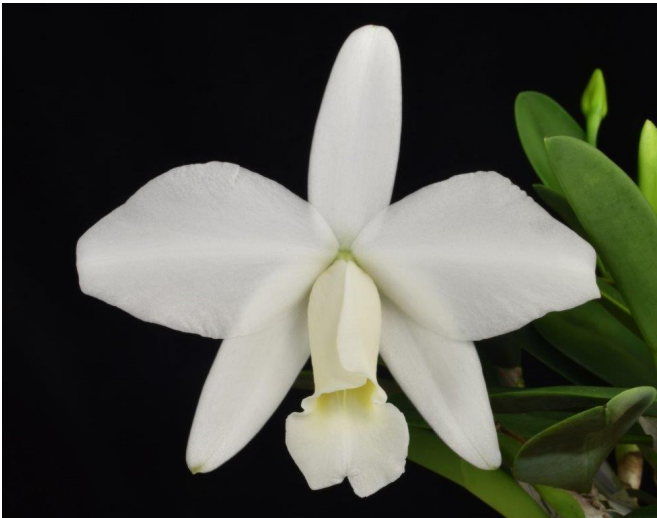
Right: ( Rhyncattleyanthe Love Triangle x Cattlianthe Chocolate Drop) 'OrchidFix Ditto' HCC/AOS, grown by OrchidFix