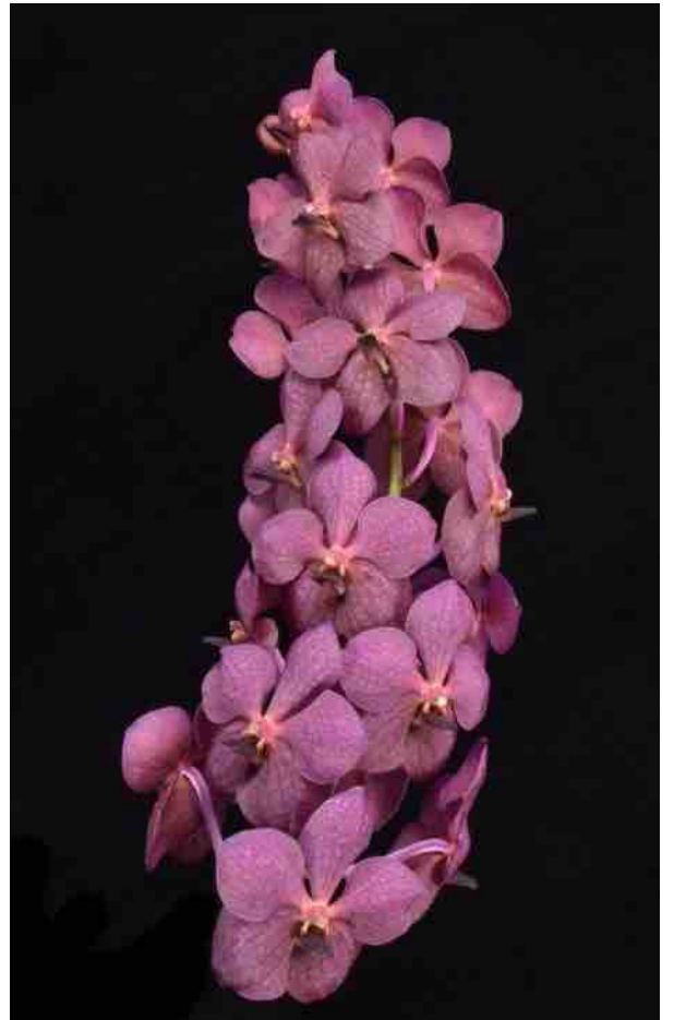
Left: Cattleya tigrina 'Orchid Eros' FCC/AOS, grown by Orchid Eros Right: Vanda Aka's Old School 'Mahalo Ted' JC/AOS, grown by Aka's Orchids