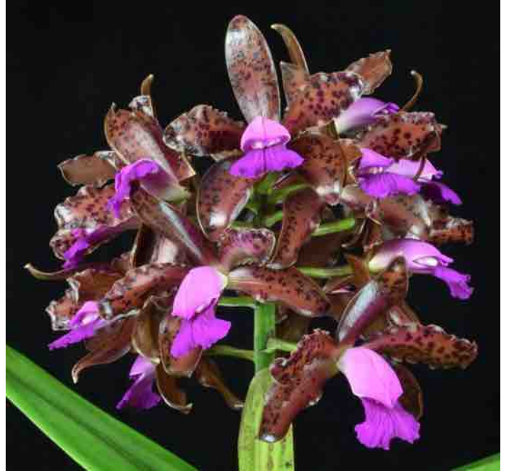
Left: Cattleya tigrina 'Voodoo Child' AM/AOS, grown by Orchid Eros Center: Cattleya tigrina 'Voodoo Queen' HCC/AOS, grown by Orchid Eros