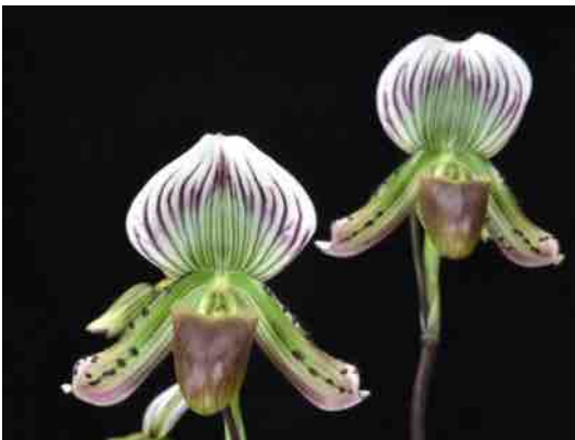
Paph. callosum h.v. thailandensis 'OrchidFix Tiny Gem' HCC/AOS, grown by OrchidFix