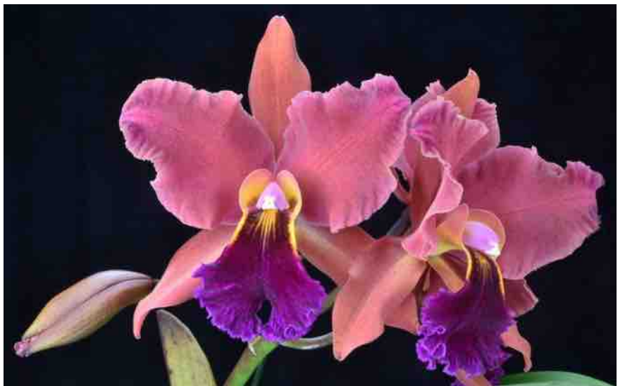
Left: Cattleya x dolosa 'Isabel Rosalia' AM/AOS, grown by Orchid Eros Right: Rlc. Harriet Brickell 'Sailor's Guide' AM/AOS, grown by Orchid Eros