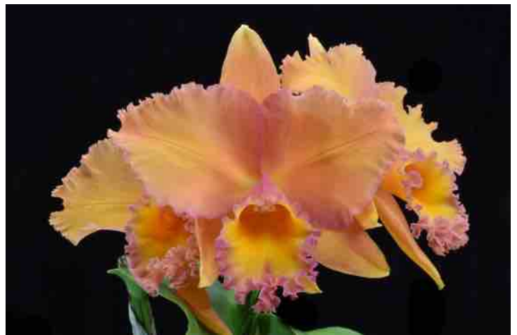
Left: Rlc. Princess of Hawaii 'The Art of Shade' AM/AOS, grown by Lehua Orchids Right: Rlc. Secret Affair 'Thanks Giving' AM/AOS, grown by Orchid Eros