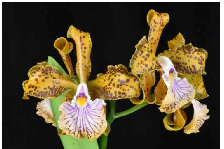
Left: Cattleya Rhythm and Blues 'Aretha Franklin' AM/AOS, grown by Orchid Eros Right: Cattleya velutina 'Rey' AM/AOS, grown by Orchid Eros