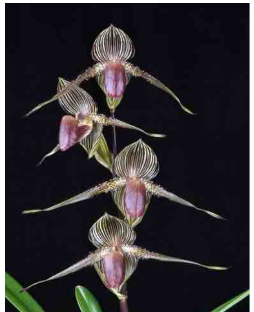
Above right: Paph. rothschildianum 'OrchidFix Ideal' AM/AOS, grown by OrchidFix