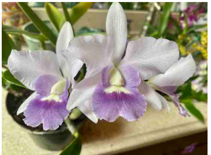
Cattlianthe Final Blue , grown by Julie Goettsch