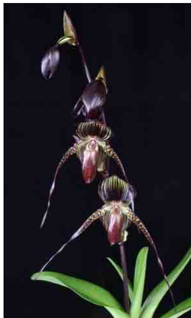
Above left: Paph. Hilo Black Eagle 'OrchidFix Black Warrior' AM/AOS, grown by OrchidFix