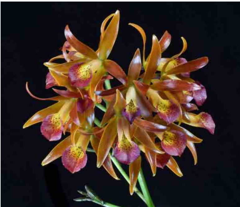
Right: Cattleya velutina 'Leah' HCC/AOS, grown by Orchid Eros