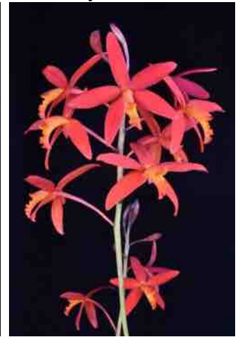
Left: Cattleya grandis v. semi-alba venosa 'Orchid Eros' AM/AOS, grown by Orchid Eros Center: Cattleya Luminosa 'Dark Waters' HCC.AOS, grown by Orchid Eros Right: Cattleya milleri 'Big Island' CCM/AOS, grown by Orchid Eros