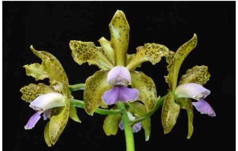
Left: Cattleya Mareeba Tiger f. coerulea 'Mississippi Fred McDowel' AM/AOS, grown by Orchid Eros Right: Cattleya Mareeba Tiger v. coerulea 'Skip James' AM/AOS, grown by Orchid Eros