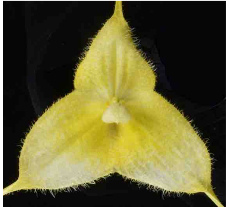
Left: Cattleya schofieldiana 'Jolly Green Giant' FCC/AOS, grown by Orchid Eros Right: Dracula gorgona h.f. xanthine 'Pride and Joy' FCC/AOS, grown by Orchid Eros