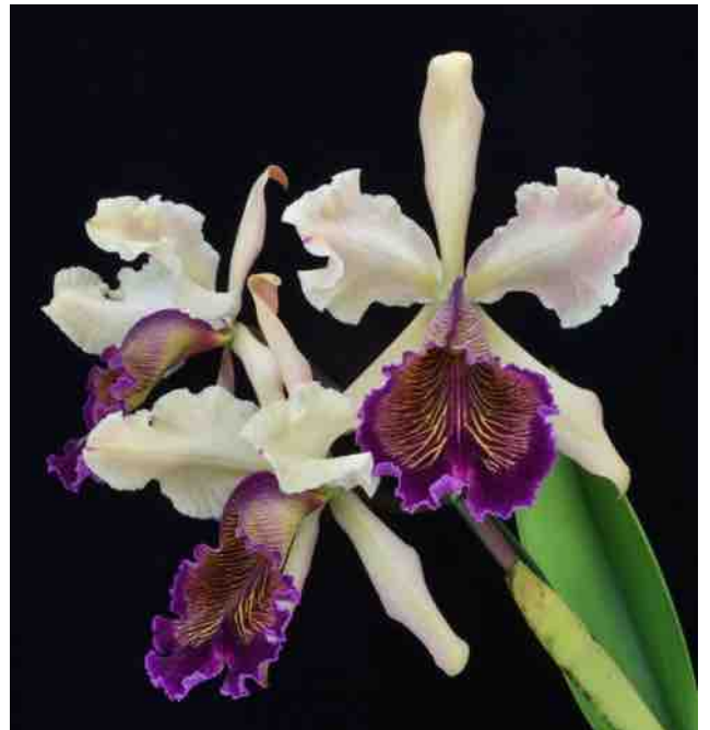
Left: Bc. Grand Chocolate 'Profusion' AM/AOS, grown by Aka's Orchids