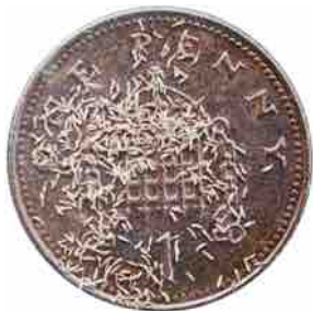
Orchid seeds on an English penny.

Orchid seeds are incredibly tiny. Scientists counted the seeds of one species ( Cycnoches chlorochilon ). The result: a single seedpod contained 3.7 million seeds.