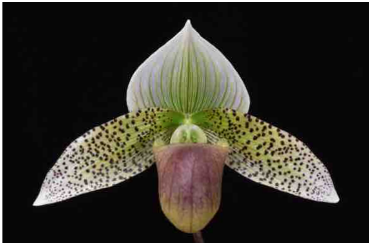
Left: Cattlianthe. Bactia Ice 'Ice Baby' HCC/AOS, grown by Aka's Orchids Right: Paph. Macabre Aura 'Slipper Zone One Version' HCC/AOS, grown by Lehua Orchids