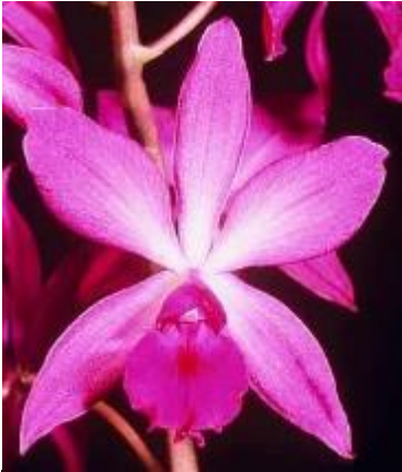
Cty. Purple Glory 'Worldwide' AM/AOS Jun 2004, NS 6.2 x 8.0 cm