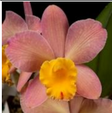
Cattleya Crystelle Smith 'Gold Throat' AM/AOS Nov 2011, NS 7.1 x 6.2 cm (C. Beaufort x C. loddigessi)