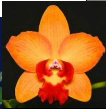
Cattleya Tiny Titan 'Carolyn's Joy' AM/AOS Oct 2017, NS 7.5 x 7.5 cm (C. Precious Stones x C. Beaufort)