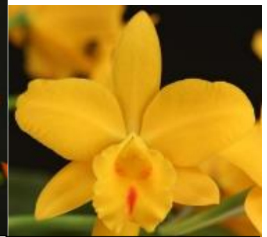
Rhyncattleanthe Free Spirit 'Pure Gold' AM/AOS Mar 2013, NS 8.6 x 8.5 cm (C. Twentyfour Carat x C. Beaufort)