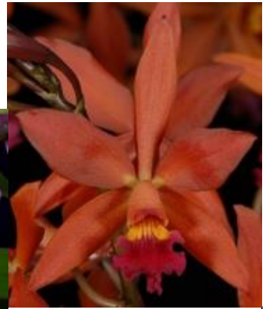
Eny. Memoria Bartley Schwarz 'Salmon Pink' AM/AOS May 2011, NS 8.1 x 9.8 cm (Cty. Purple Glory x Ctt. Trick or Treat)