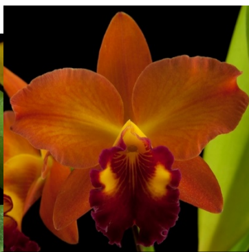
Cattleya Little Toshie 'Chasus' AM/AOS Oct 2012, NS 9.1 x 9.2 cm (C. Beaufort x Rlc. Toshie Aoki)