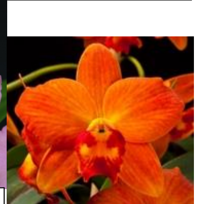
Cattleya Dream Catcher 'Orange Vision' AM/AOS Oct 2011, NS 7.4 x 7.1 cm (C. Bright Angel x C. Beaufort)