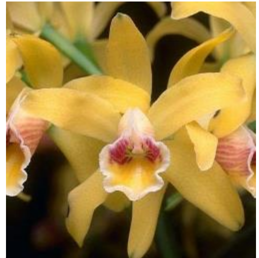
Cattleya luteola 'Best Ever' HCC/AOS Jun 2006, NS 5.7 x 5.0 cm

a terminal, racemose, 1.6" to 6" [4 to 15 cm] long, several flowered inflorescence arising on a mature pseudobulb that is shorter than the leaves. The flowers are pale lemon-yellow concolor, in the type (although they may be apple-green or greenish-yellow), except for the anterior margin of the lip which is white. The side lobes of the lip may be streaked with purple, and there may be a rose flush or pale purple spot on the front of the lip, but these colors are not mentioned in the type. The flowers are long-lived, sometimes fragrant and among the smallest cattleyas in size, 2 inches (5 cm) across.