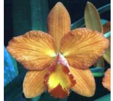
C. Tangerine Imp 'Malinda' AM/AOS Sep 1970, NS 5.9 cm