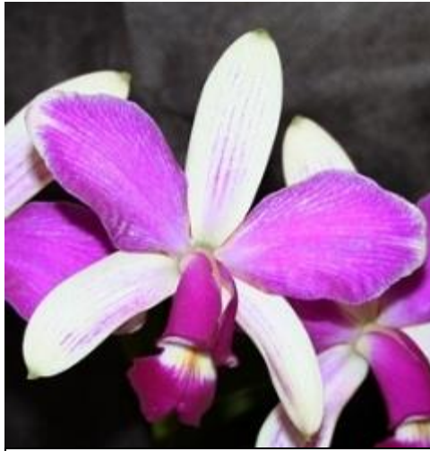
Cattleya violacea (Semi-Alba Flamea) ‘Heliosa’ FCC/AOS Nov 2014, NS 11.4 x 10.7 cm