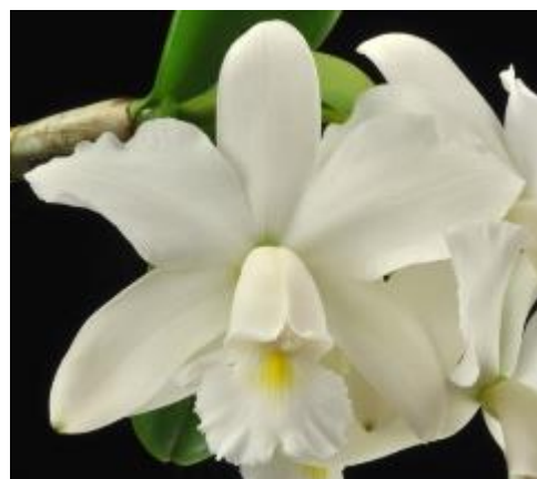
Cattleya violacea f. alba 'Isabel Rosalia' AM/AOS Jul 2017, NS 10.0 x 10.2 cm

Cattleya violacea f. alba – A pure white form