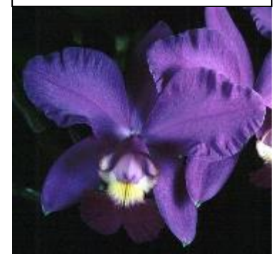
C. Classic 'Rose Etta' HCC/AOS Apr 1998, NS 10.9 x 10.9 cm