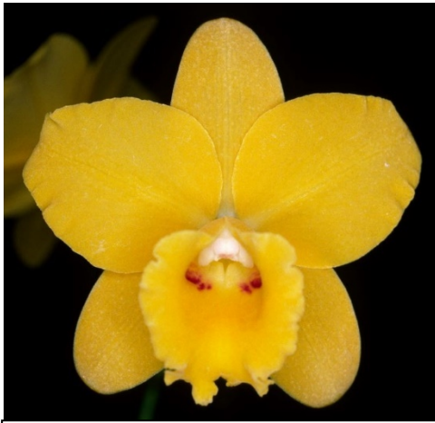
C. Beaufort 'Orchid Centre' AM/AOC Mar 1991, NS 5.8 x 5.8 cm

Cattleya Beaufort – There are two common awarded color varieties, yellow (various shades) and orange-red (orange, reddish orange) as shown in the two pictures. I believe the variety used most in breeding (and awarded the most) is the yellow version. Details provided in prior table for C. Beaufort and the other grexes shown. The selected grexes shown are: C. Crystelle Smith, C. Lana Coryell, C. Tiny Titan, Rth. Free Spirit, C. Jungle Beau, Rlc. Little Toshie, C. Royal Beau, C. Dream Catcher.