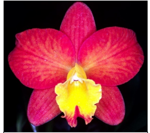
C. Beaufort 'South River' AM/AOS Oct 1985, NS 5.4 cm

Cattleya Beaufort – There are two common awarded color varieties, yellow (various shades) and orange-red (orange, reddish orange) as shown in the two pictures. I believe the variety used most in breeding (and awarded the most) is the yellow version. Details provided in prior table for C. Beaufort and the other grexes shown. The selected grexes shown are: C. Crystelle Smith, C. Lana Coryell, C. Tiny Titan, Rth. Free Spirit, C. Jungle Beau, Rlc. Little Toshie, C. Royal Beau, C. Dream Catcher.