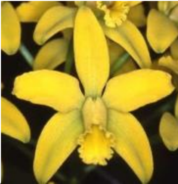
C. Pixie Gold 'Cat's Paw Jonquilla' AM/AOS Jan 2008, NS 5.5 x 6.0 cm