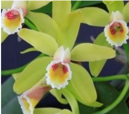
Cattleya luteola 'Amanda' HCC/AOS Apr 2016, NS 4.4 x 5.3 cm

A dwarf sized, unifoliate, cool to warm growing epiphytic species found in Brazil, Peru, Ecuador and Bolivia, in lowland tropical rain forests at elevations between 100 and 1200 meters and occasionally up to 2000 meters. It has a slender creeping rhizome giving rise to clavate, ellipsoid or clavate-cylindrical sulcate pseudobulbs carrying a single, apical, oblong or oblong-elliptic, notched leaf that may have a red flush under bright light growing conditions. It blooms from late summer till early winter on