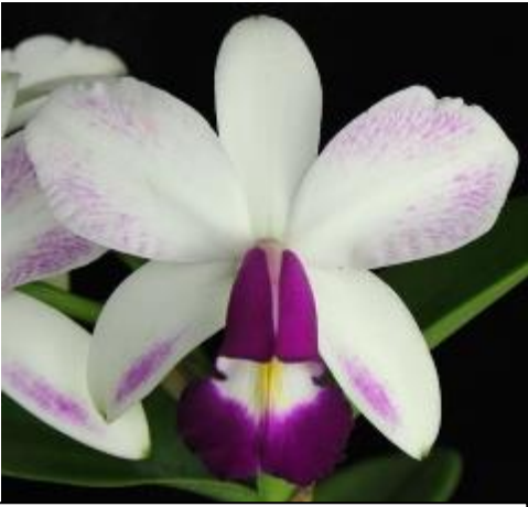
Cattleya violacea (Semi-Alba Flamea) ‘Valley Isle’ AM/AOS Mar 2015, NS 11.2 x 11.0 cm

Cattleya violacea (Flamea) and Cattleya violacea (Semi-Alba Flamea) – White sepals and petals with varying amounts of overlaid ‘purple’. See C. violacea ‘Mirtha Isabel’ FCC/AOS, C. violacea ‘Heliosa’ FCC/AOS, C. violacea ‘Valley Isle’ AM/AOS, and C. violacea ‘Odom’s Orchids’ AM/AOS as examples.