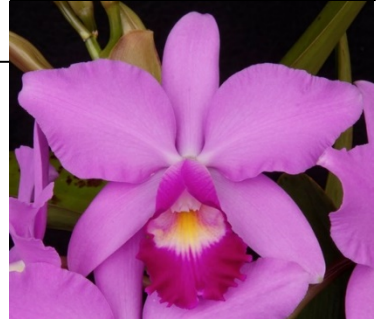
C. Greg Allikas 'Sunset Valley Orchids' HCC/AOS Oct 2015, NS 12.1 x 11.4 cm (C. labiata x C. violacea)