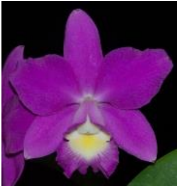
C. Walnut Valley Sparky 'Max & Bryon' AM/AOS Nov 2016, NS 10.2 x 10.4 cm (C. Walnut Valley Beautiful x C. Brian Carwile)