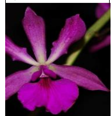
Cty. Alden Reese 'Ashley's Breeze' AM/AOS May 2009, NS 6.8 x 7.5 cm