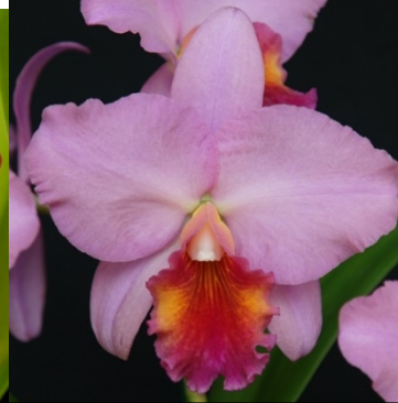
Cattleya Royal Beau 'Hihimanu' AM/AOS Apr 2015, NS 10.7 x 9.0 cm (C. Princess Bells x C. Beaufort)