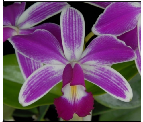
Cattleya violacea (Flamea) ‘Odom’s Orchids’ AM/AOS Apr 2012, NS 11.2 x 10.9 cm