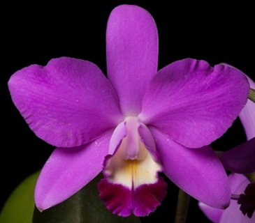
Cattleya Brian Carwile 'Florida SunCoast' AM/AOS Mar 2013, NS14.0 x 13.5 cm