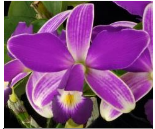
Cattleya violacea (Semi-Alba Flamea) ‘Mirtha Isabel’ FCC/AOS Nov 2017, NS 11.5 x 10.6 cm