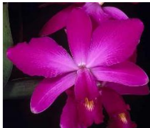
Cattleya violacea 'Jean Wilson' FCC/AOS Apr 2004, NS 13.0 x 12.3 cm

Cattleya violacea is found in Colombia, Venezuela, the Guianas, Brazil, Bolivia, Peru and Ecuador at elevations of 200 to 700 meters in exposed locations on trees near rivers in low, hot, wet tropical forests. Although it has the widest distribution in nature of all cattleyas the habitat is very uniform resulting in a deliberate growing habit. Cattleya violacea is a small to medium sized, hot to warm growing, ascending, bifoliate epiphyte with clavate, slightly compressed, elongate clustered 4 – 12" (10 – 30 cm) long pseudobulbs. The two oblong-elliptic to oblong-ovoid leaves are 2.5 – 6" (6 – 16 cm) long and up to 3.5" (8.5 cm) wide. Blooming from spring through the fall, sometimes blooming twice a year, on a terminal, 3 to 12" [8 - 30 cm] long, erect or