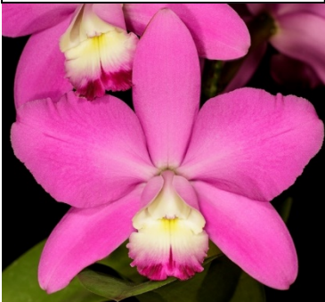
C. Breautiana 'Hynson Bayou' AM/AOS Jun 2017, NS 13.0 x 12.3 cm

Catyclia [Cty.] Purple Glory (E. adenocaula x C. violacea), 1962, W. W. G. Moir, 21 F1 and 29 total progeny, 3 AM/AOS awards. Some of the major progeny: