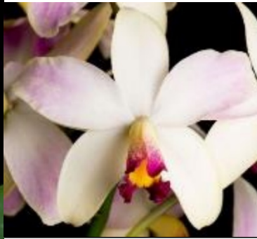
C. John Broderick 'Flamer' AM/AOS May 2017, NS 7.4 x 7.5 cm (C. briegeri x C. violacea)