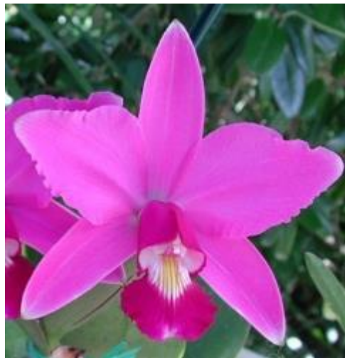
Cattleya violacea 'Muse' FCC/AOS Aug 1983, NS 13.0 cm

Cattleya violacea is found in Colombia, Venezuela, the Guianas, Brazil, Bolivia, Peru and Ecuador at elevations of 200 to 700 meters in exposed locations on trees near rivers in low, hot, wet tropical forests. Although it has the widest distribution in nature of all cattleyas the habitat is very uniform resulting in a deliberate growing habit. Cattleya violacea is a small to medium sized, hot to warm growing, ascending, bifoliate epiphyte with clavate, slightly compressed, elongate clustered 4 – 12" (10 – 30 cm) long pseudobulbs. The two oblong-elliptic to oblong-ovoid leaves are 2.5 – 6" (6 – 16 cm) long and up to 3.5" (8.5 cm) wide. Blooming from spring through the fall, sometimes blooming twice a year, on a terminal, 3 to 12" [8 - 30 cm] long, erect or