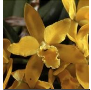
C. Yellow Doll 'Mitzi' AM/AOS Jan 1970, NS 5.1 cm

Cattleya Tangerine Imp (C. Tangerine Jewel x C. luteola), 1982, Richella, 16 F1 and 39 total progeny, 18 AOS awards (7 AMs, 11 HCCs). Some of the major progeny: C. Quantum Leap (C. Tangerine Imp x C. Orpetii), 1993, D. Neuendorff, 11 F1 and 21 total progeny, no AOS awards; Rth. Atomic Glow (Rth. Free Spirit x C. Quantum Leap), 1999, D. Neuendorff, 6 F1 and 8 total progeny, no AOS awards; Ctna. Quantum Spirit (Ctna. Capri x C. Quantum Leap), 2001, D. Neuendorff, 2 F1 progeny, no AOS awards.