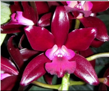
Ctt. Loog Tone 'African Beauty' AM/AOS Jul 2009, NS 9.2 x 10.1 cm

Cattleya Pixie Gold (C. crispata x C. luteola), 1964, Rod McLellan Co., 30 F1 and 51 total progeny, 4 AOS awards (3 AMs, 1 CCMs). No major progeny.