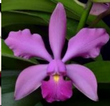
Ety. Louise Odom 'Odom's Orchids' AM/AOS May 2012, NS 5.2 x 6.5 cm (Cty. Latin Purple x E. Standard Setter)